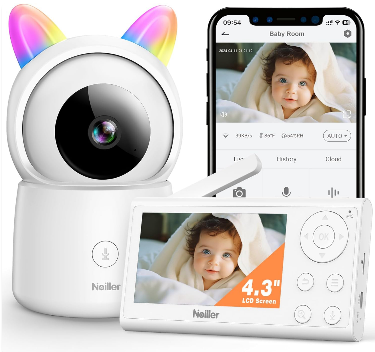
The NOILLER Baby Monitor system, showing the camera, handheld monitor, and smartphone application interface.