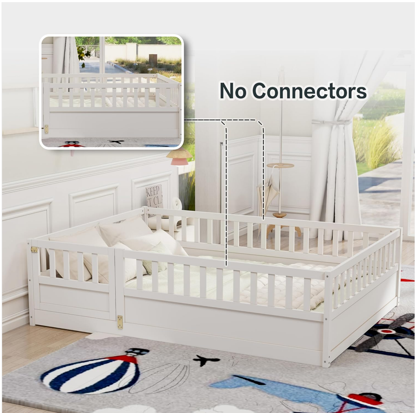
Image: The bed frame design, emphasizing the integrated appearance of the rails without external connectors.