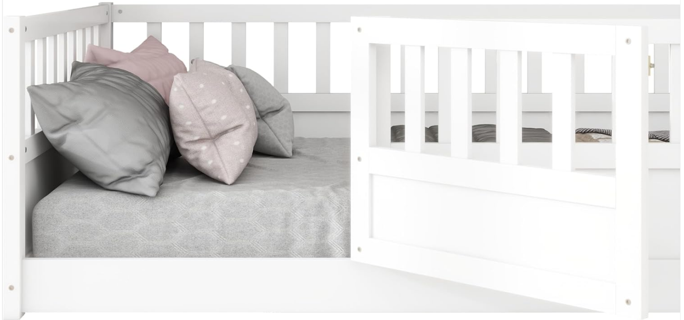
Image: The bed's door in an open position, demonstrating how it can overlap the adjacent rail for convenient entry and exit.