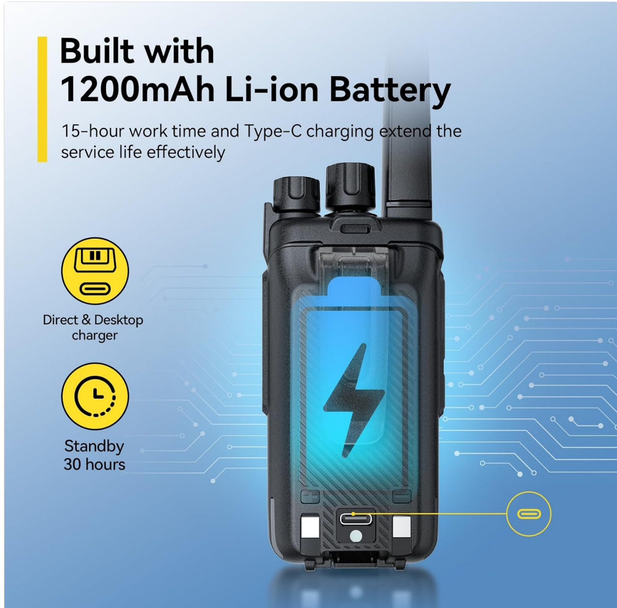
Image: The RT668H radio with its 1200mAh Li-ion battery and Type-C charging capability, indicating 15 hours of work time and 30 hours standby.