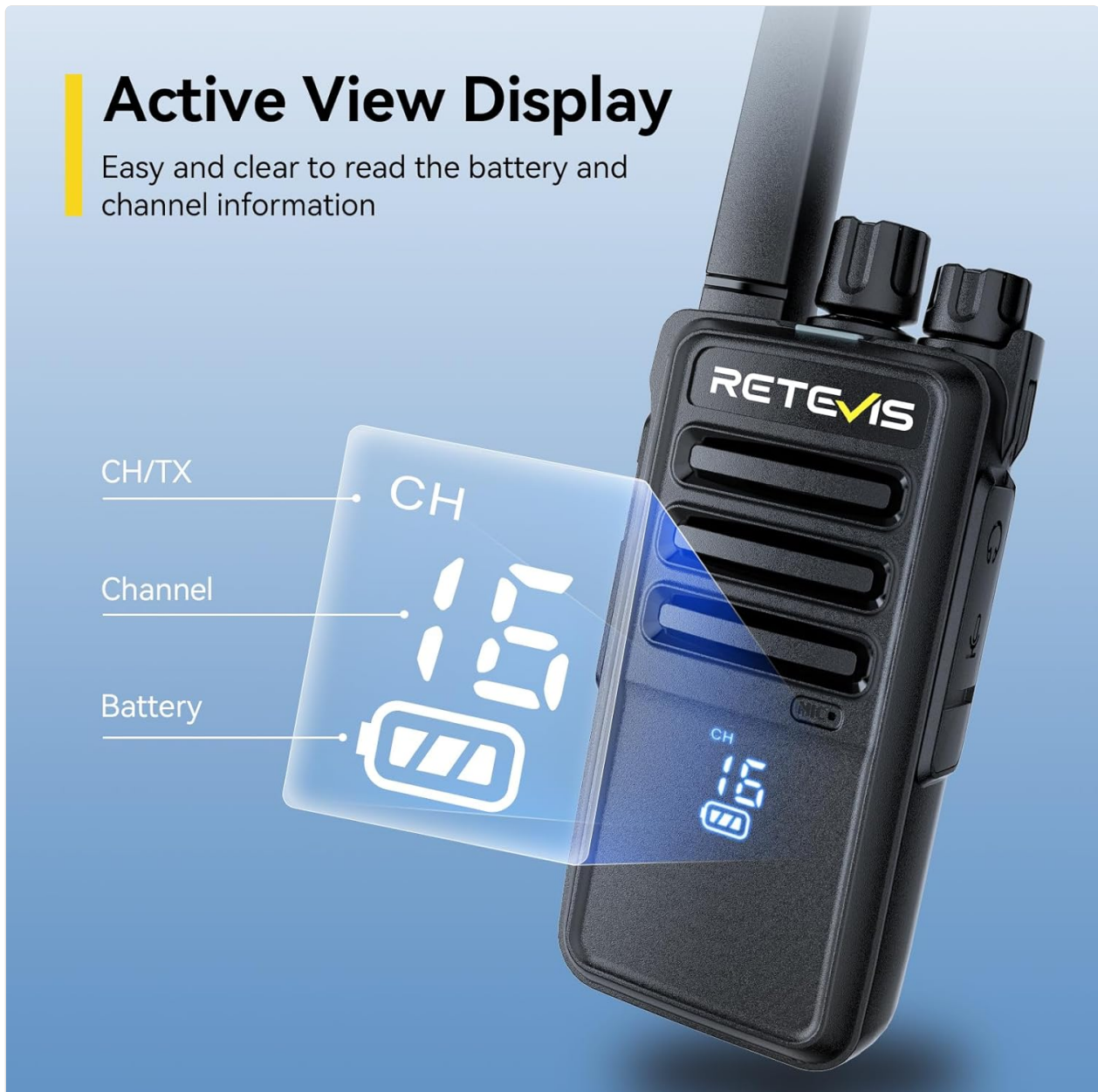
Image: The Active View Display of the RT668H, clearly showing channel and battery information.