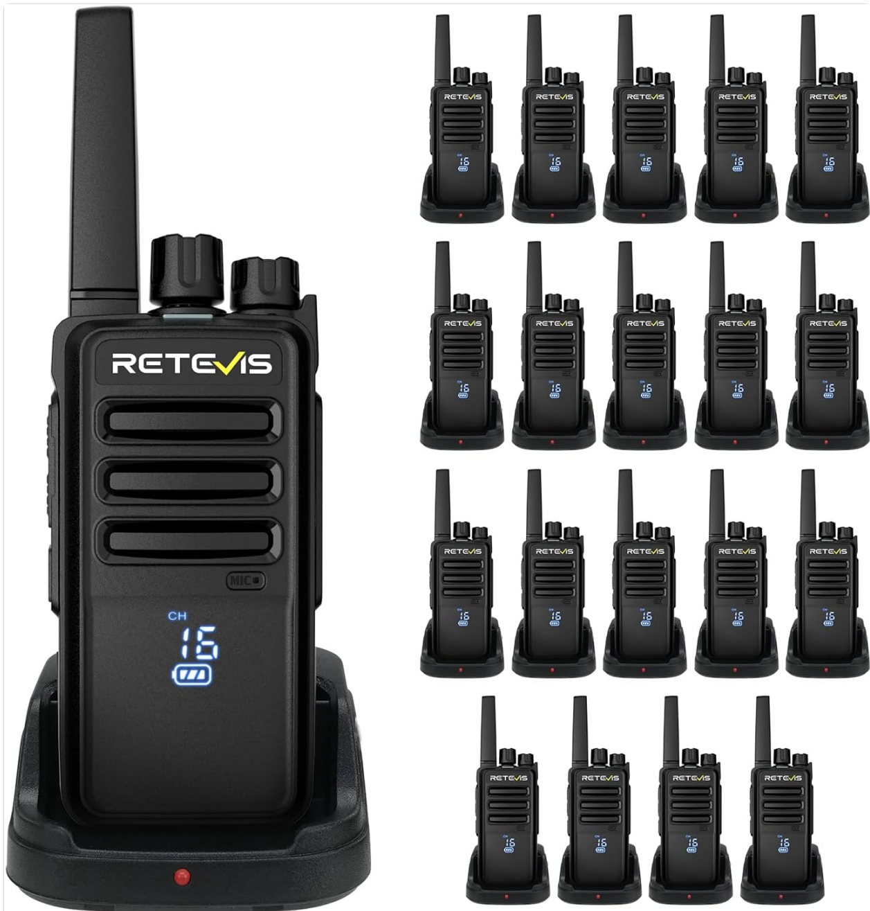
Image: The Retevis RT668H two-way radio, showcasing its design and charging base.