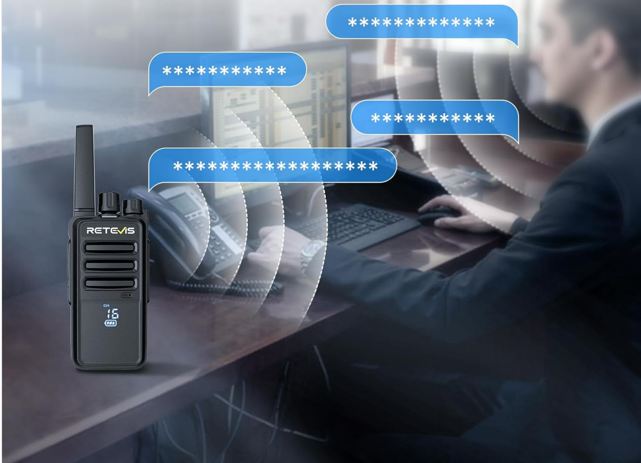
Image: Illustration of the VOX hands-free function, allowing direct talk without pressing the PTT key.

No need to press the PTT key, direct to talk