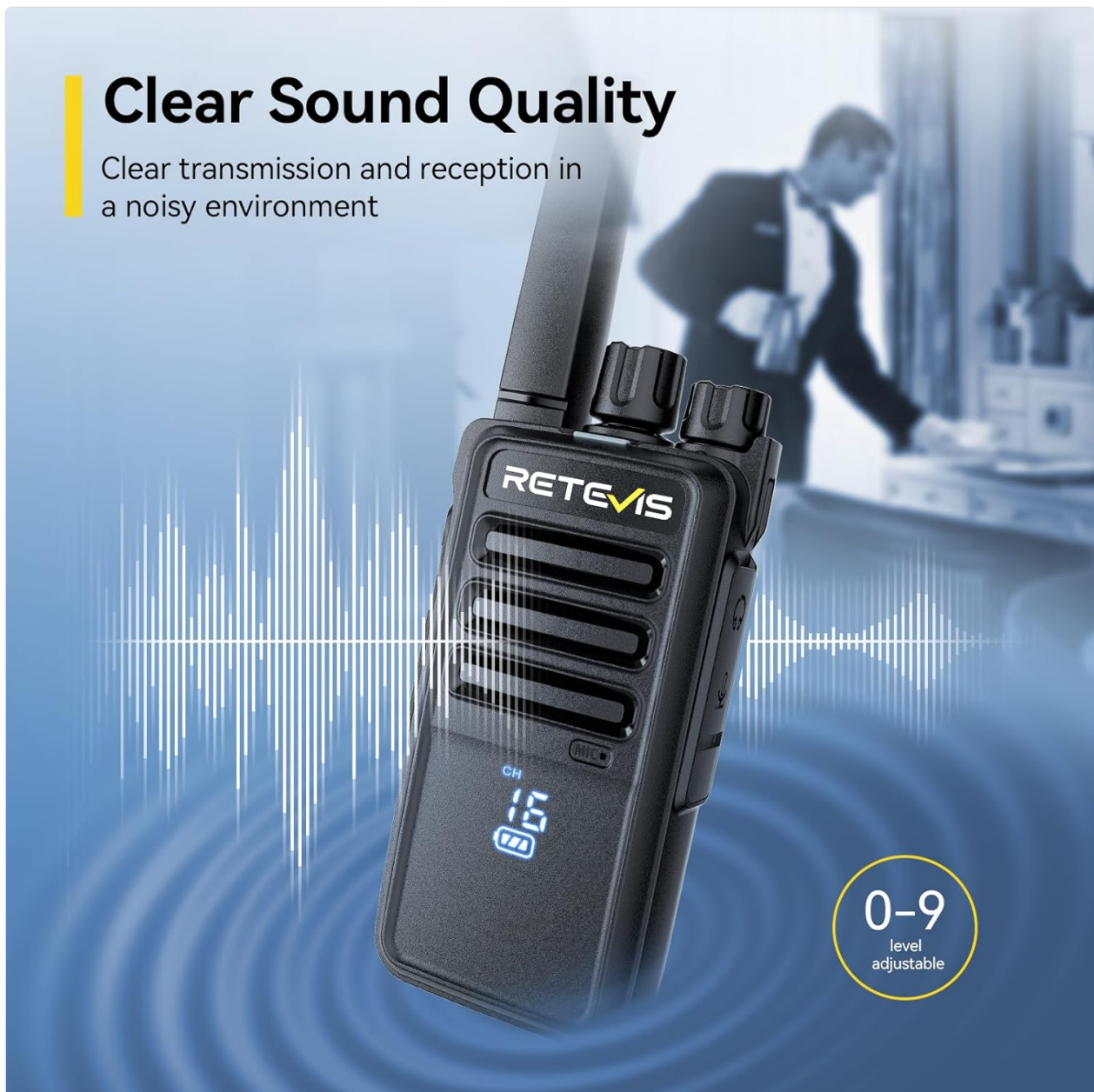
Image: The RT668H radio demonstrating clear sound quality with adjustable squelch levels (0-9).

the microphone. Release the PTT button to stop transmitting and return to receive mode.