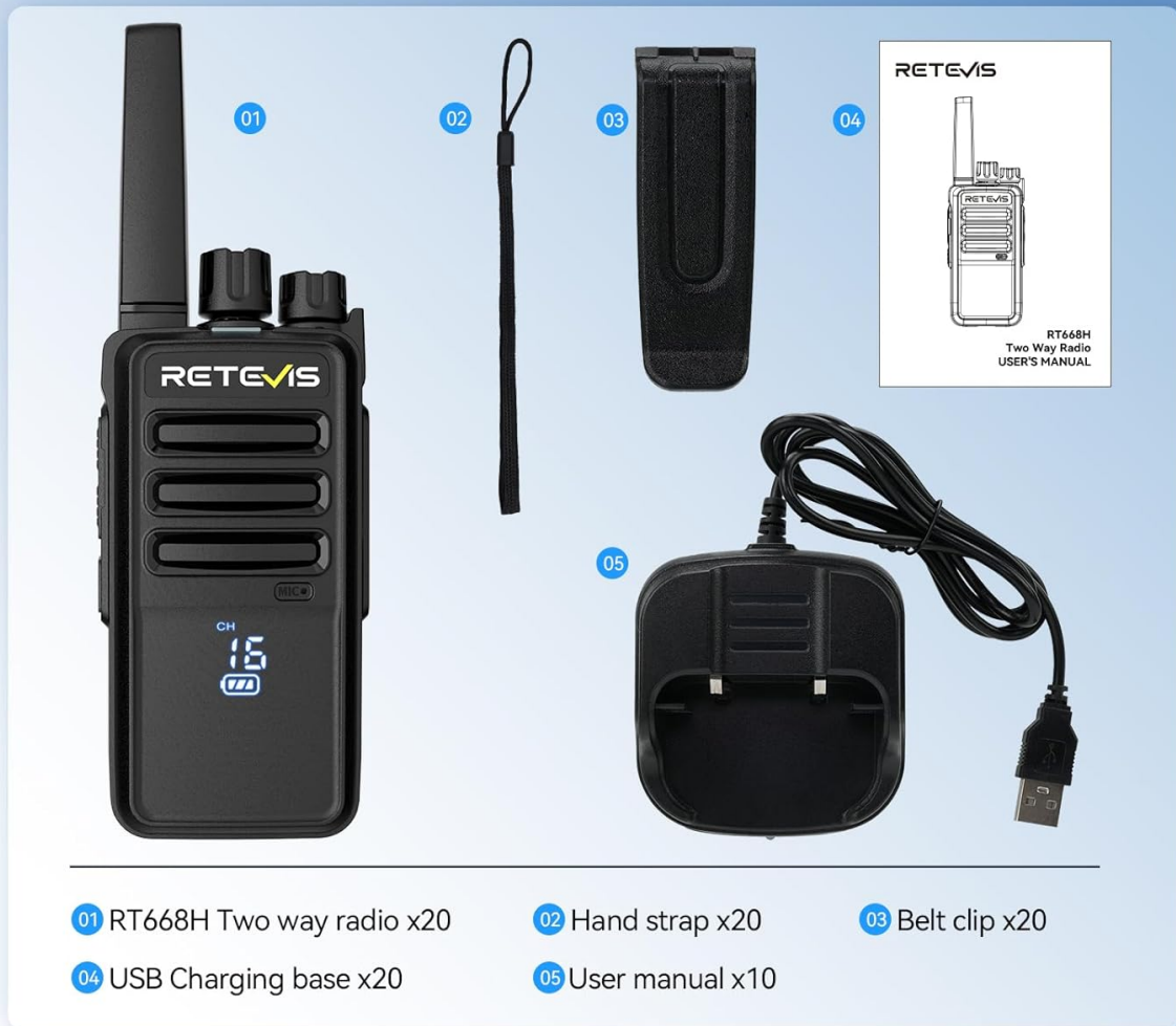
Image: Package contents for the Retevis RT668H radio. This includes the RT668H two-way radio, hand strap, belt clip, USB charging base, and user manual.