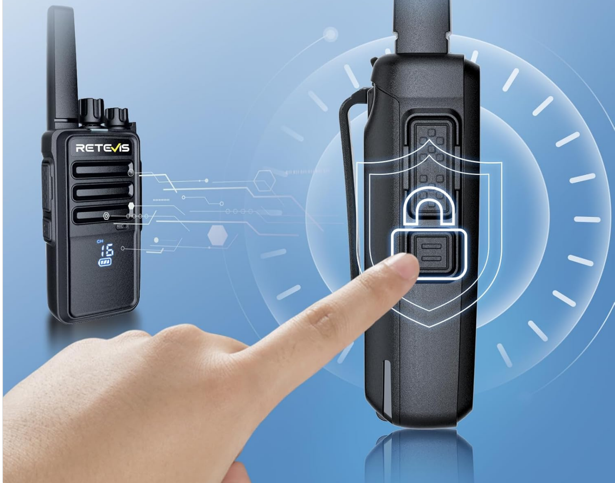
Image: The Key Lock feature, designed to prevent accidental operations and maintain connection with team members.

To activate or deactivate the key lock, typically press and hold a designated button (often the 'Menu' or a programmable side button) for a few seconds. Consult the full user manual for specific button assignments.