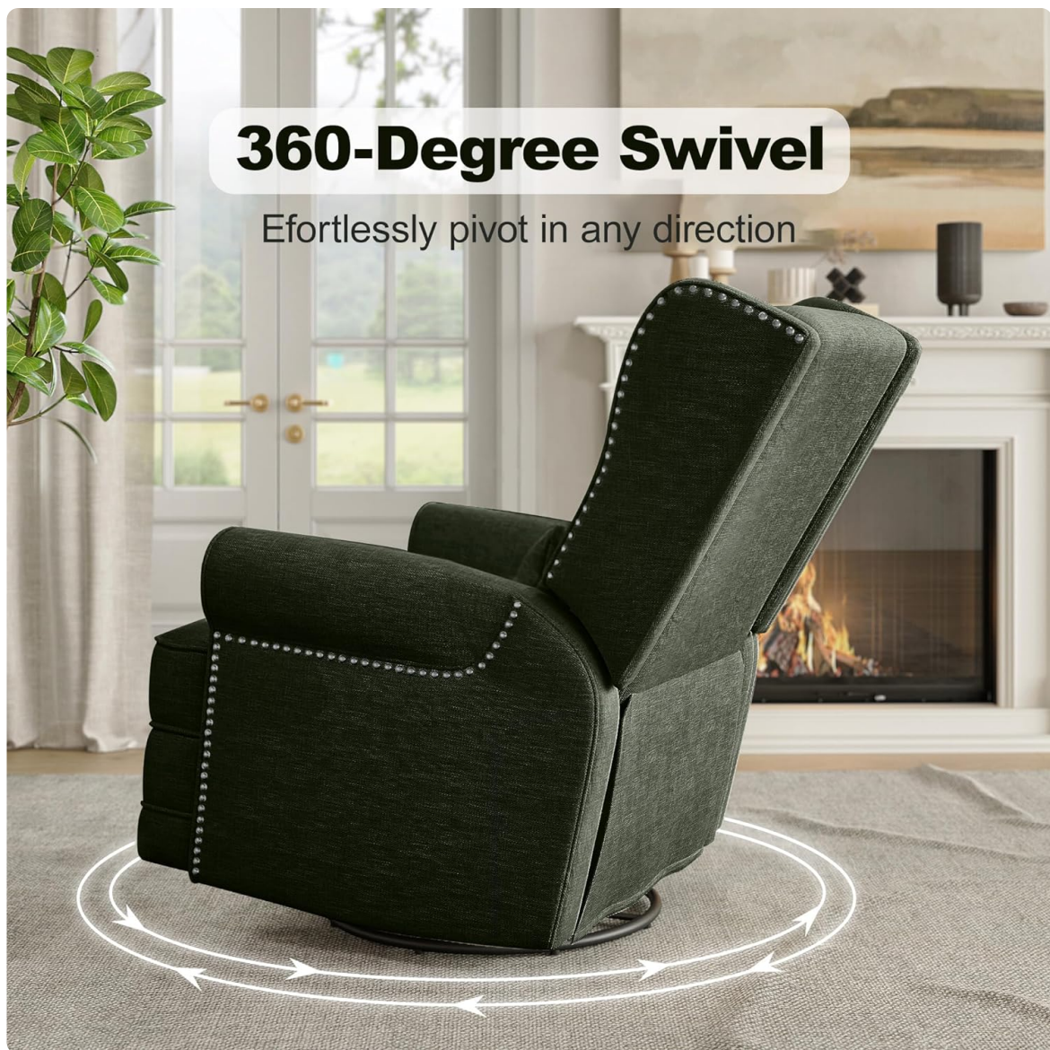
Image: The chair illustrating its 360-degree swivel capability, allowing effortless pivoting in any direction.