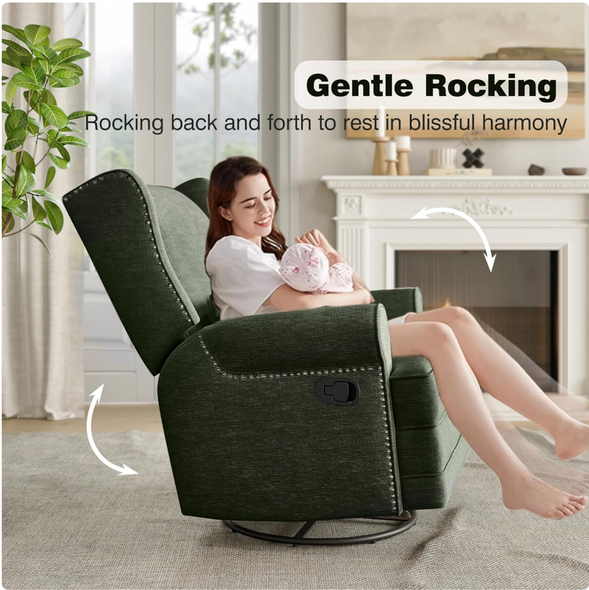
Image: A person gently rocking in the chair, highlighting its soothing motion.

Rocking back and forth to rest in blissful harmony