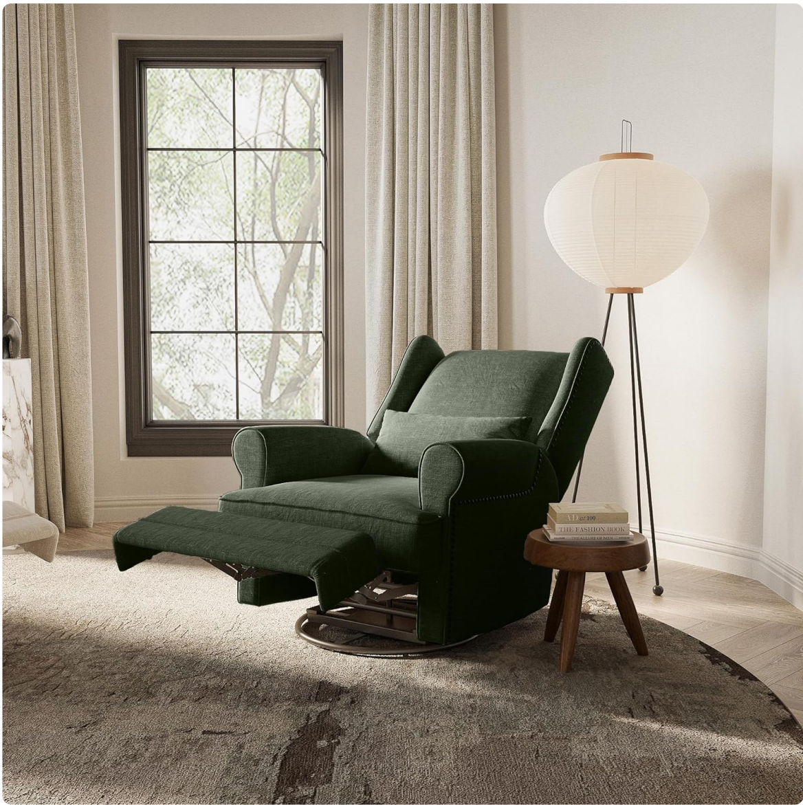
Image: The RoyalCraft Swivel Recliner Chair in a fully reclined position with the footrest extended, showcasing its comfort for relaxation.