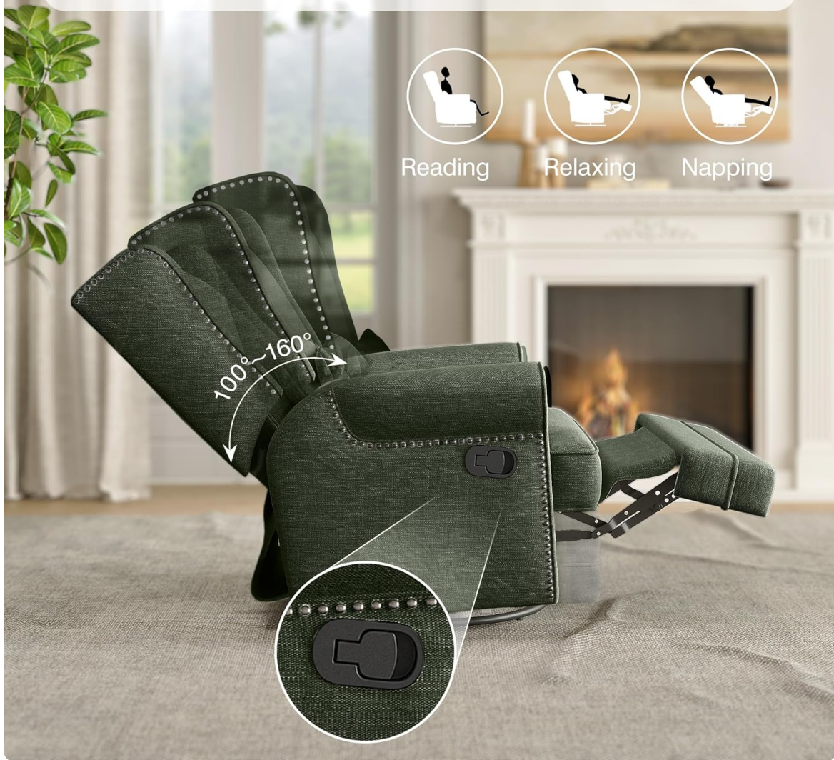
Image: Diagrams showing various comfortable positions from reading to napping, demonstrating the chair's reclining range (100°-160°).