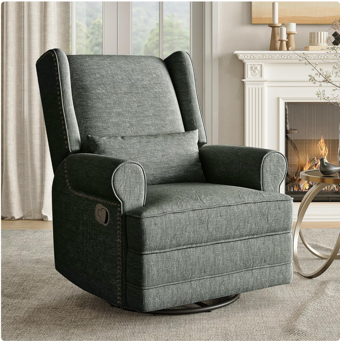
Image: The RoyalCraft Swivel Recliner Chair in Dark Green, featuring its upholstered design and comfortable appearance.