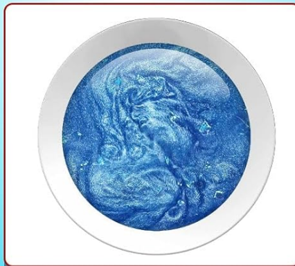
MAGICAL SAND ART IN WATER