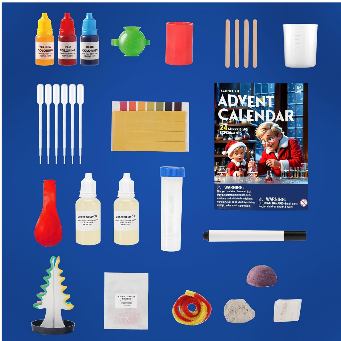
Image: Detailed view of various chemicals and tools.