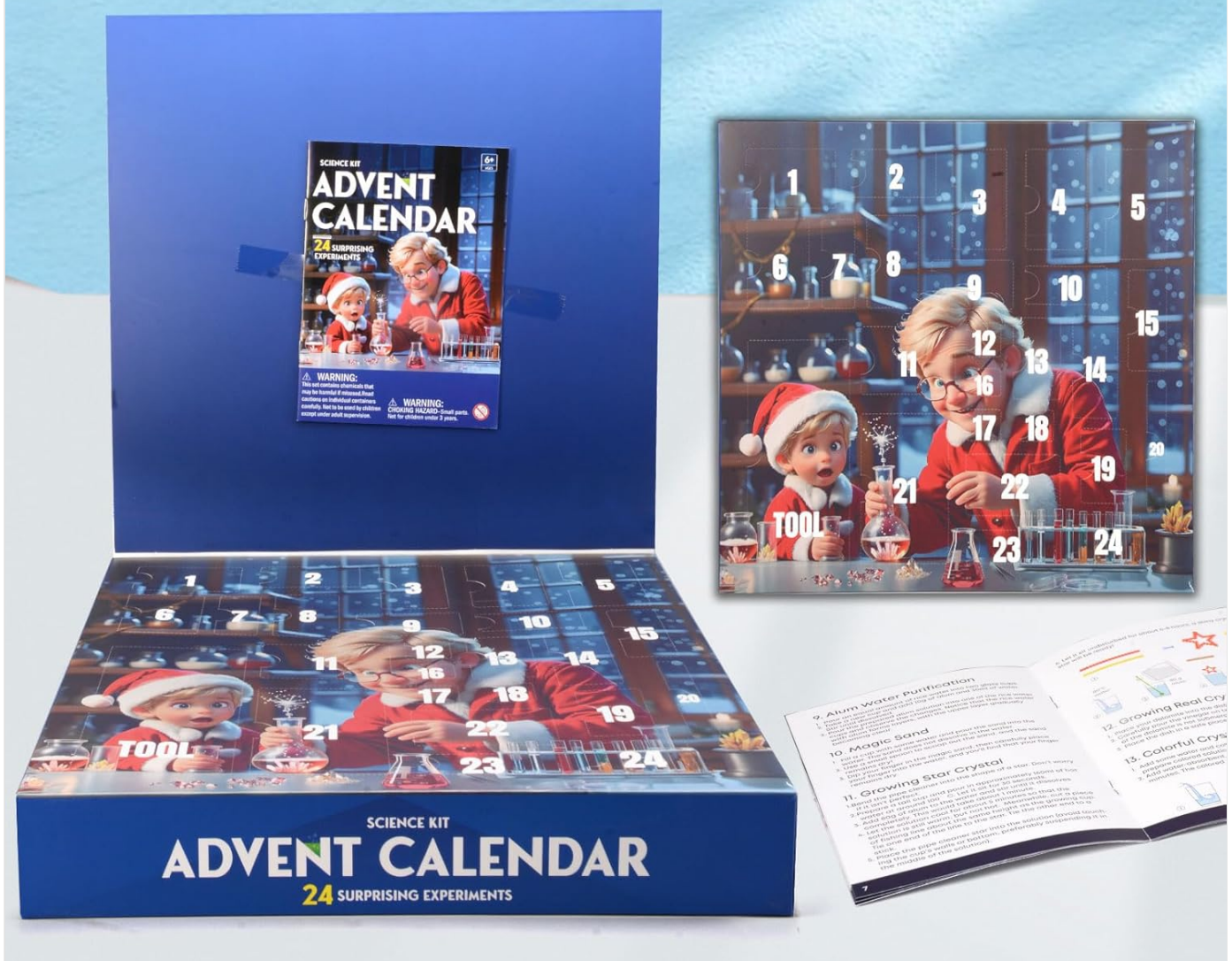
Image: The advent calendar box with its numbered compartments.