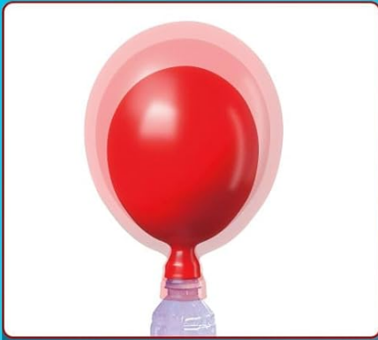
BALLOON BLOWING EXPERIMENT