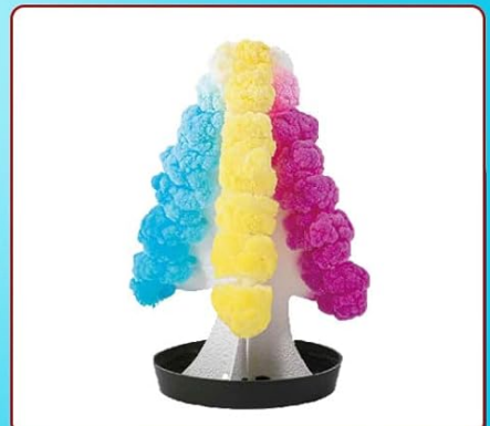
CRYSTAL TREE GROWING

Image: Visual representation of the Crystal Tree Growing Experiment.