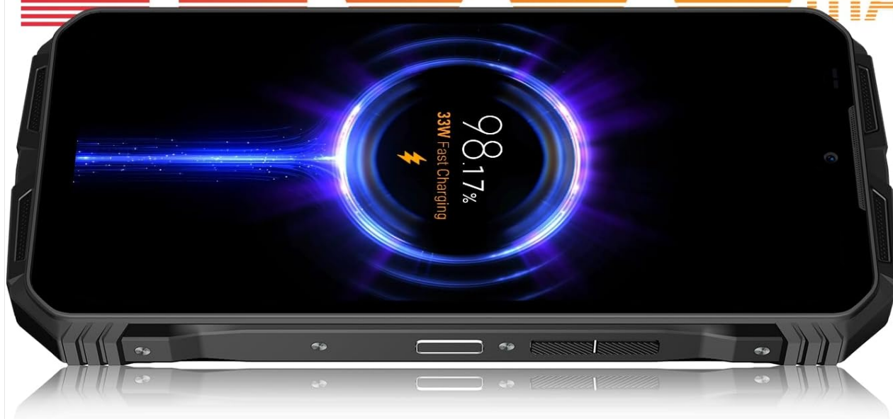
Figure 4: The 22000mAh Mega Battery and 33W fast charging capability.