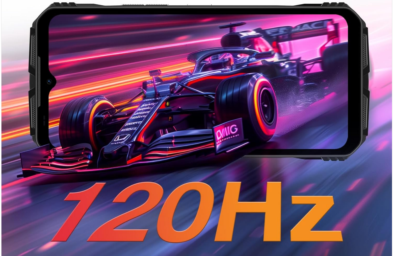
Figure 5: The 6.58-inch FHD+ 120Hz display.