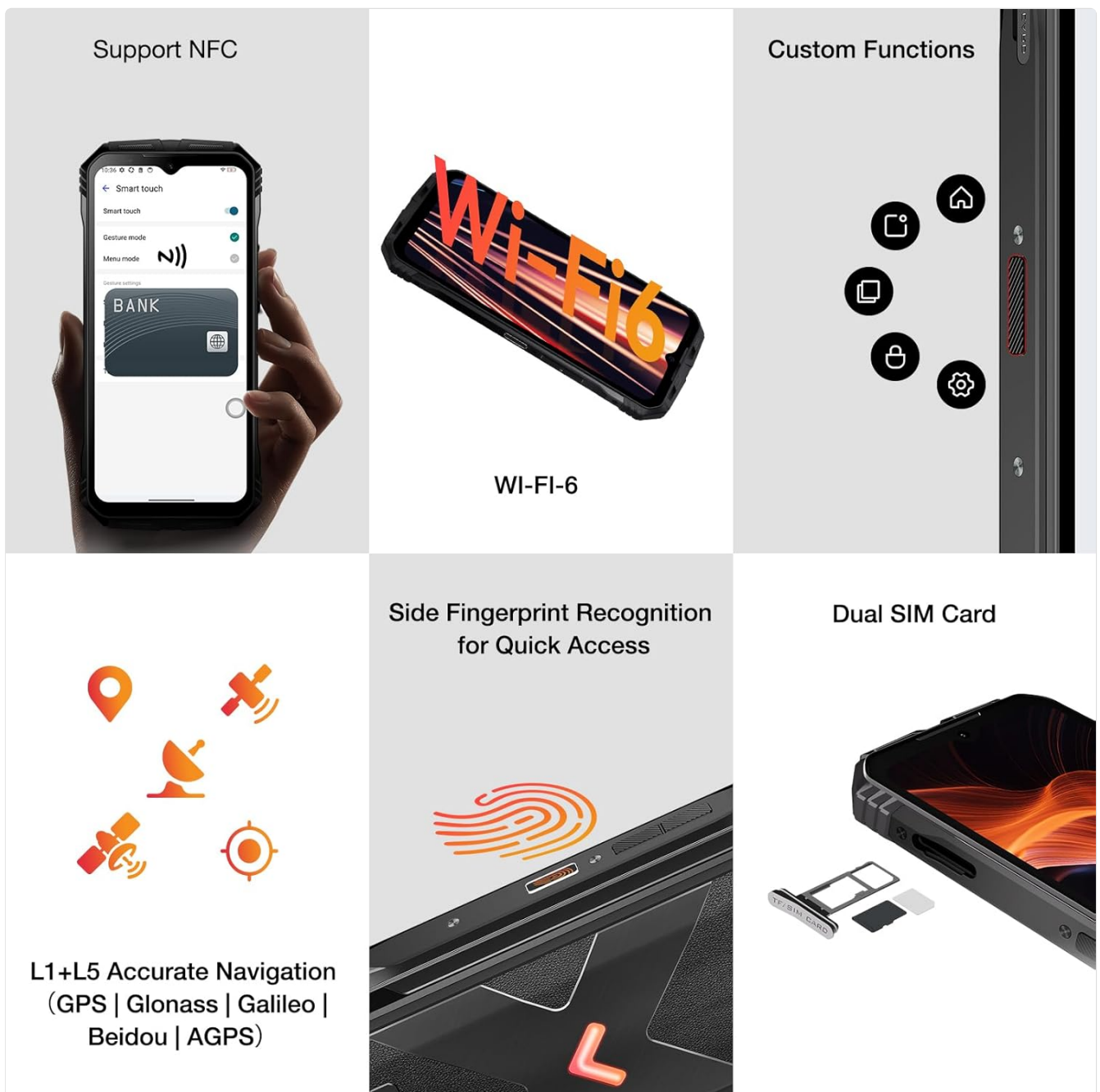
Figure 3: Dual SIM card slot and other connectivity features.