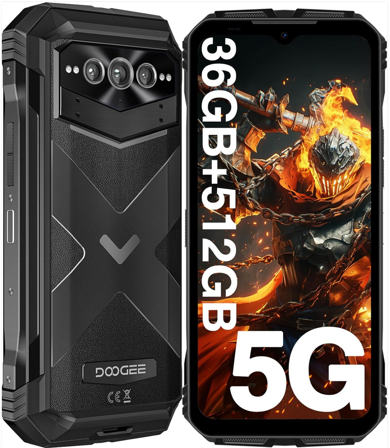
Figure 1: Front and back view of the DOOGEE V MAX Plus Rugged Smartphone.