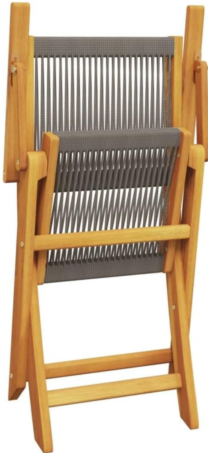
Image: The vidaXL garden chair in its folded configuration, demonstrating its compact design for convenient storage.