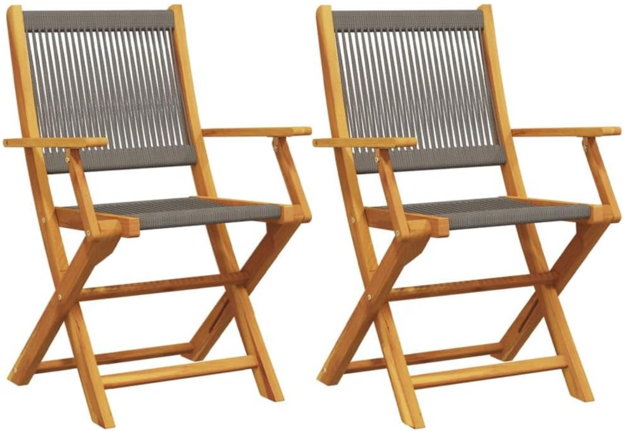
Image: The vidaXL 2 Piece Foldable Garden Chair Set, showcasing both chairs in their unfolded state, highlighting the grey polypropylene seating and solid Acacia wood frames.