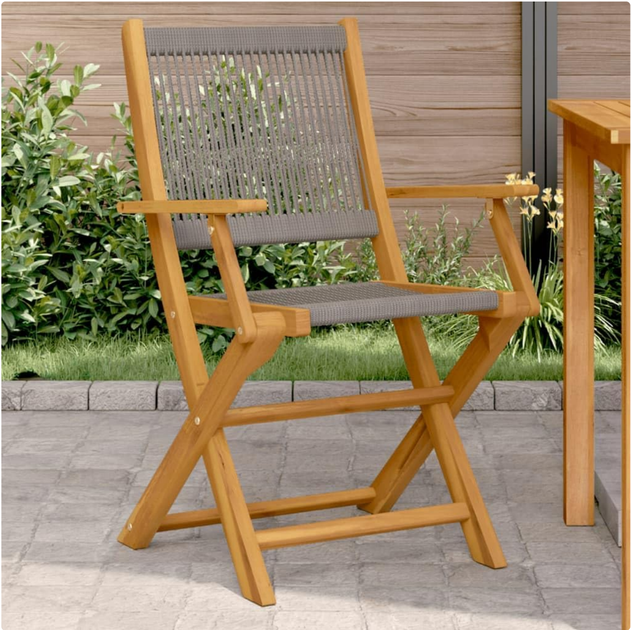
Image: A single vidaXL garden chair positioned on a patio, surrounded by greenery, demonstrating its suitability for outdoor environments.