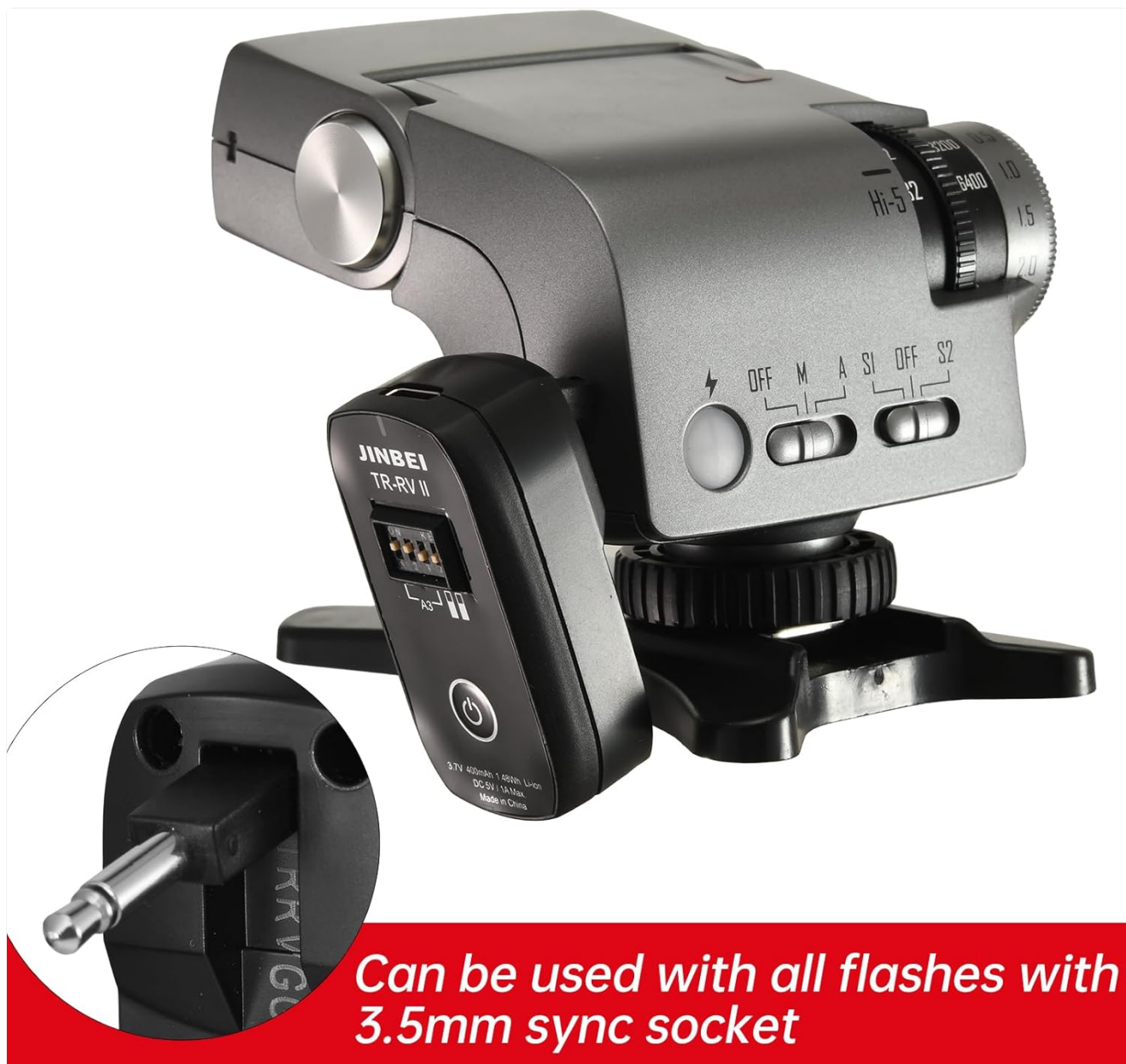
Figure 3.2: The TR-RVII receiver connected to a flash unit via its 3.5mm sync plug.