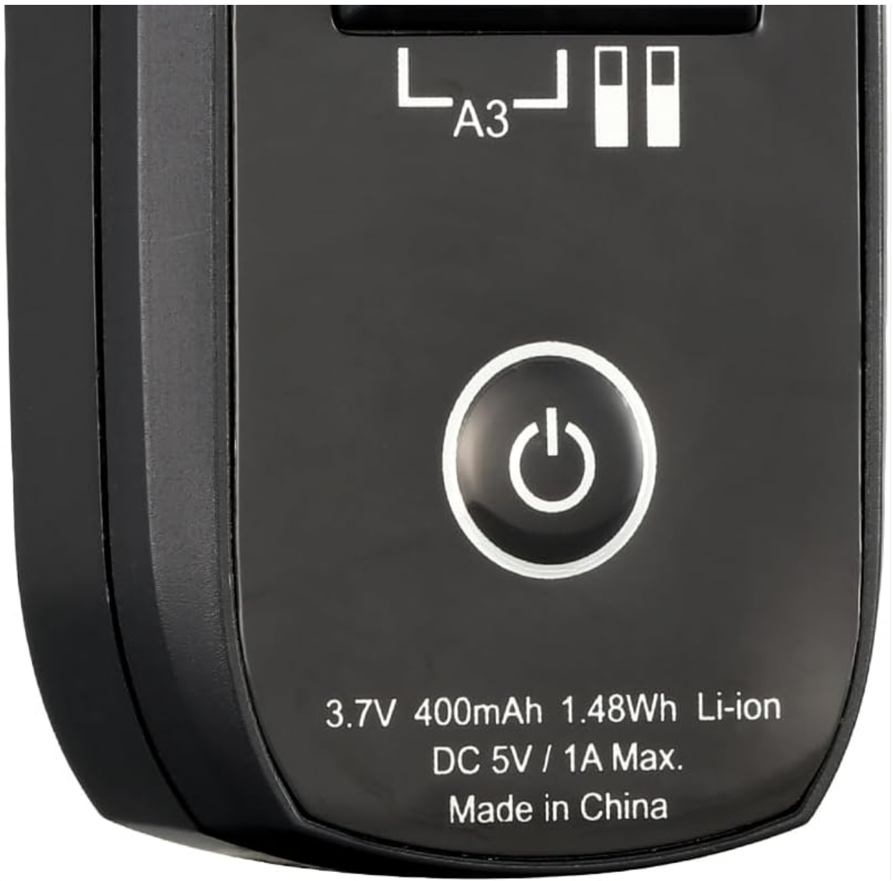
Figure 2.1: Front view of the JINBEI TR-RVII Flash Receiver, showing the channel switches and power button.