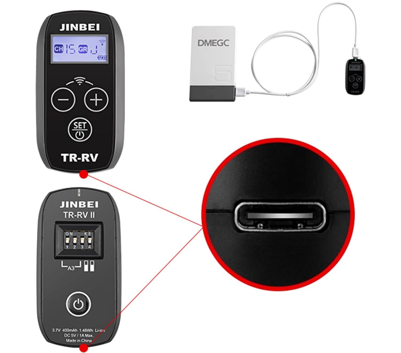
Figure 3.1: Illustration of the channel switch and its settings. 'ON' indicates '0', and 'OFF' (not ON) indicates '1'.

Refer to the table below for channel configuration: