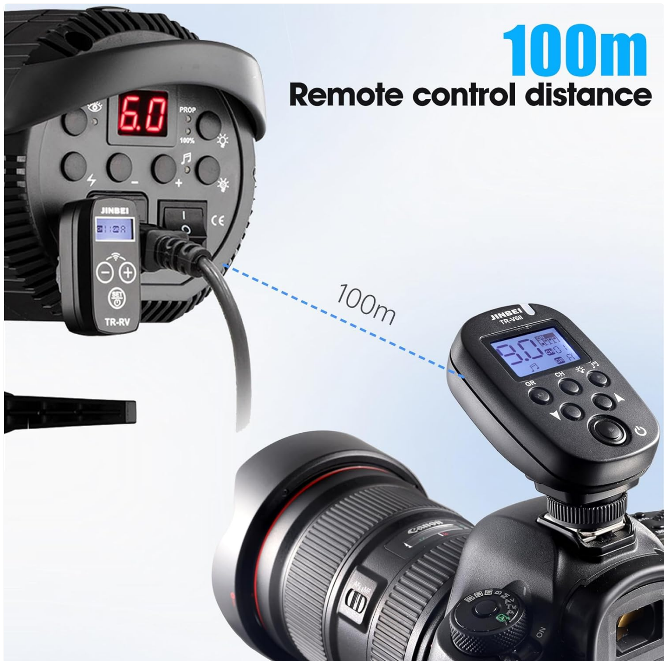
Figure 4.2: The TR-RVII offers a remote control distance of up to 100 meters (39 inches), providing ample range for various shooting scenarios.