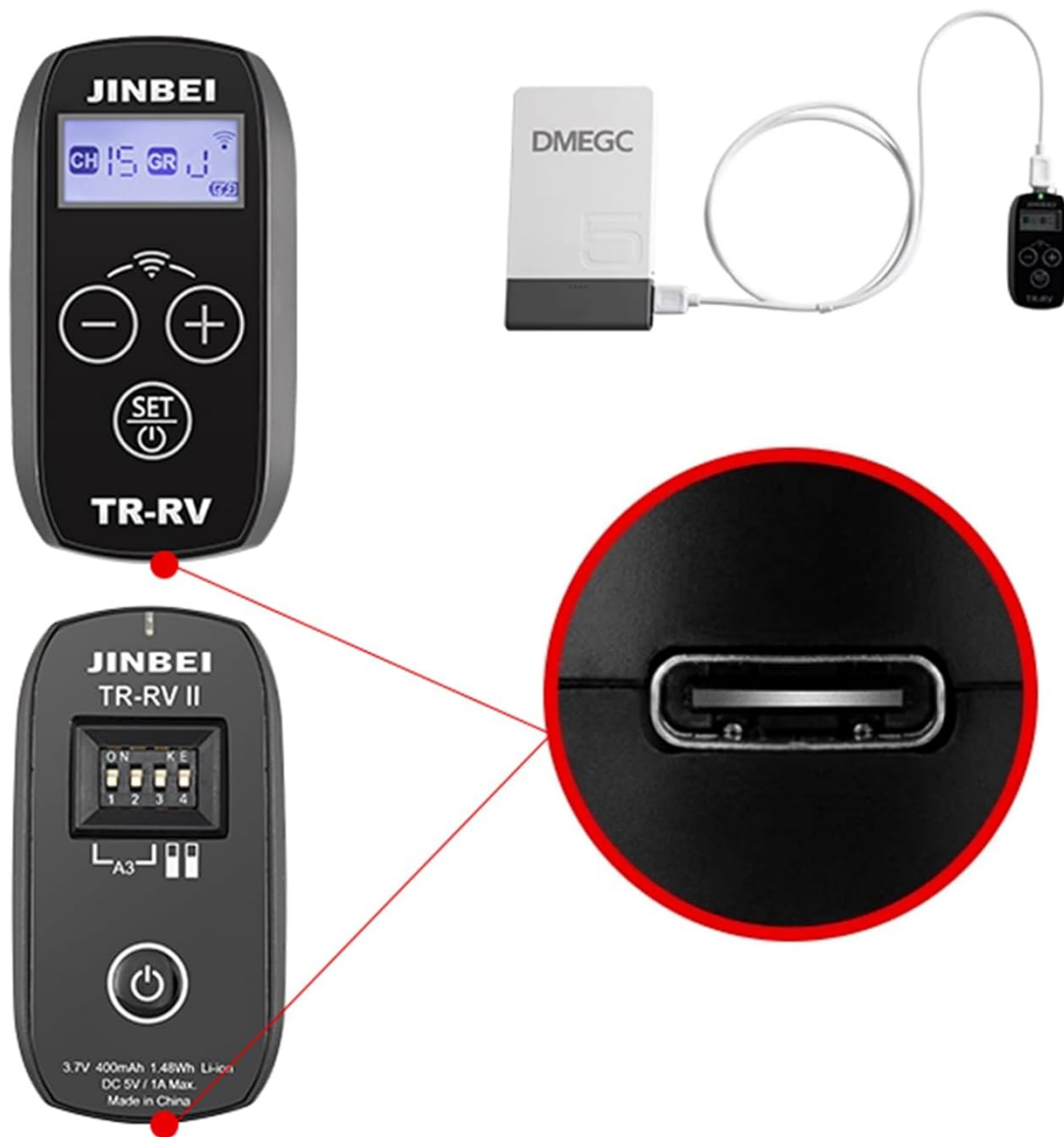
Figure 2.2: Labeled components of the TR-RV receiver, indicating the Status Indicator, Channel Adjustment Switch, and Power button.