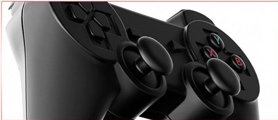
Image: A detailed view of the wireless controller, highlighting its multiple keys and ergonomic design for precise control during gameplay.

IT CAN BE CONTROLLED WITH HIGHER PRECISION