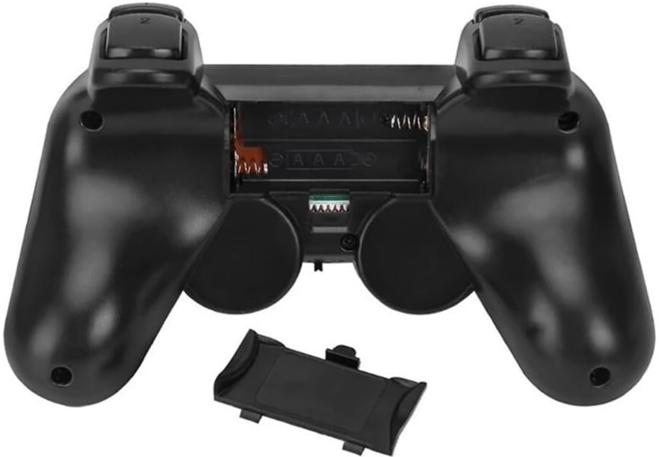
Image: Wireless controller with its battery compartment open, illustrating the correct placement for two AAA batteries.