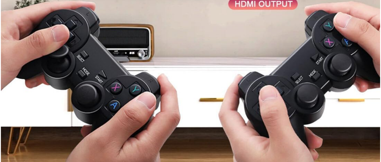
Image: The X2 4K Retro Game Stick connected to a television, demonstrating the HDMI output and wireless controller usage for a plug-and-play experience.