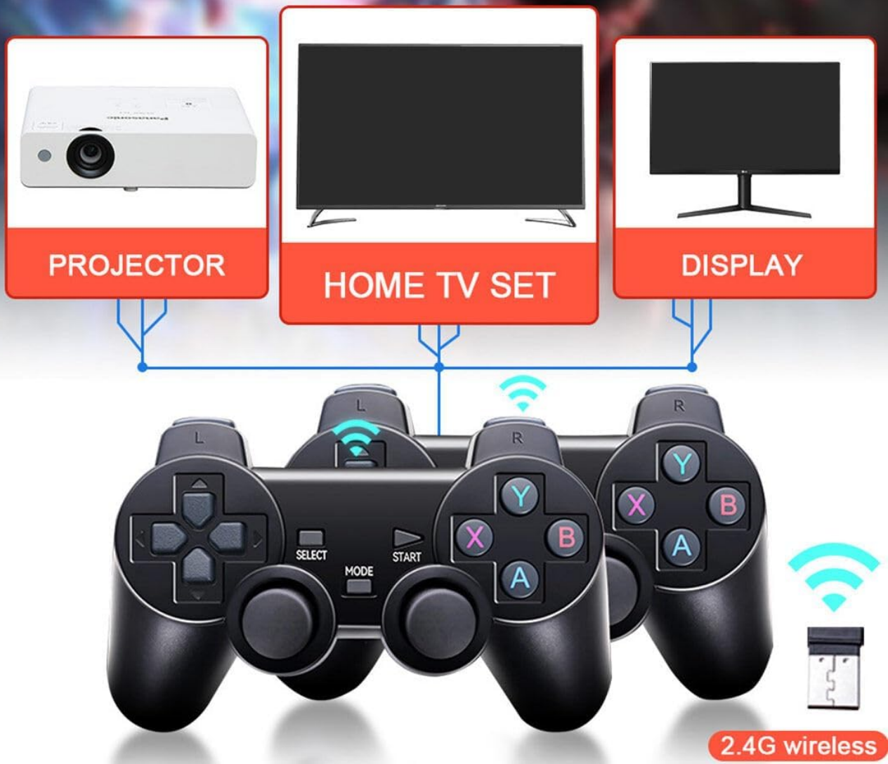
Image: Illustration of the game stick's compatibility with various display platforms, including projectors, home televisions, and computer monitors, all connected via HDMI.