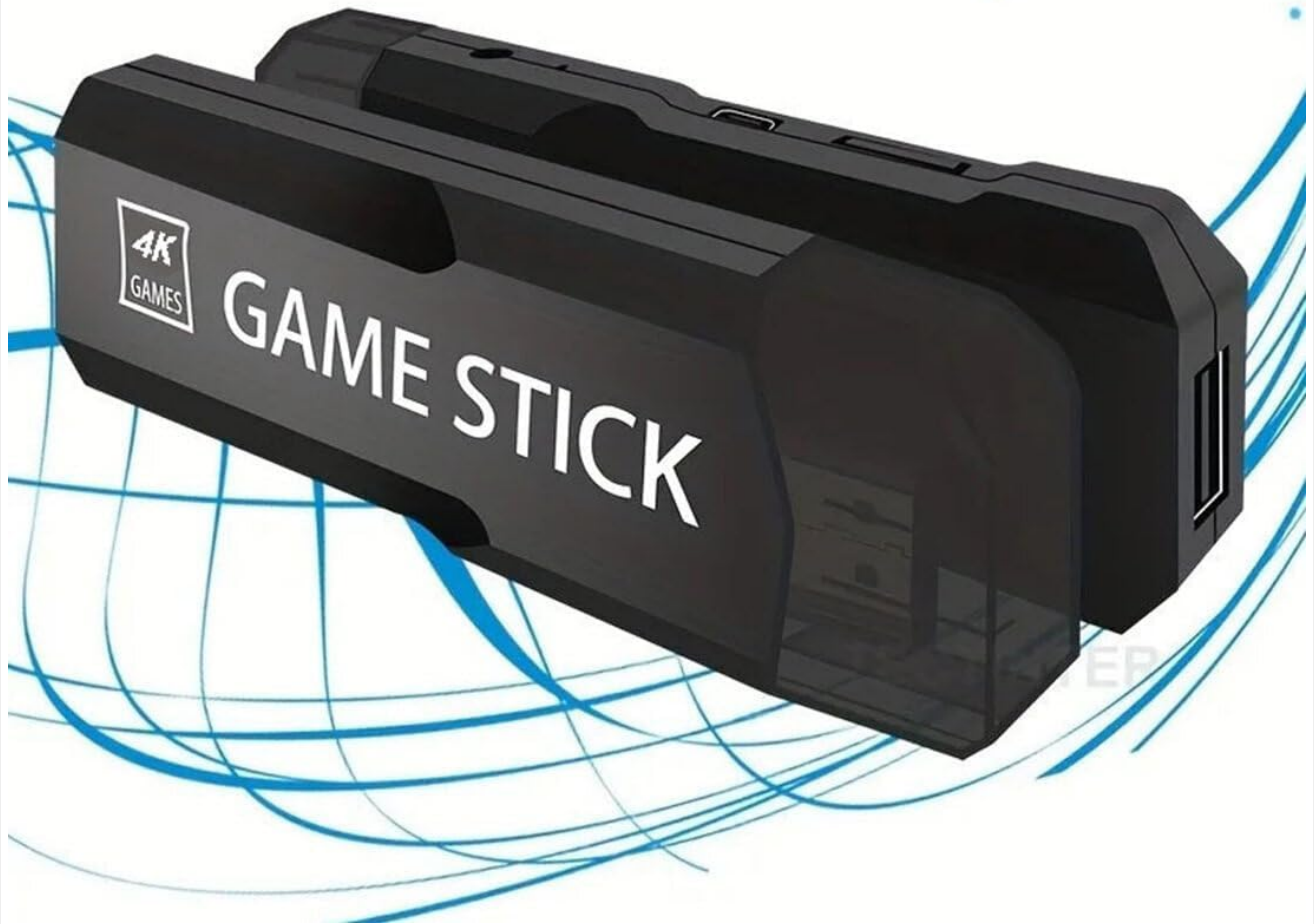
Image: The X2 4K Retro Game Stick, highlighting its capability to support more than 20 different languages for a global user experience.