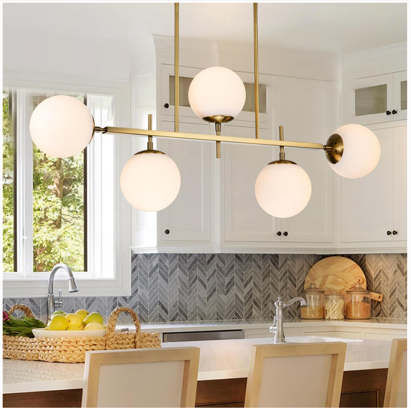
Figure 1.1: EDISLIVE Modern Milk Globe Chandelier (Gold-Frosted Bubble, 39.4in-5 Light)