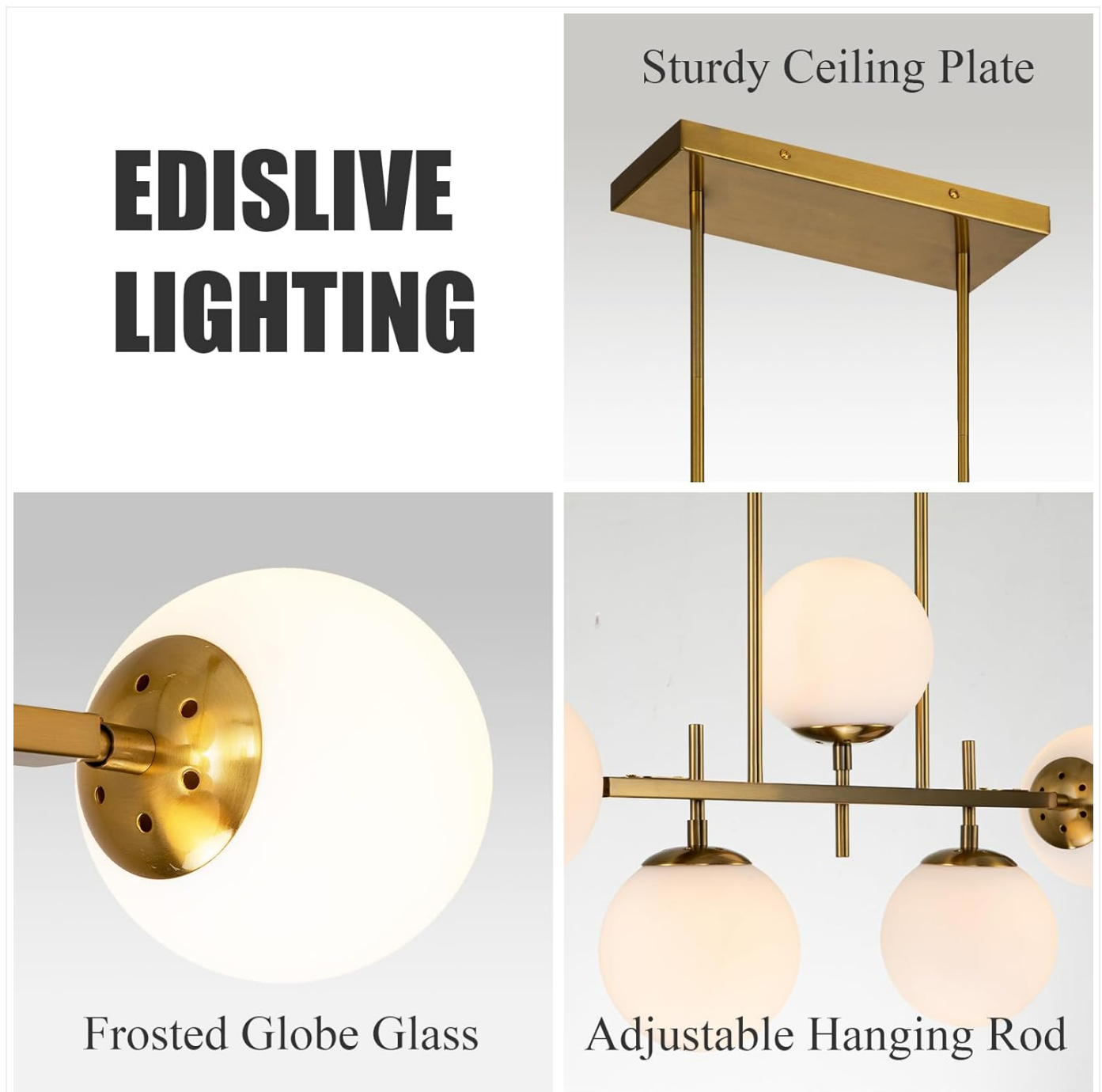
Figure 3.1: Key components of the chandelier.