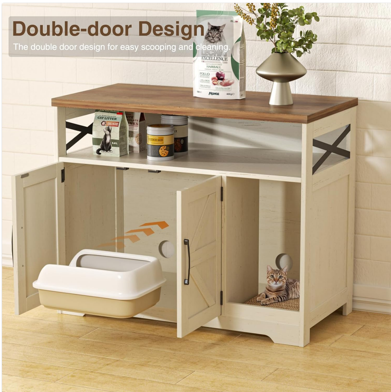
Image: Double-door design for easy access and cleaning.

The double door design for easy scooping and cleaning.