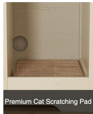
Premium Cat Scratching Pad