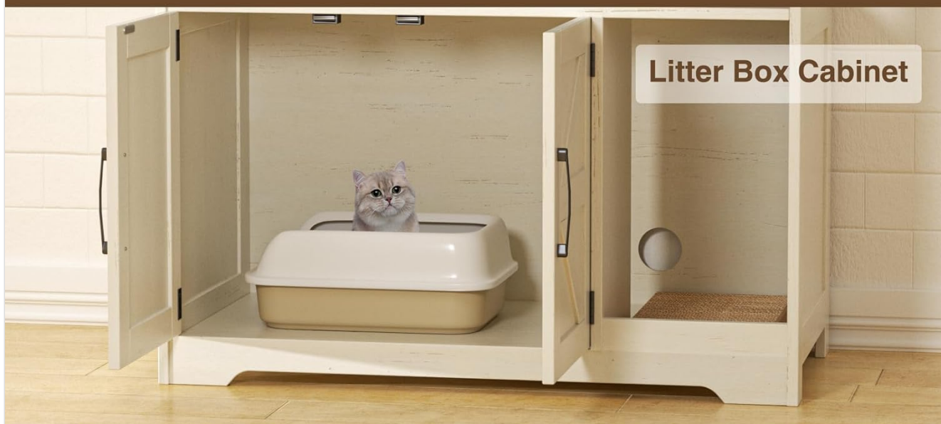
Image: Two ways of usage: as a cozy cat house or a litter box cabinet.