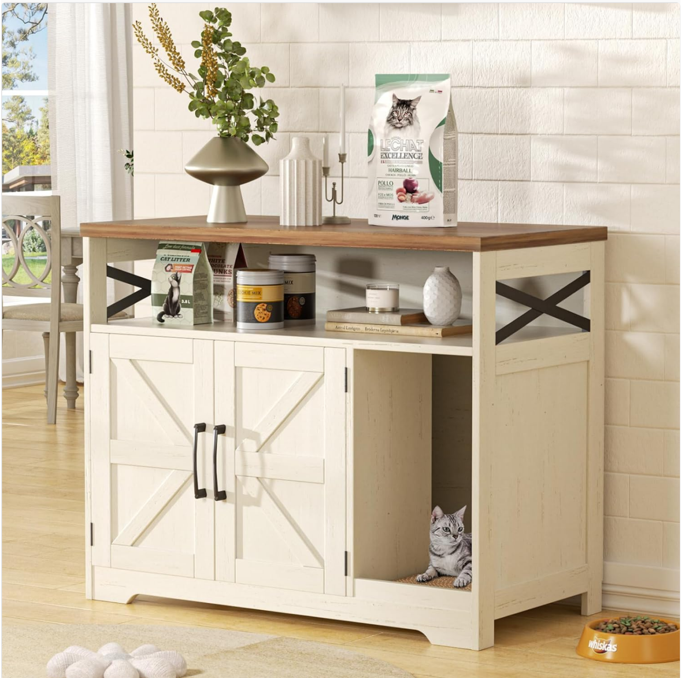
Image: Fully assembled Halitaa Cat Litter Box Enclosure.