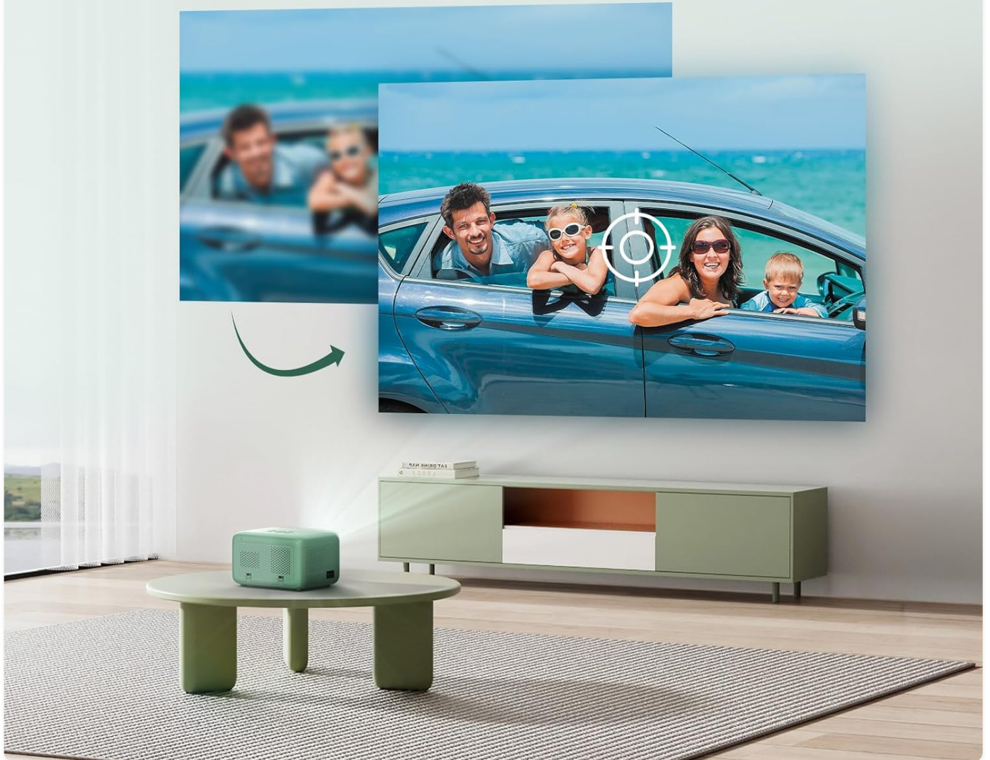
Figure 4.1: The projector automatically focuses within 3 seconds, eliminating the need for manual focus adjustments. The image shows a blurred projection transforming into a sharp, clear image of a family in a car.

Get clear image in 2 seconds with Auto Focus