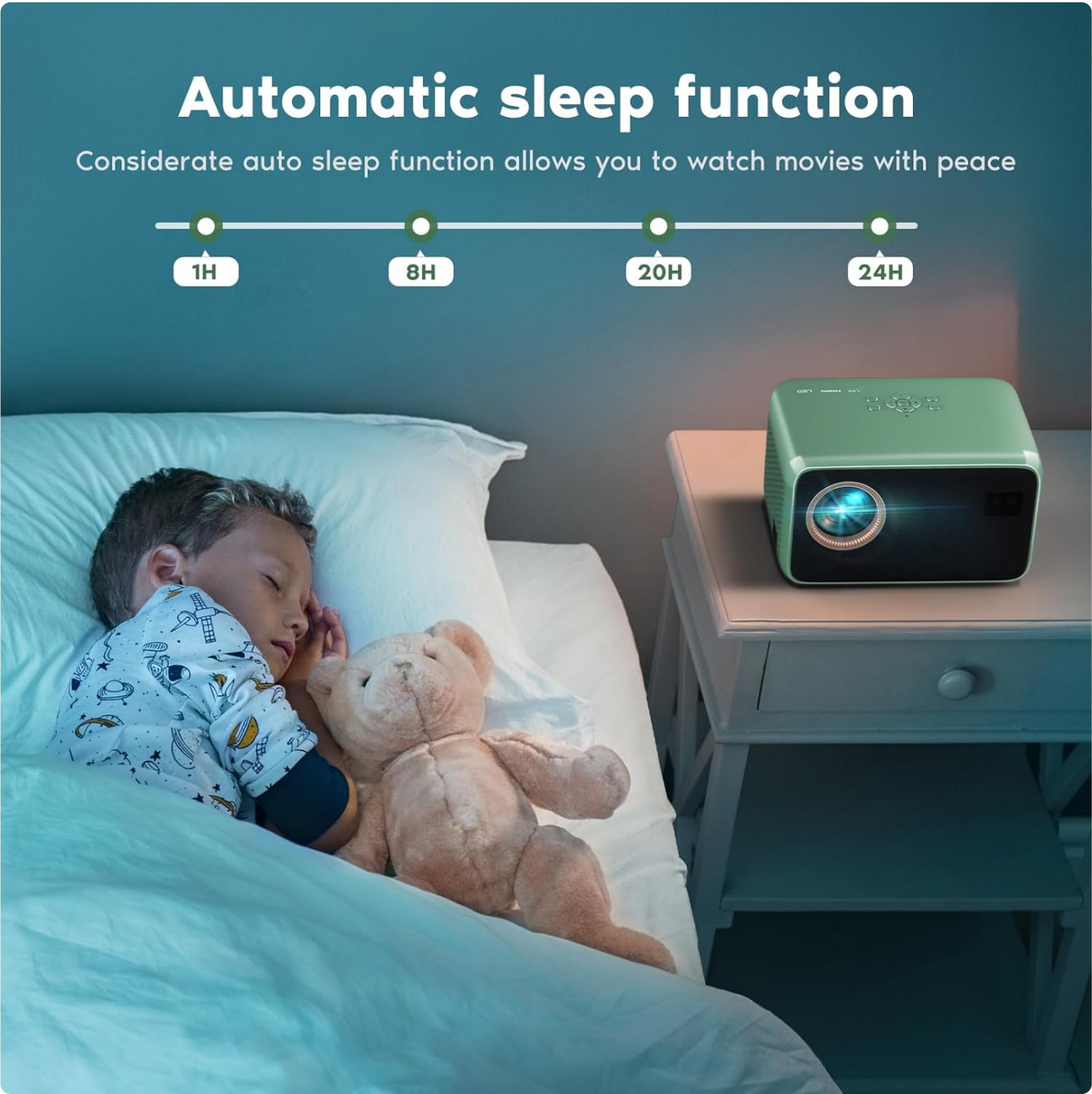
Figure 5.5: The automatic sleep function allows users to set a timer for the projector to turn off, ranging from 1 hour to 24 hours.