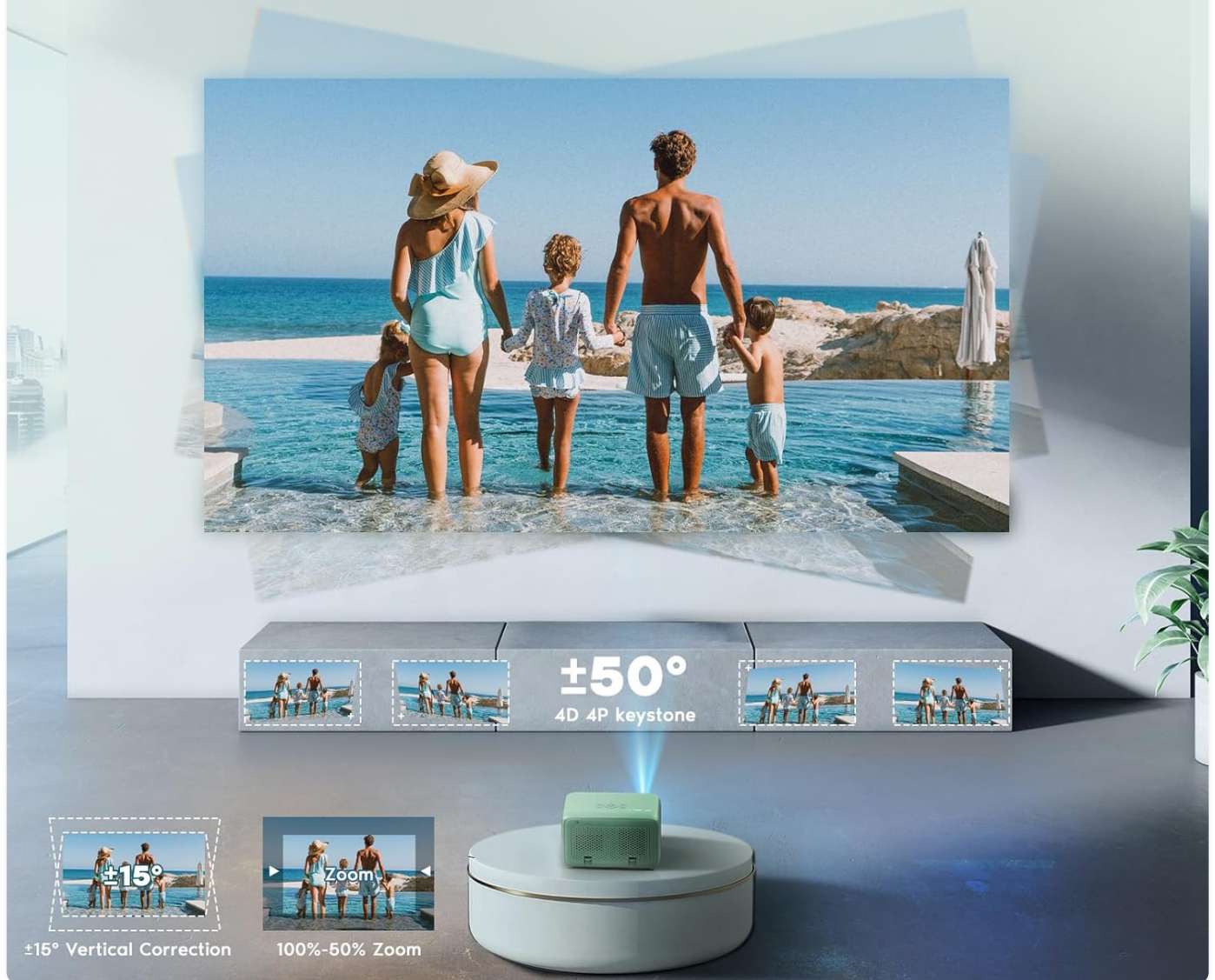
Figure 4.2: The projector features 4D 4P auto keystone correction, ensuring a perfectly rectangular image regardless of the projection angle. The image illustrates how a distorted projection is automatically corrected to a perfect rectangle.

Get rectangle screen in 1 second with Auto keystone