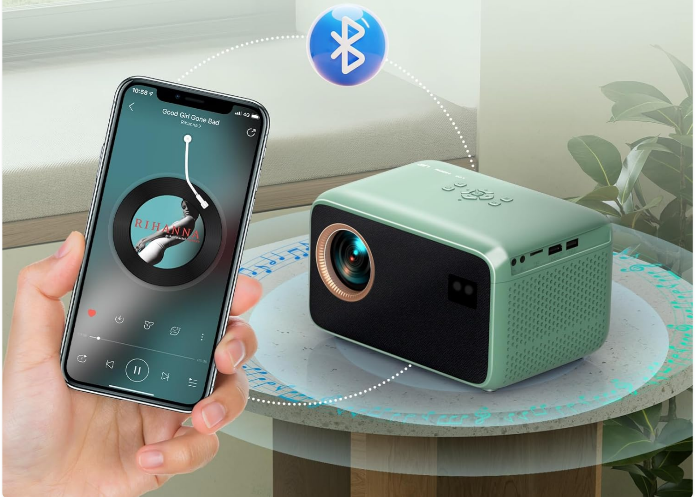
Figure 5.2: The projector supports bidirectional Bluetooth 5.2, allowing connection to external speakers or functioning as a standalone Bluetooth speaker for your mobile device.