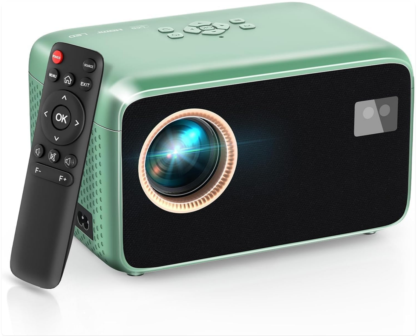
Figure 2.1: TMY P38 4K Projector with included remote control. The projector is a compact, green and black unit with a prominent lens and control panel, accompanied by a black remote.