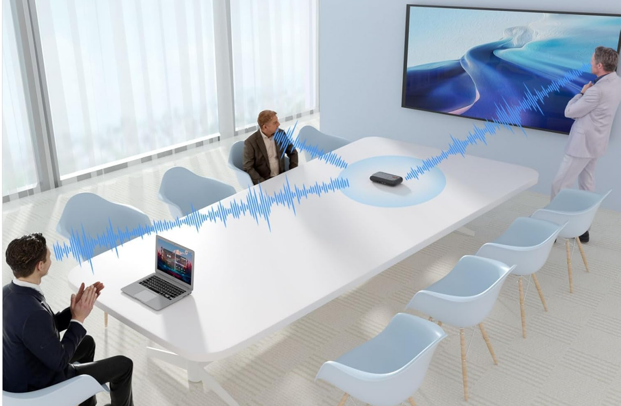
Image: Illustration demonstrating Automatic Gain Control (AGC) balancing voice levels from speakers at different distances in a meeting room.

allows the voice to be captured in constant amplitude, no matter where you sit or stand