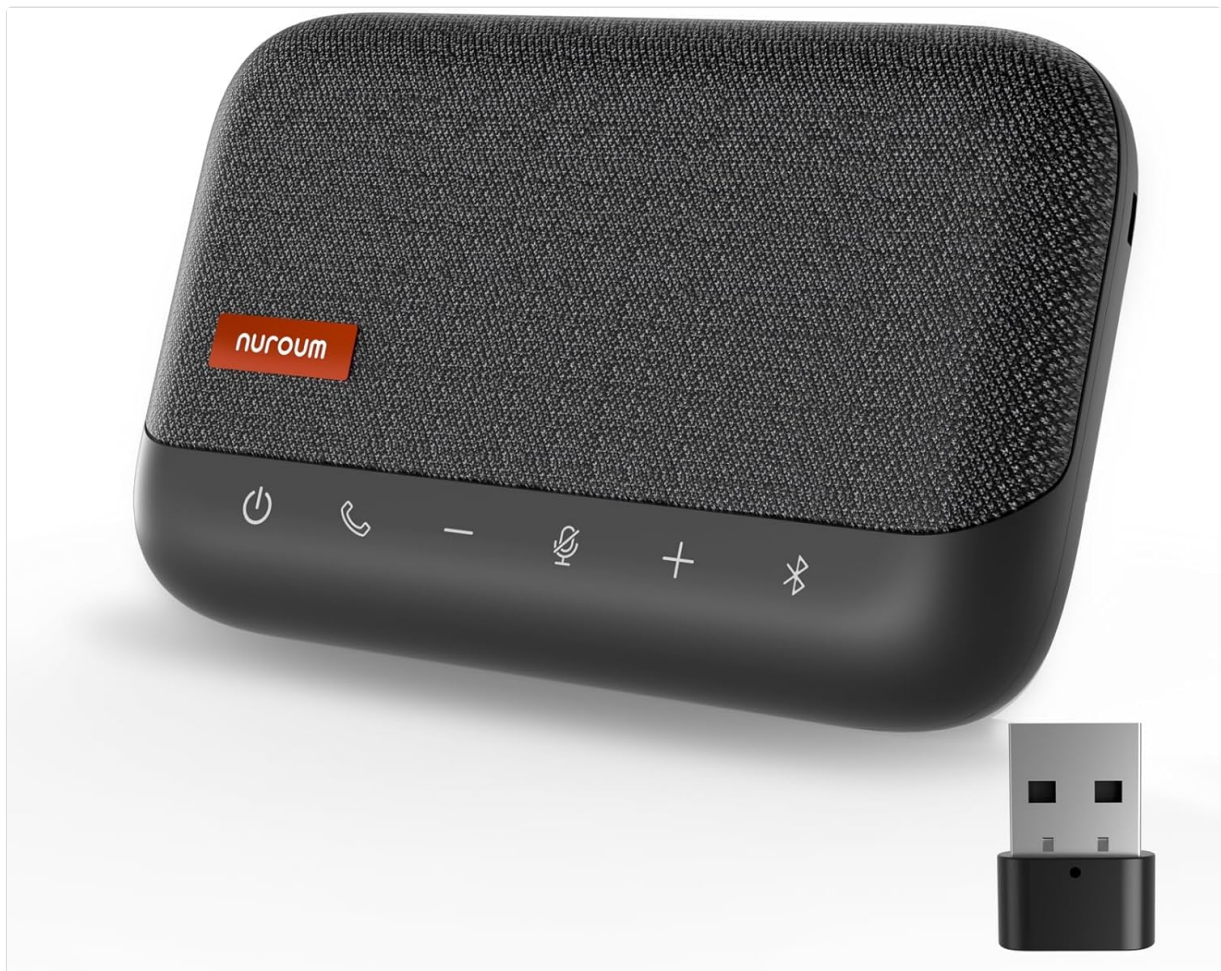
Image: The NUROUM A15 conference speaker and microphone, shown with its USB dongle, highlighting its compact and

The NUROUM A15 is a portable Bluetooth wireless speakerphone designed for clear and efficient communication in various settings, from individual home offices to large conference rooms. It features advanced audio processing technologies for superior sound quality and versatile connectivity options.