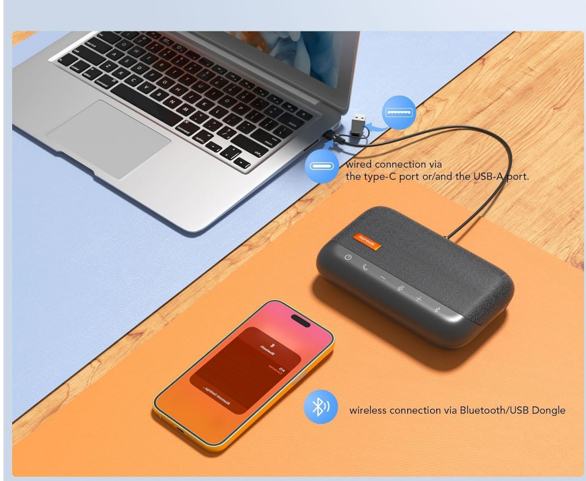
Image: Diagram illustrating wired USB connection to a laptop and wireless Bluetooth/USB dongle connection to a smartphone.

Thanks to the flexible connectivity, just start a meeting immediately.