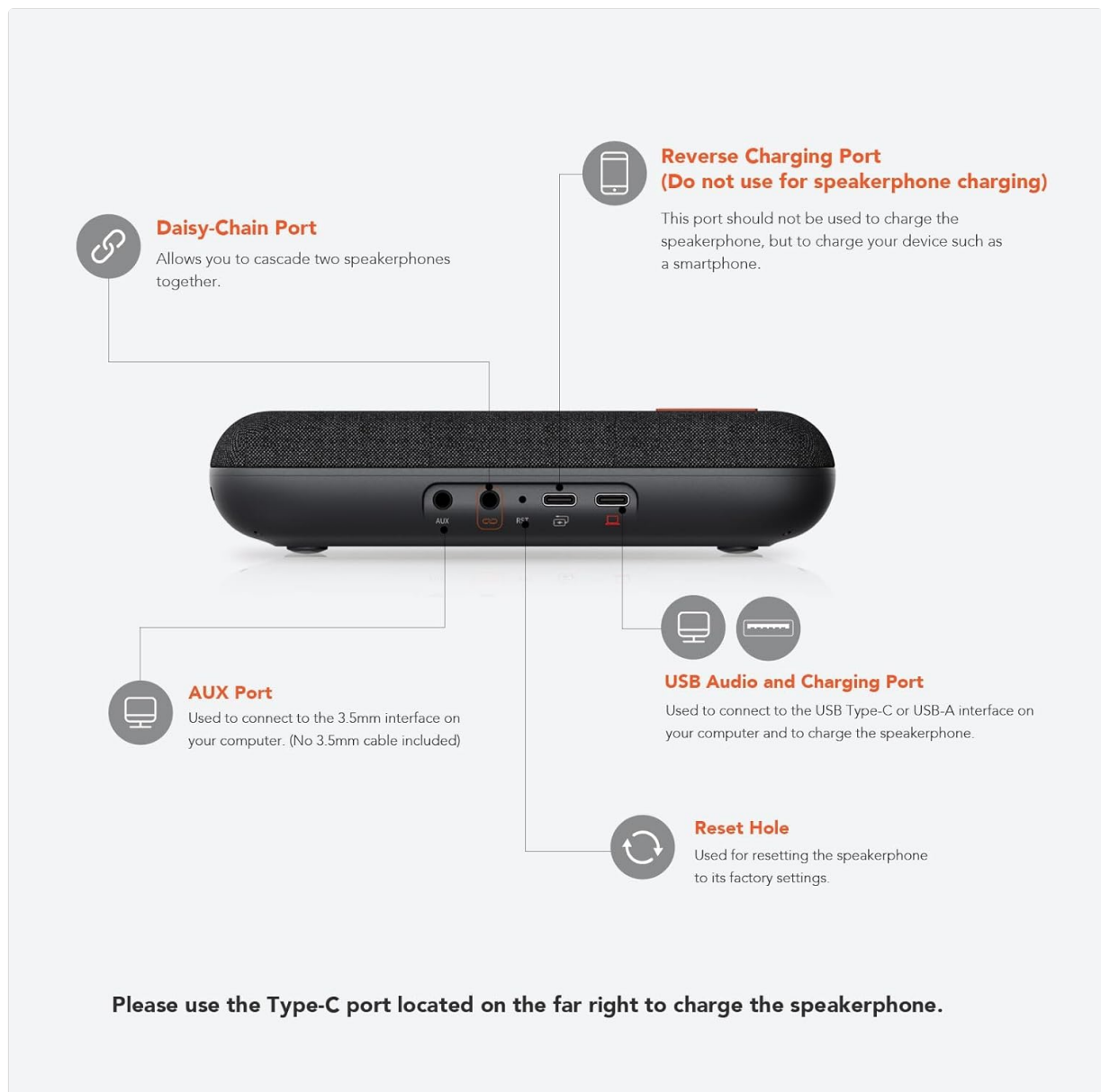
Image: Detailed diagram of the NUROUM A15's ports, including Daisy-Chain Port, AUX Port, USB Audio and Charging Port, Reverse Charging Port, and Reset Hole.

Your browser does not support the video tag.