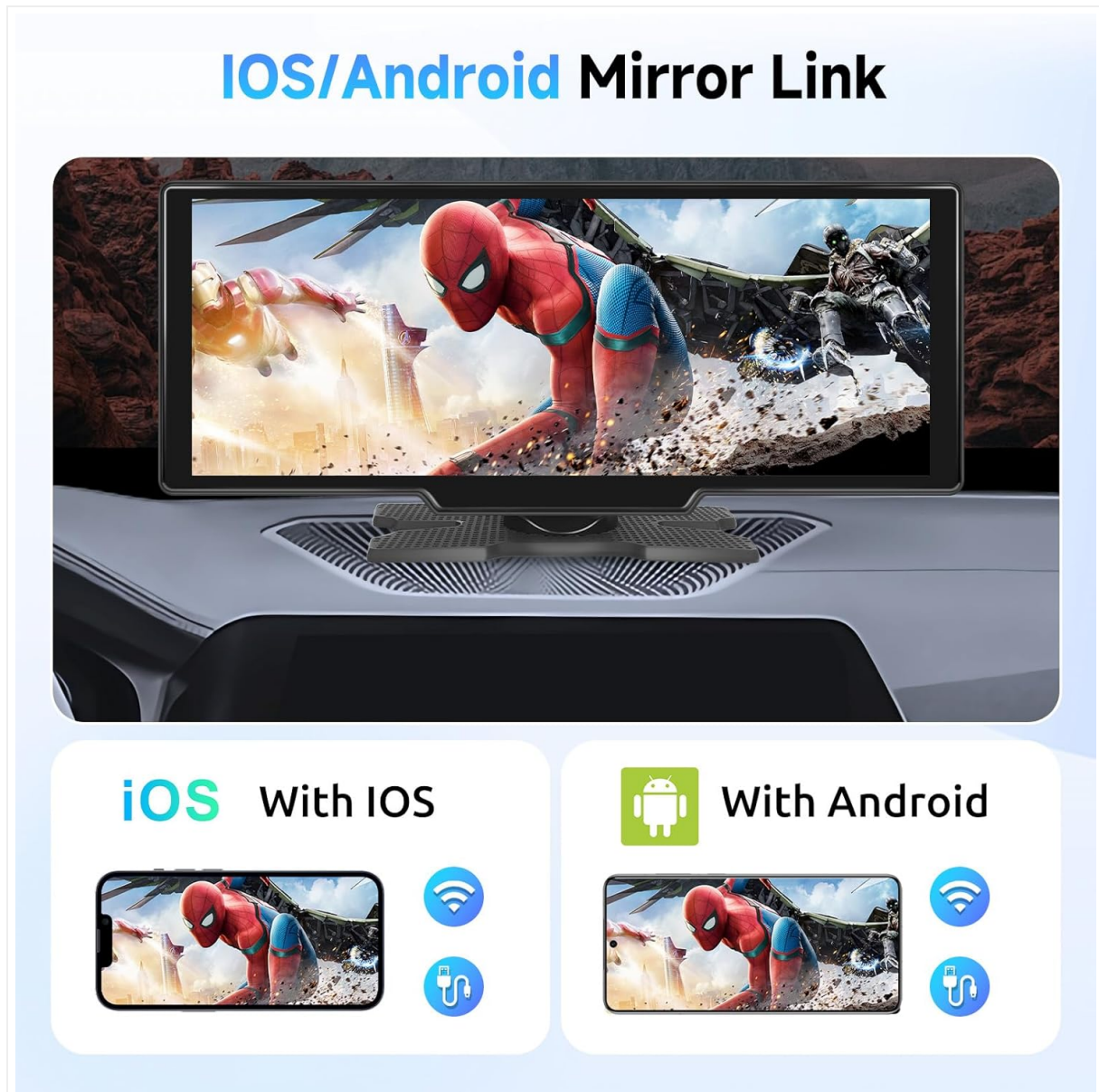
Figure 5: iOS/Android Mirror Link. This image demonstrates how to mirror your smartphone's display onto the car radio screen for both iOS and Android devices.

3. Your phone's screen will be mirrored on the Hodozzy display.