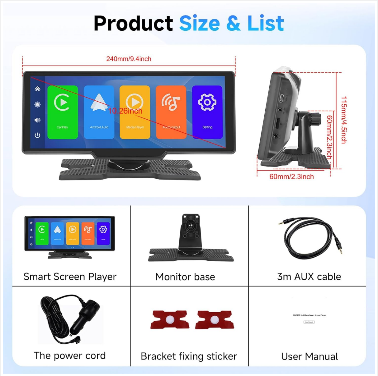
Figure 1: Package Contents and Product Dimensions. This image displays the main unit, mounting bracket, power cable, AUX cable, and other included accessories, along with key dimensions of the device.