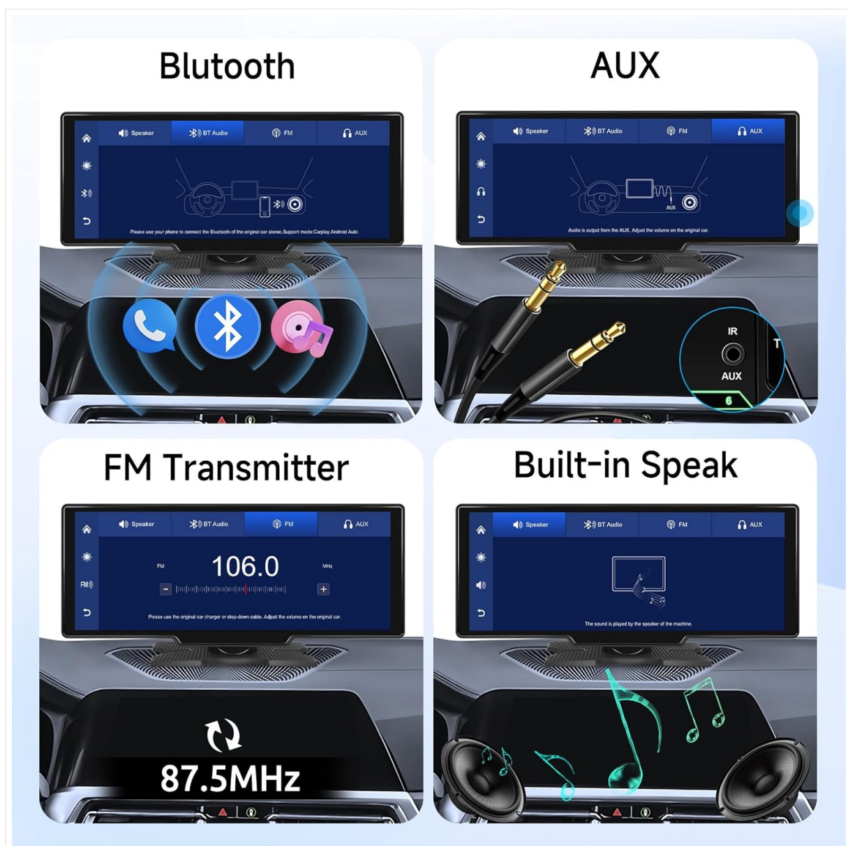
Figure 6: Audio Output Options. This image details the various ways to output audio from the device, including Bluetooth, AUX, FM transmission, and the built-in speaker.