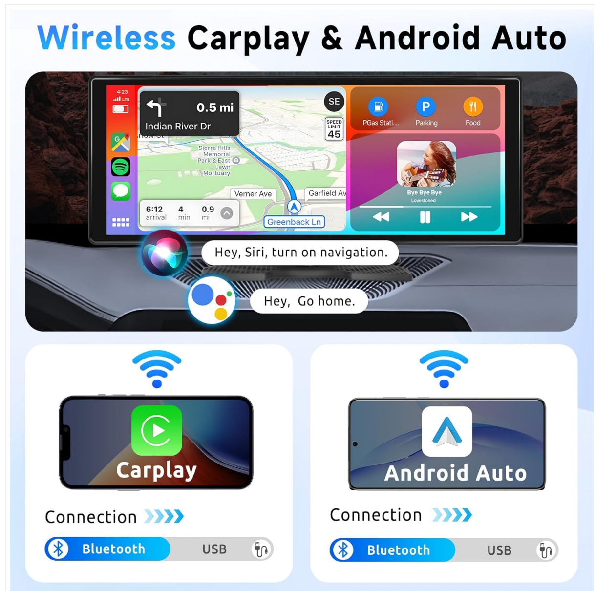
Figure 4: Wireless CarPlay and Android Auto Connectivity. This image shows how to connect your smartphone wirelessly or via USB to access navigation, music, and other apps.