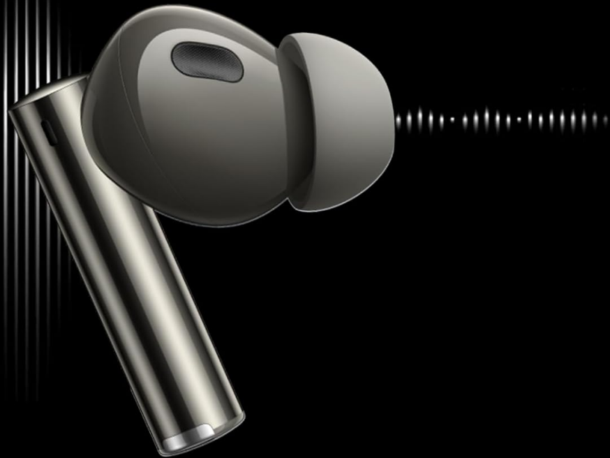
Figure 2: Illustration of 50dB Smart Noise Cancellation. A single earbud is depicted with sound waves indicating noise reduction.