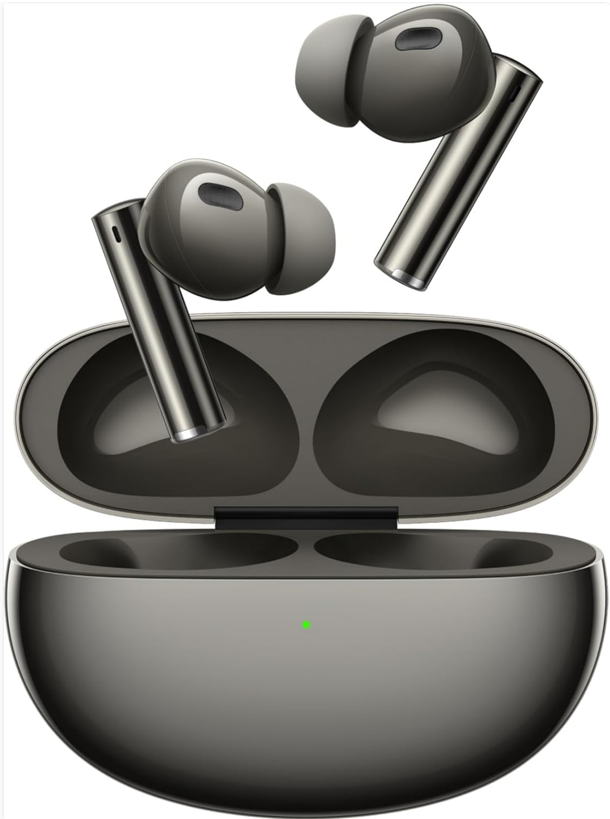
Figure 1: realme Air 6 Pro Earbuds and Charging Case. The earbuds are shown outside the open charging case, which has a small green indicator light.