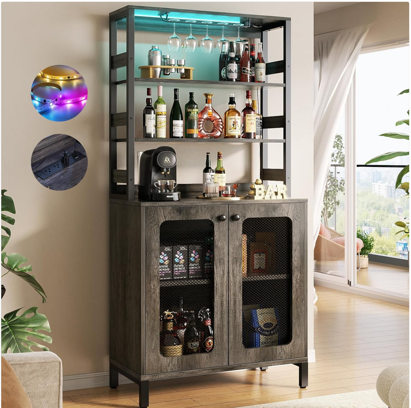
Image 1: Aheaplus Bar Cabinet with various items, showcasing its functionality.