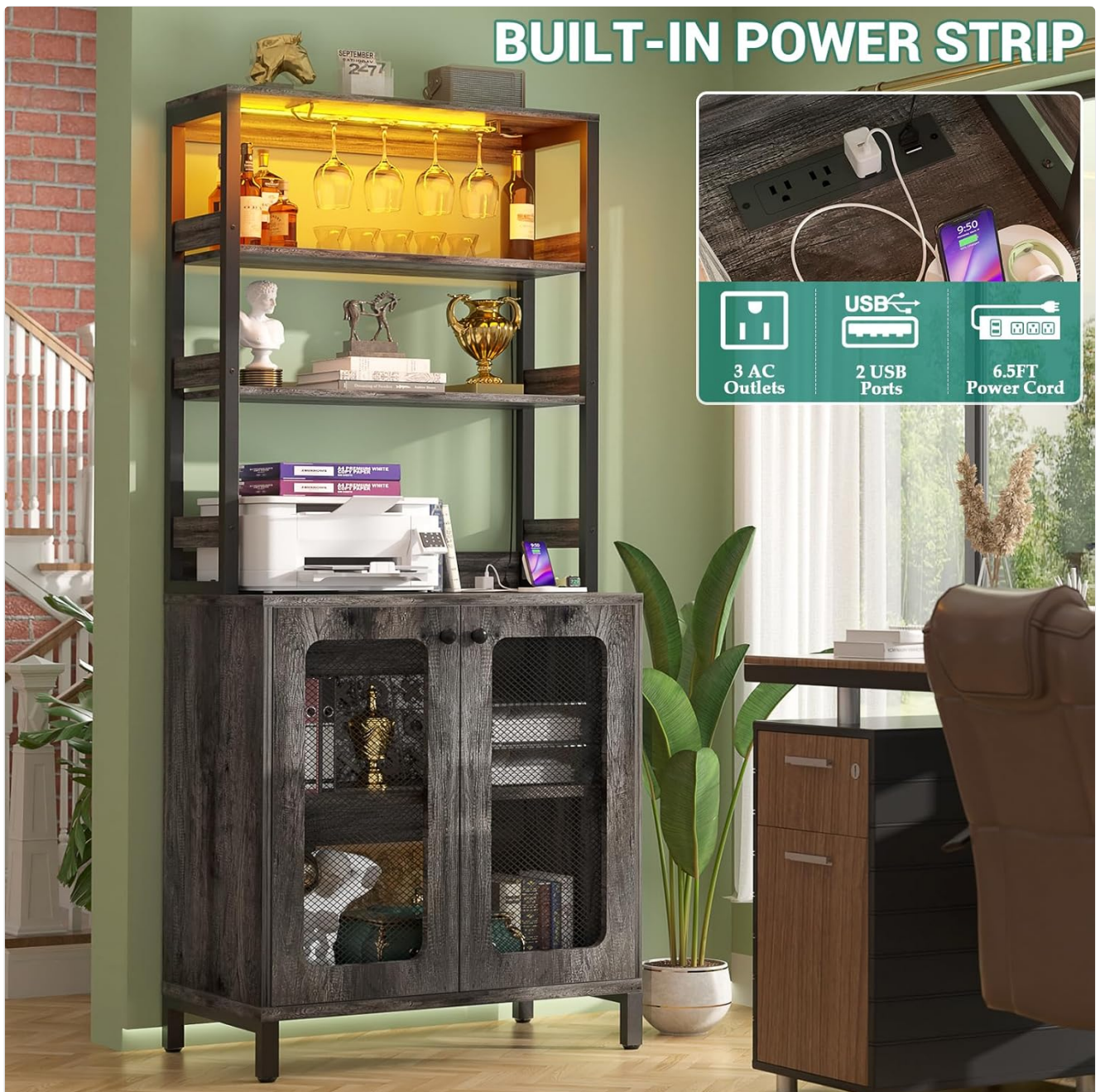
Image 4: Close-up of the built-in power strip with 3 AC outlets and 2 USB ports.