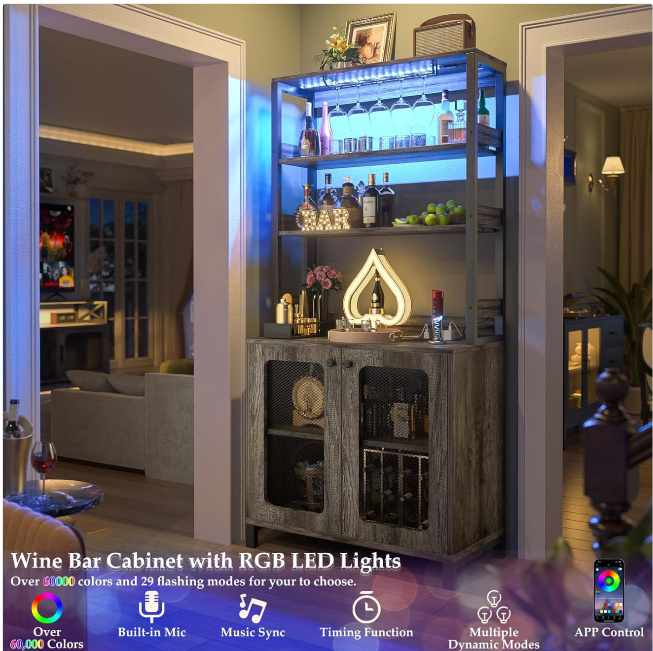
Image 5: Overview of LED light features including color options, music sync, and app control.