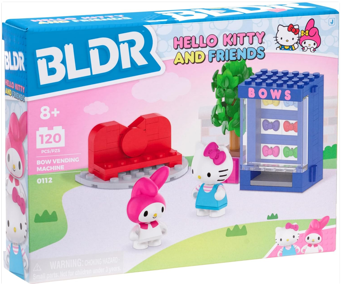
Figure 2: Product packaging for the BLDR Hello Kitty and Friends Bow Vending Machine Building Set.