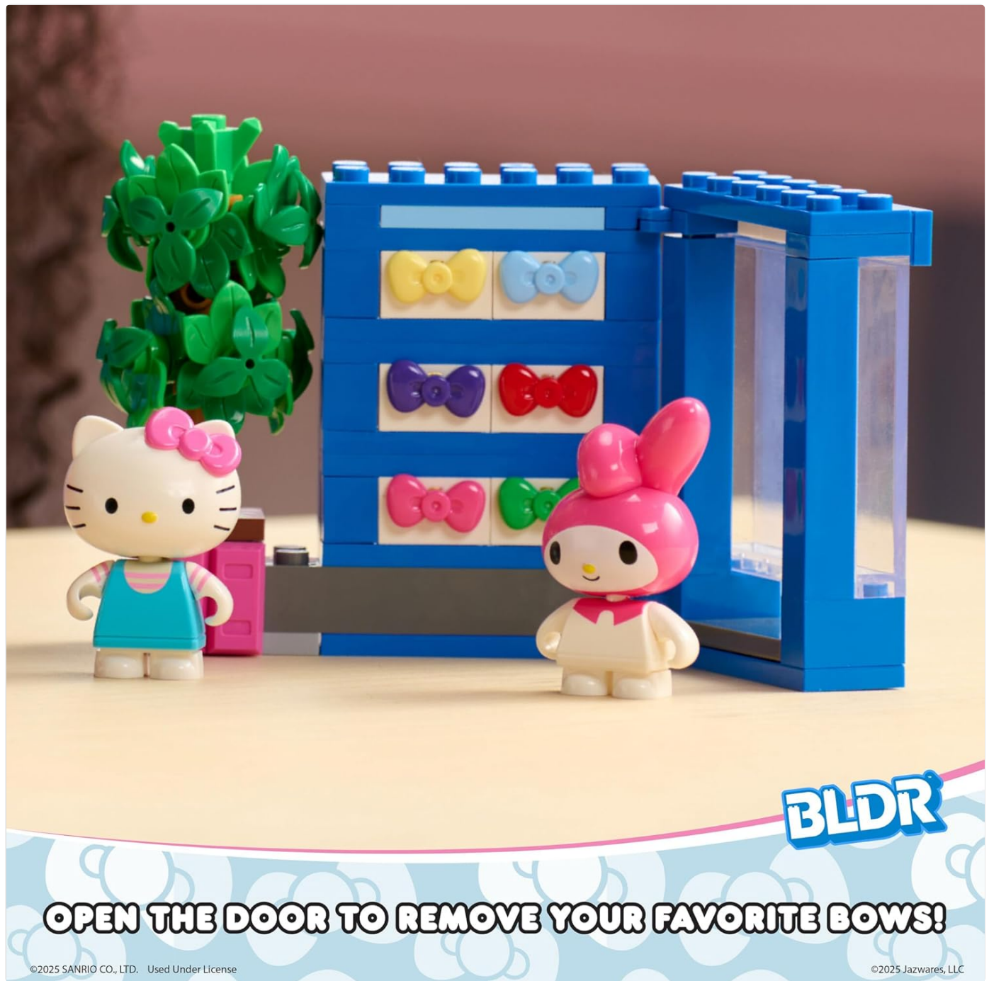
Figure 3: Side view of the assembled set, highlighting the components.

for integration into existing building block collections.