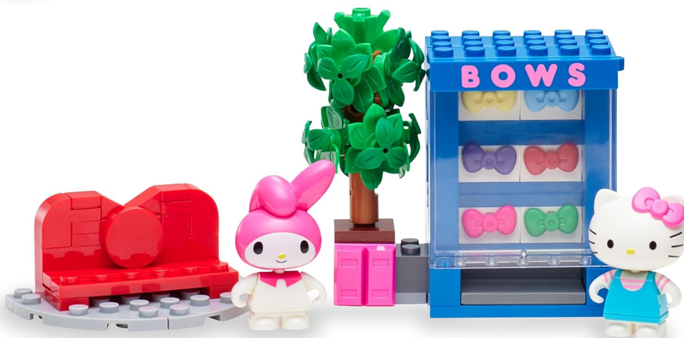
Figure 1: Fully assembled Hello Kitty and Friends Bow Vending Machine Building Set.