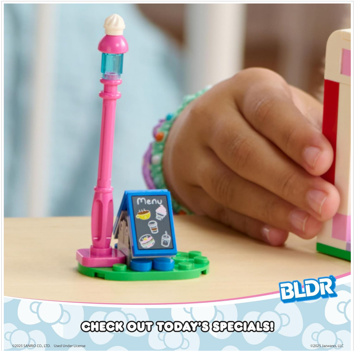
Image 4.2: Detailed view of the menu board and streetlamp accessory.