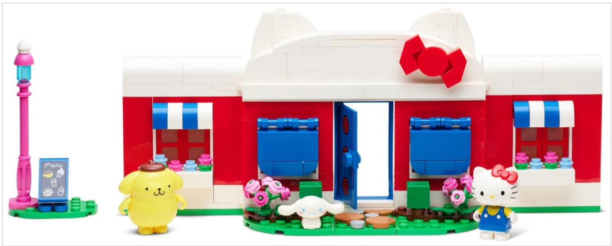
Image 4.1: The Hello Kitty's Dream Cafe with its hinged walls opened for expanded play.