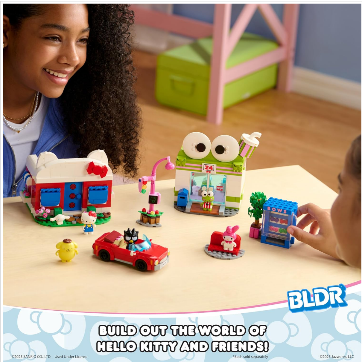
Image 4.3: Interactive play with the Hello Kitty, Pompompurin, and Cinnamoroll minifigures.