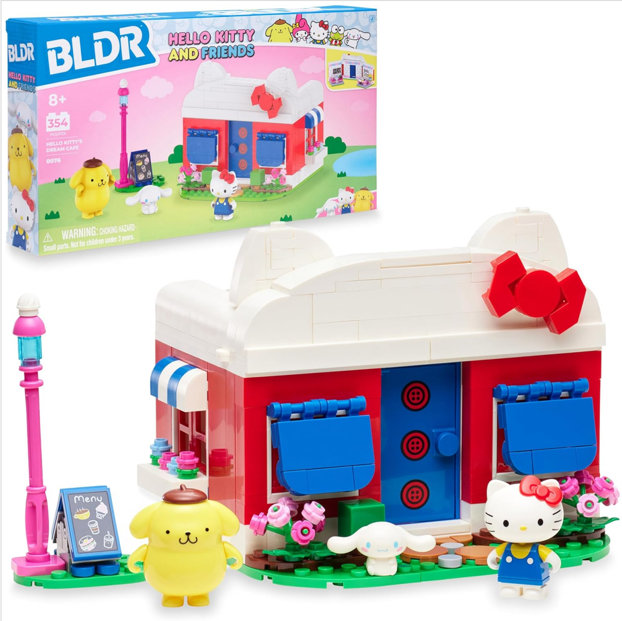
Image 1.1: The fully assembled BLDR Hello Kitty's Dream Cafe Building Set 0076.