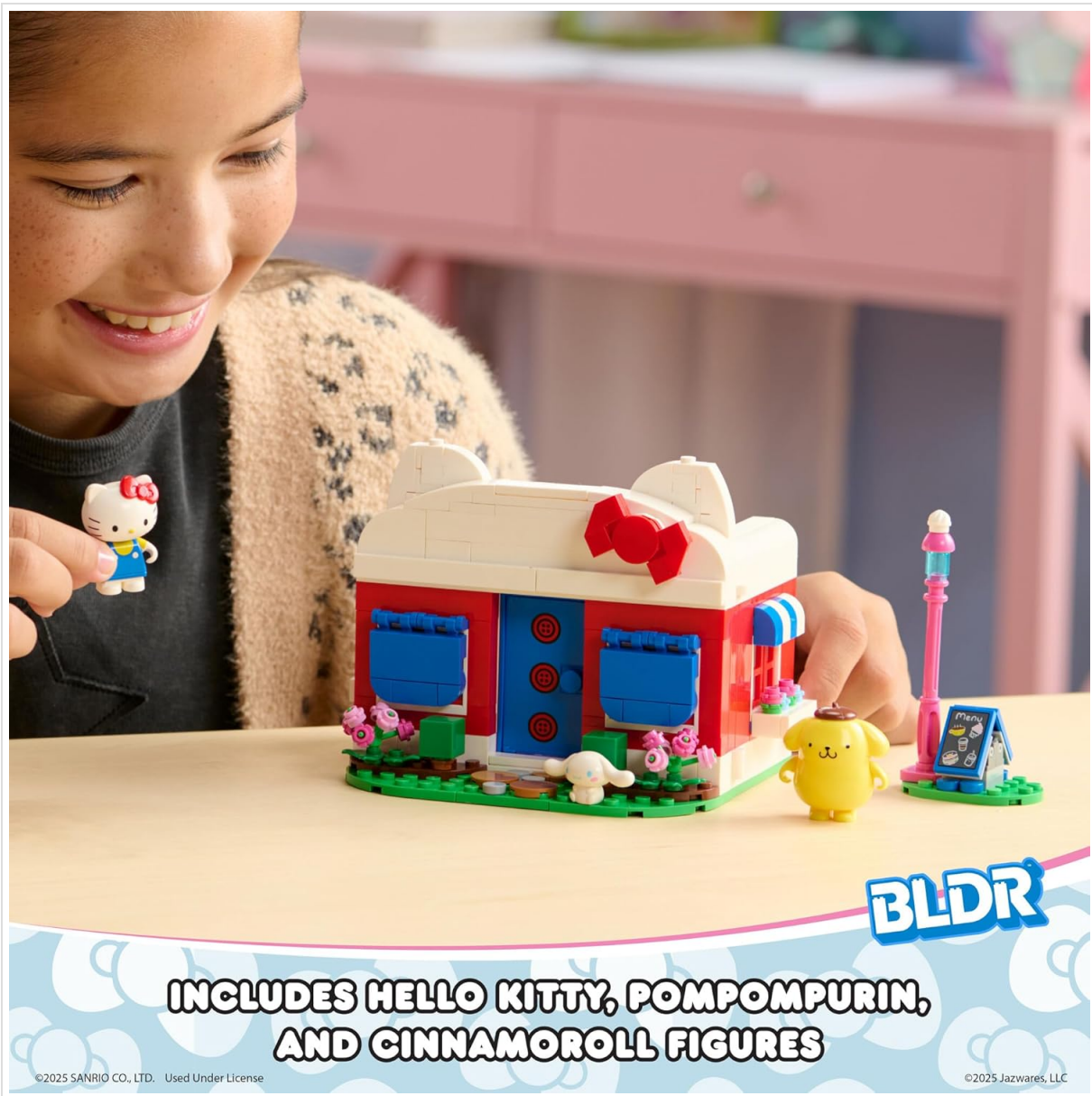
Image 3.1: A child engaged in the assembly process of the building set.