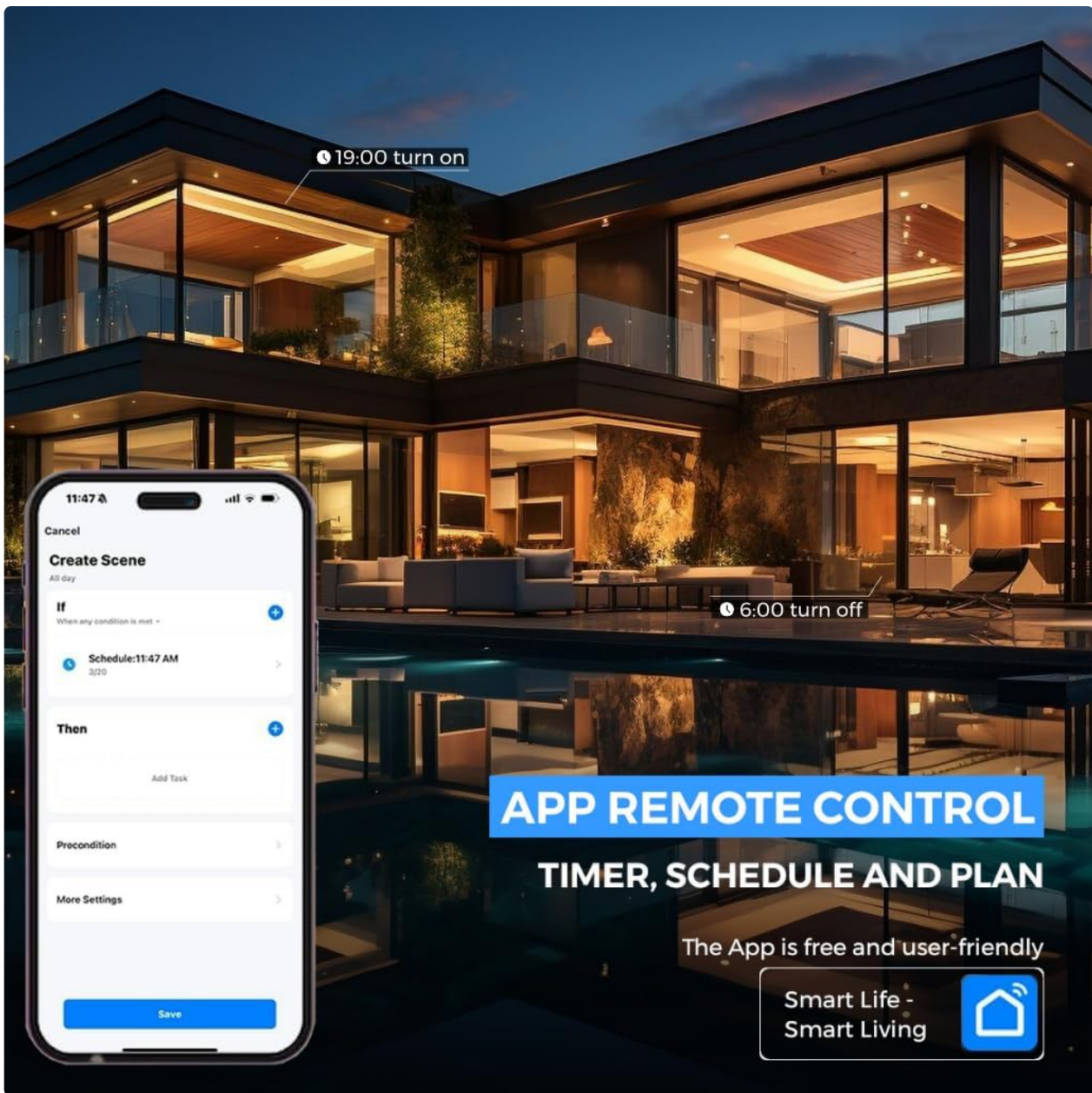
Image: A smartphone displaying the Smart Life app's scheduling feature, showing options to set times for lights to turn on or off.