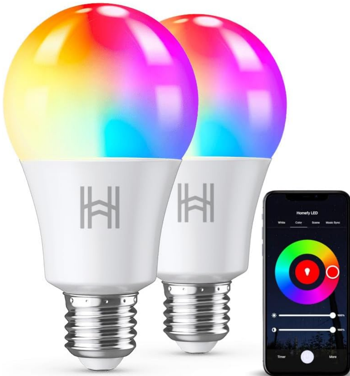
Image: Two Homefy Smart Light Bulbs and a smartphone showing the color selection interface of the control app.