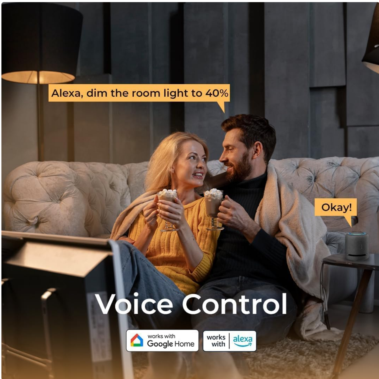
Image: A couple on a sofa interacting with a smart speaker to control their lighting, demonstrating voice control functionality.