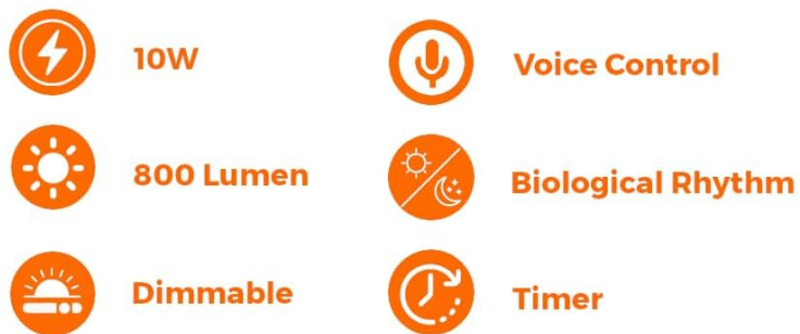
Image: Product packaging highlighting key features and a diagram illustrating the bulb's dimensions.