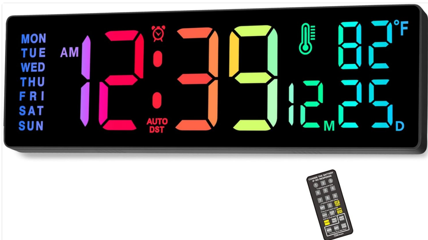
Image: The Soobest 14.2" Large Display Digital Wall Clock, showcasing its vibrant multi-color display and the included remote control.

Thank you for choosing the Soobest 14.2" Large Display Digital Wall Clock. This versatile clock features a large LED screen, 8-in-1 color changing display, date, day of week, temperature, and timer functions. It is designed for easy readability and convenient operation with a remote control, making it ideal for various indoor settings including living rooms, bedrooms, offices, and gyms. This manual provides detailed instructions for setup, operation, and maintenance to ensure optimal performance and longevity of your device.