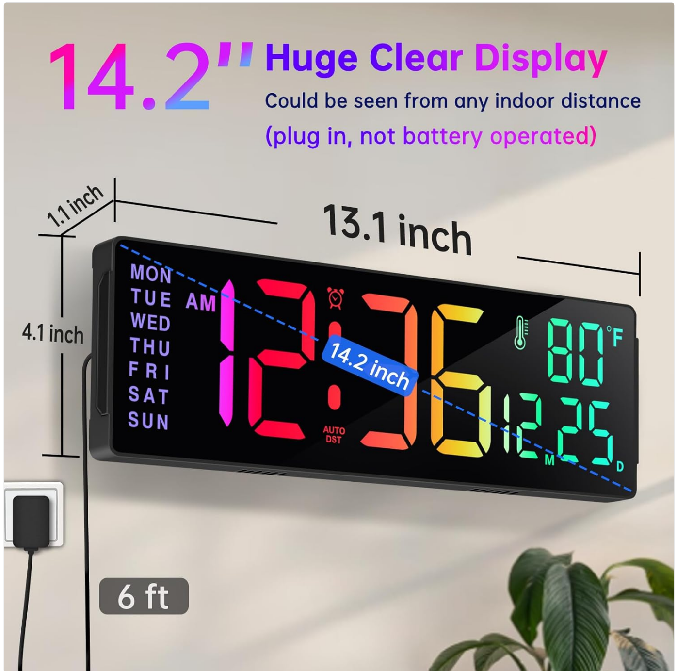
Image: Visual representation of the clock's dimensions and power connection, illustrating its suitability for wall mounting or tabletop use.