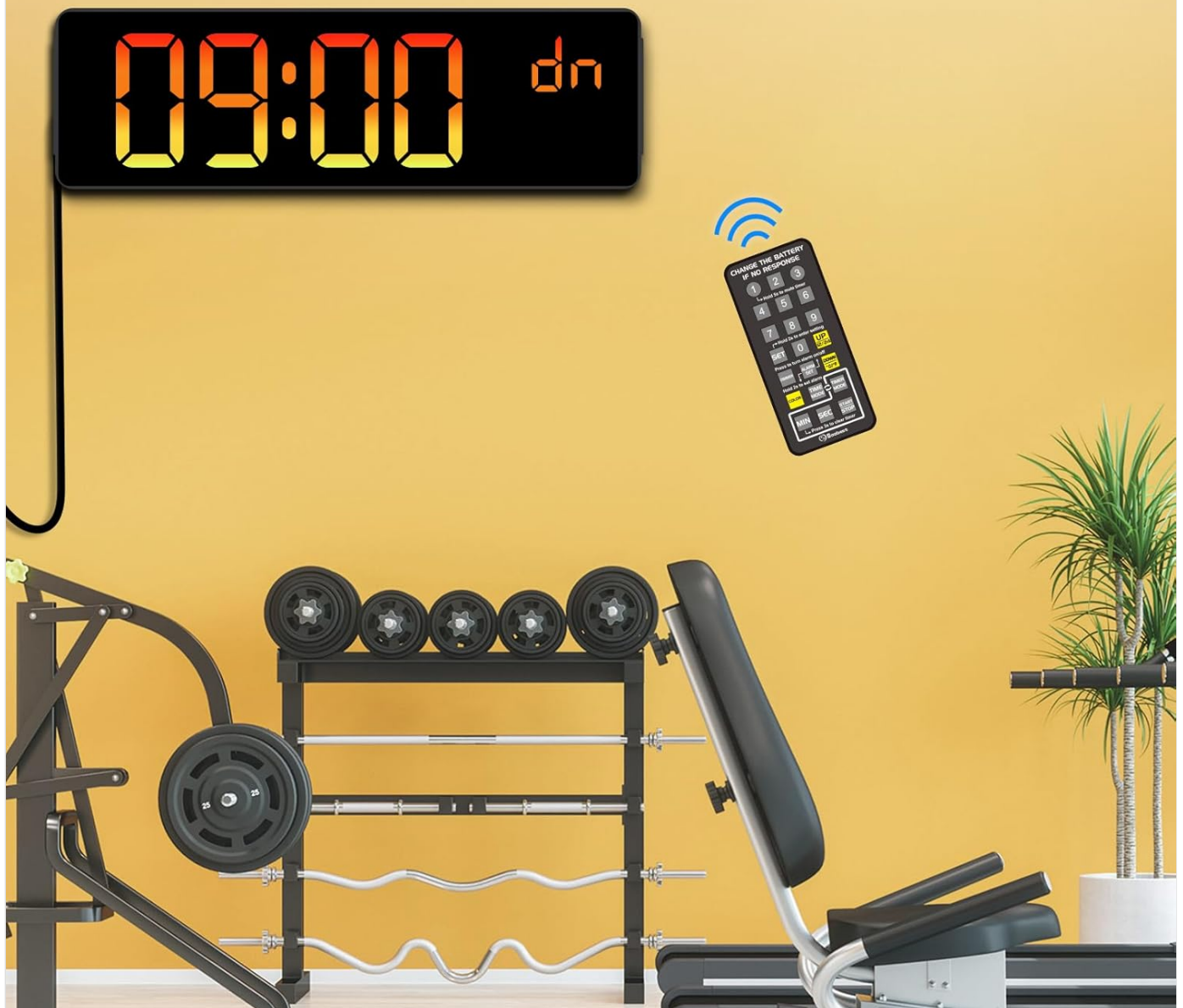
Image: The clock functioning as a digital timer, demonstrating its utility in a home gym setting.