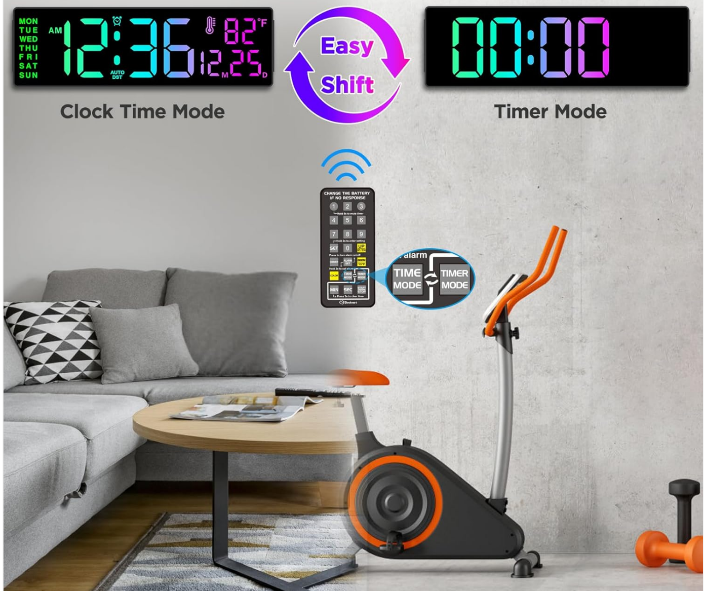
Image: The clock displaying both time and timer modes, highlighting the seamless transition between them using the remote control.