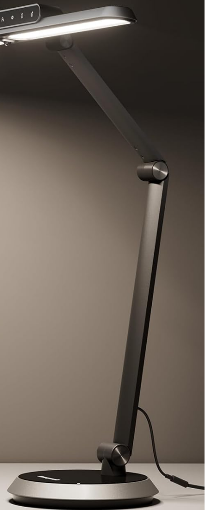
Image 1.1: Honeywell H9 Sunturalux LED Desk Lamp in a modern office setting.