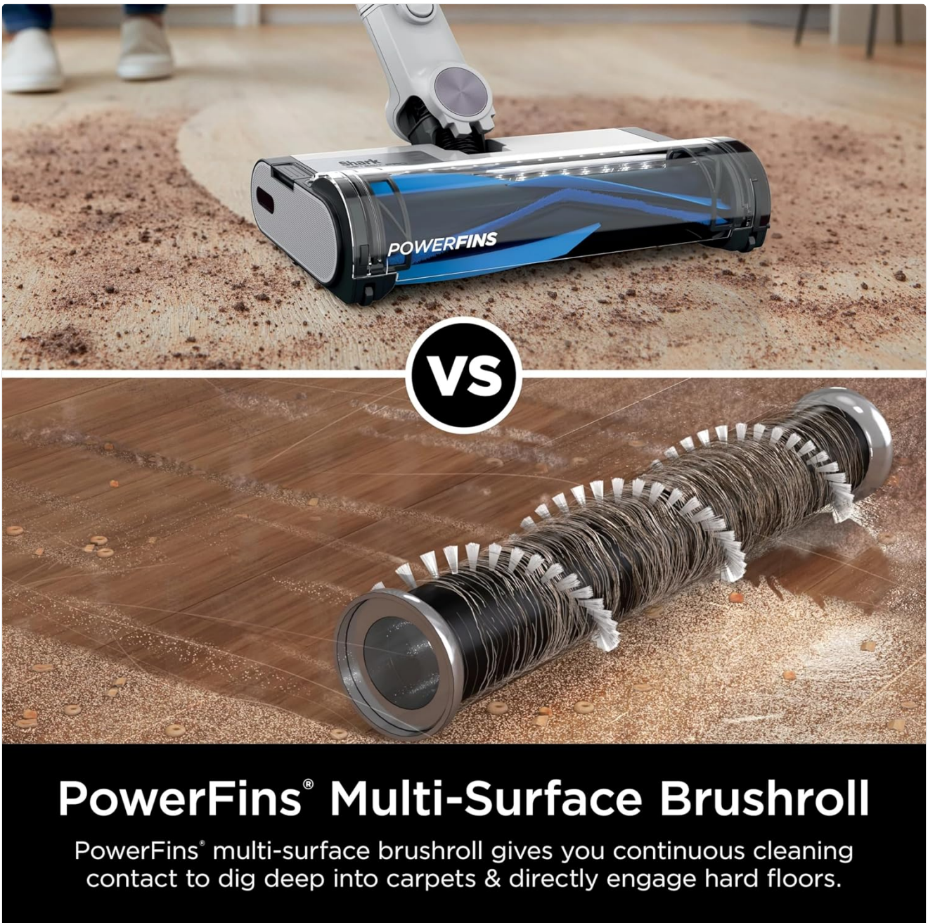
Figure 4: PowerFins Multi-Surface Brushroll.