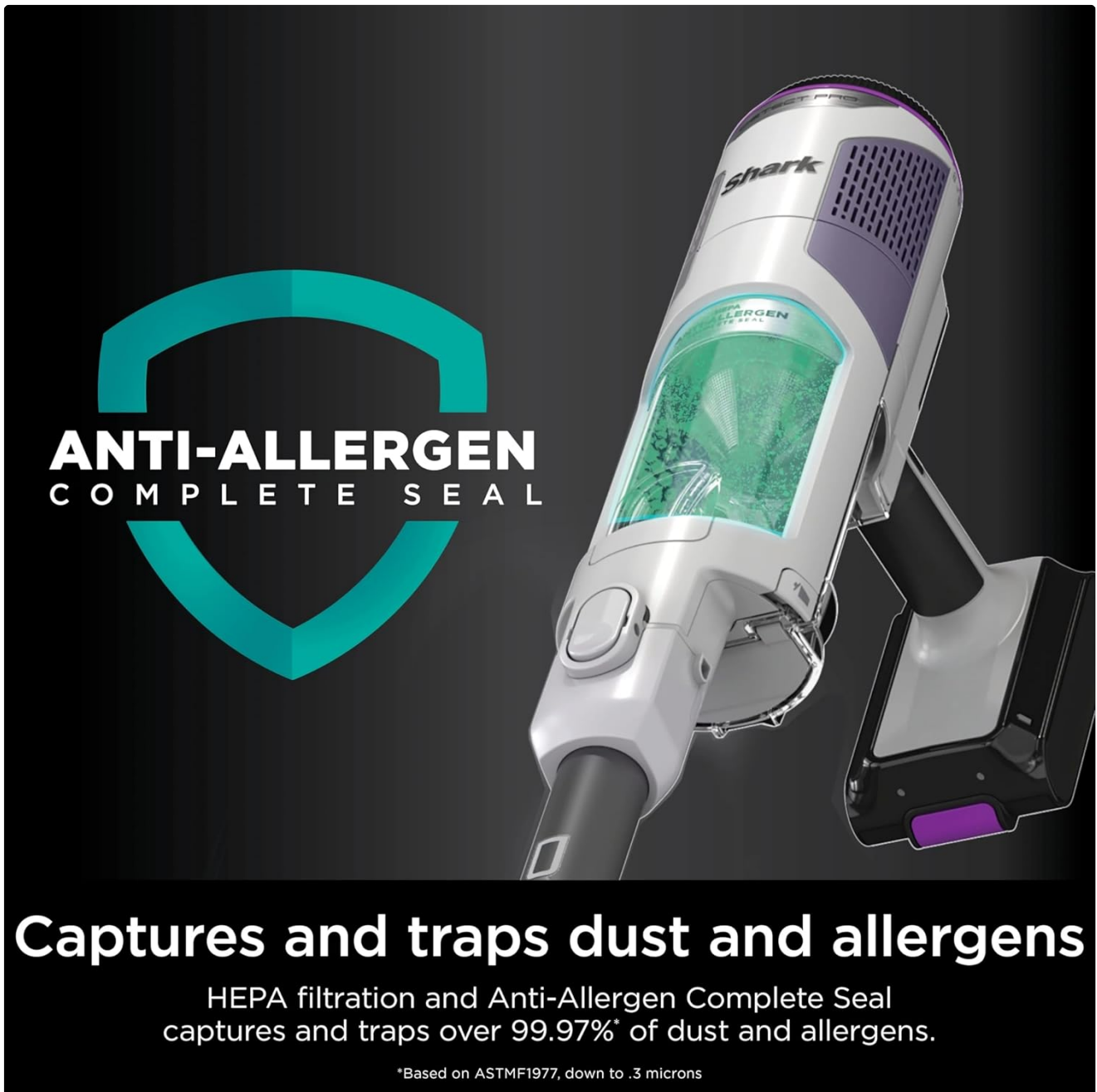
Figure 8: HEPA Filtration and Anti-Allergen Complete Seal.

The vacuum features a HEPA filter and an Anti-Allergen Complete Seal system. Refer to the specific instructions for cleaning or replacing these filters. Typically, pre-motor filters should be rinsed monthly, and the post-motor HEPA filter annually, or as needed based on usage.