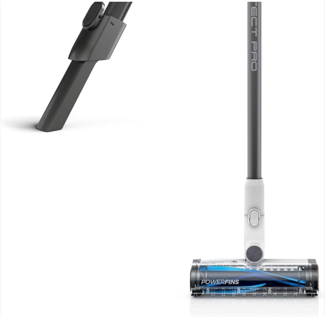
Figure 1: Shark IW1120 Detect Pro Cordless Vacuum and accessories.