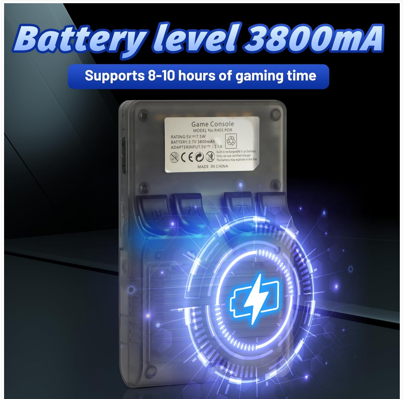
Image: Rear view of the console highlighting the 3800mAh battery and charging details.

Before first use, fully charge the console. Connect the provided Type-C charging cable to the console's charging port and a compatible USB power adapter (not included). The charging indicator light will typically show charging status and turn off or change color when fully charged.