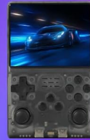
Handheld Gaming Console