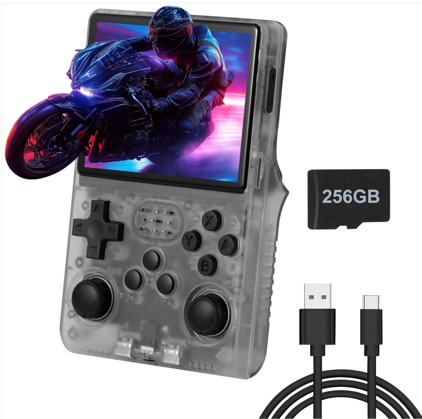
Image: HHU R40S Pro Handheld Game Console and its accessories.