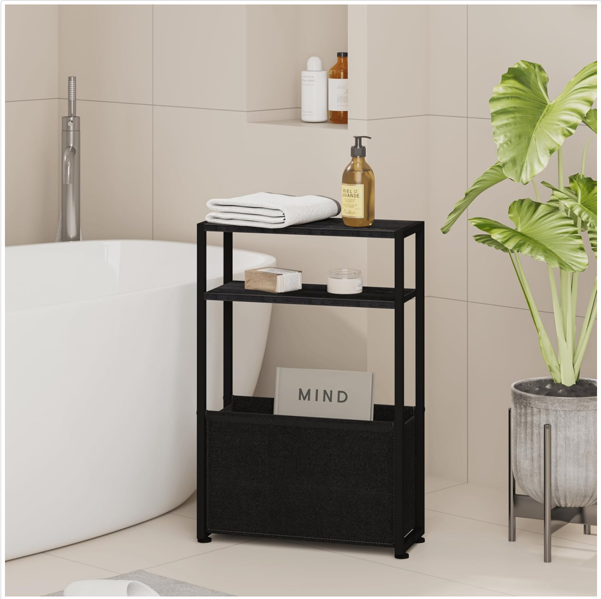
Image: Leomonio ZBZ01 side table in a bathroom setting.