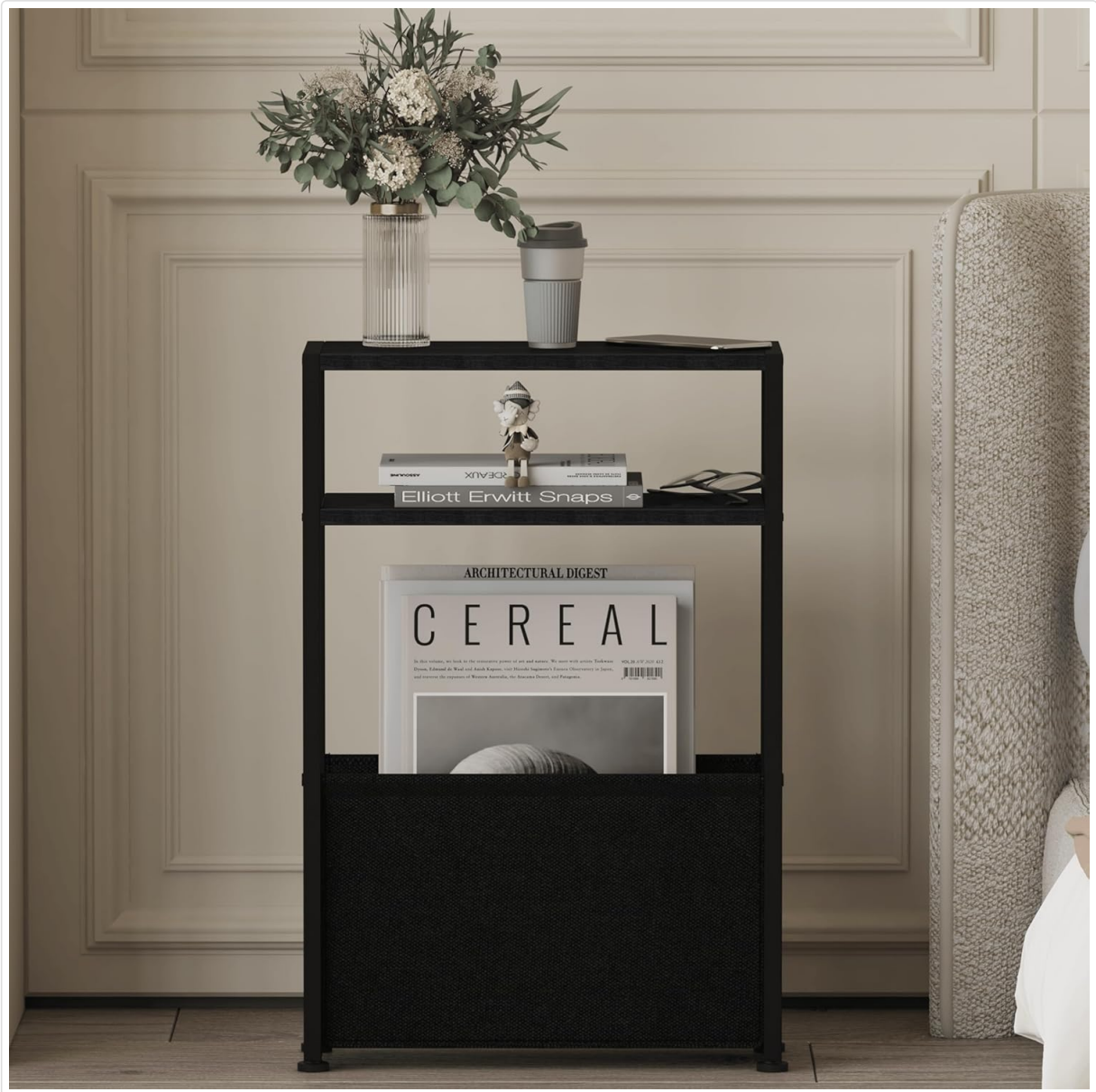
Image: Leomonio ZBZ01 side table in a bedroom setting.