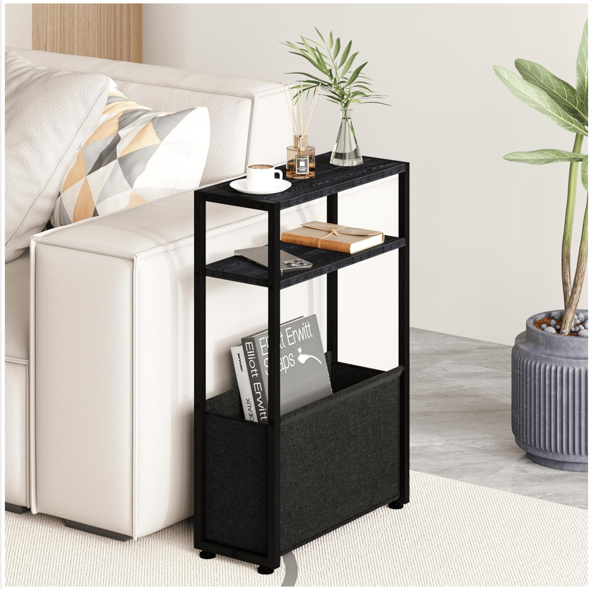
Image: Leomonio ZBZ01 side table in a living room setting.