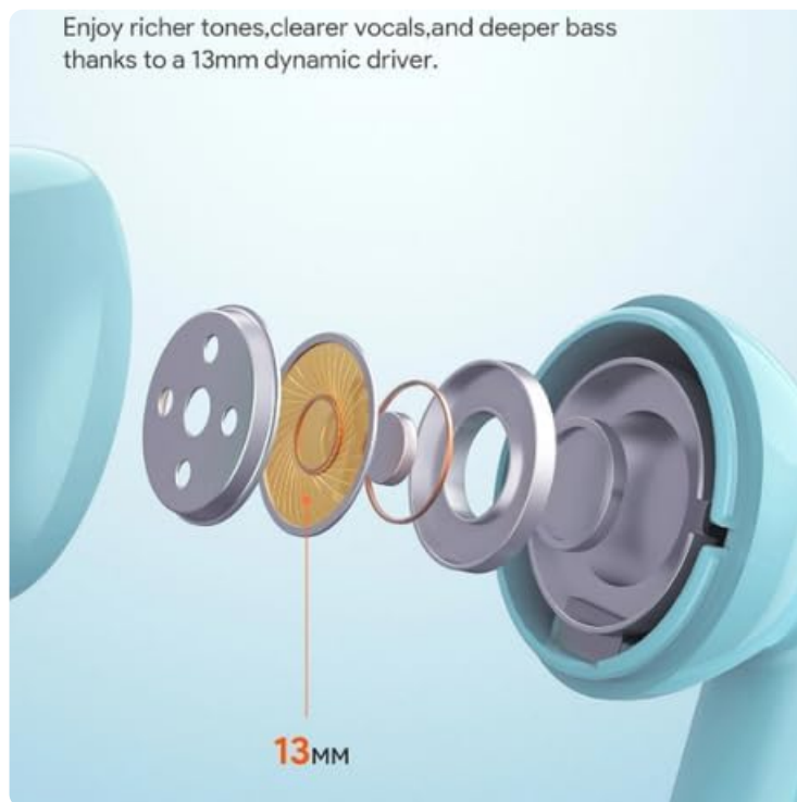
Image: An exploded view diagram illustrating the internal components of an earbud, highlighting a 13mm dynamic driver. Text indicates that this driver contributes to richer tones, clearer vocals, and deeper bass.