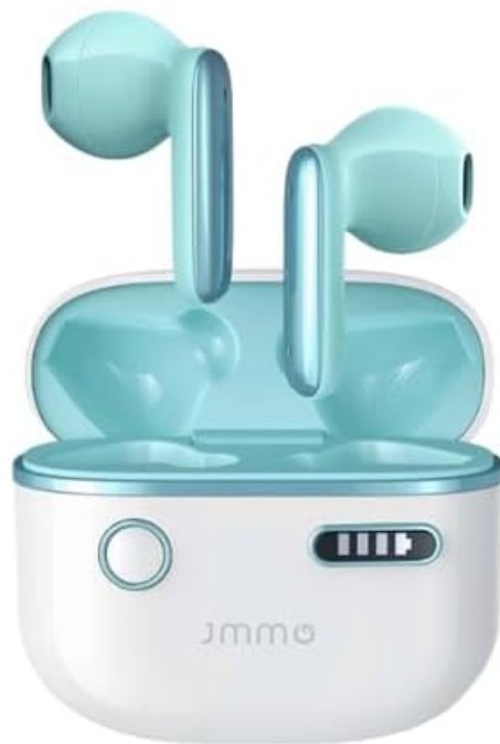
Image: The JMMO T202 Wireless Earbuds, shown in their open charging case. The earbuds are a vibrant blue, matching the interior of the white charging case. This image provides a clear view of the product's design and color.