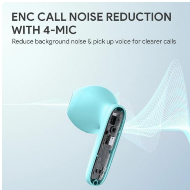
Image: A diagram showcasing the ENC (Environmental Noise Cancellation) Call Noise Reduction feature with a 4-microphone system within an earbud. The graphic suggests that this technology reduces background noise and enhances voice pickup for clearer calls.