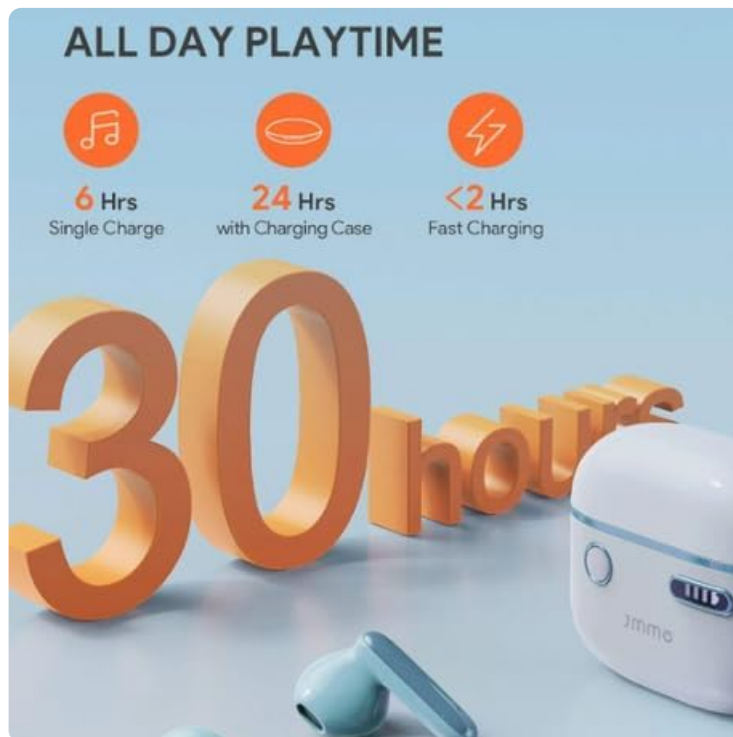
Image: A graphic illustrating the battery life and charging capabilities of the JMMO T202 earbuds. It indicates 6 hours of playtime on a single charge, 24 hours total with the charging case, and less than 2 hours for fast charging. The image features large "30 hours" text, representing total playtime.

Before first use, fully charge the earbuds and the charging case. Connect the provided charging cable to the case and a power source. The indicator lights on the case will show the charging status.