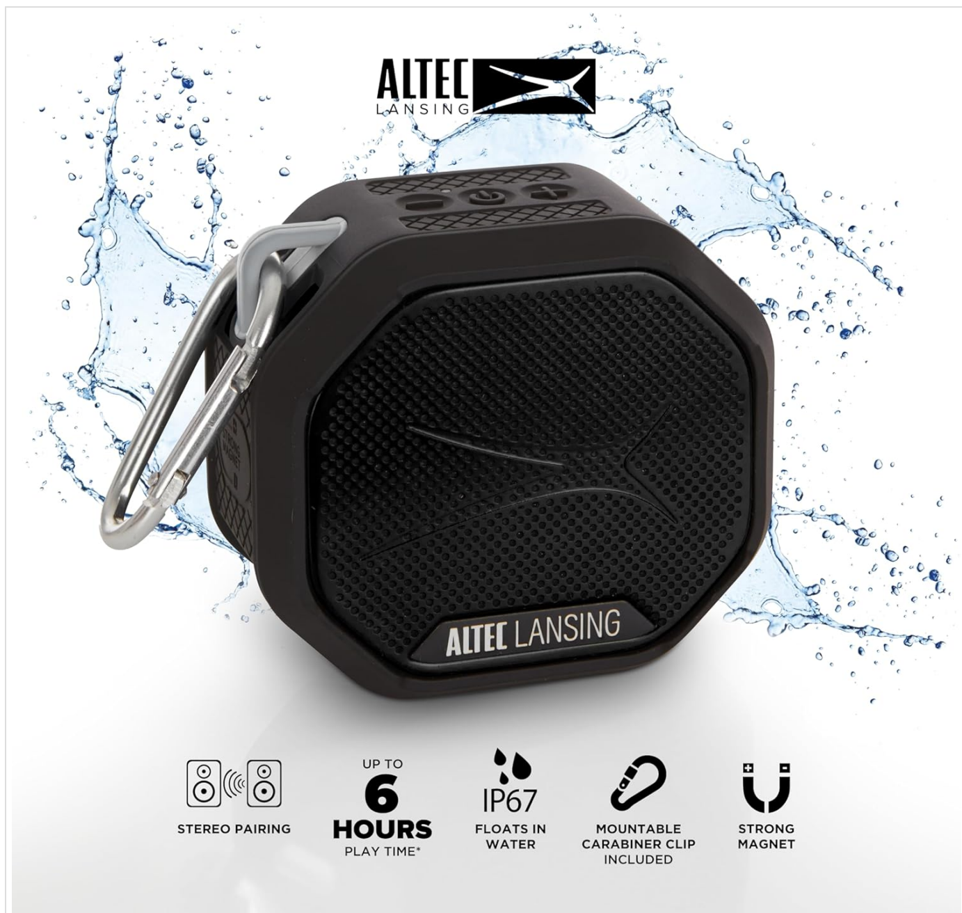
Image: Key features of the HYDRATREK speaker, including stereo pairing, up to 6 hours playtime, IP67 waterproof rating, ability to float, included carabiner clip, and strong magnet.