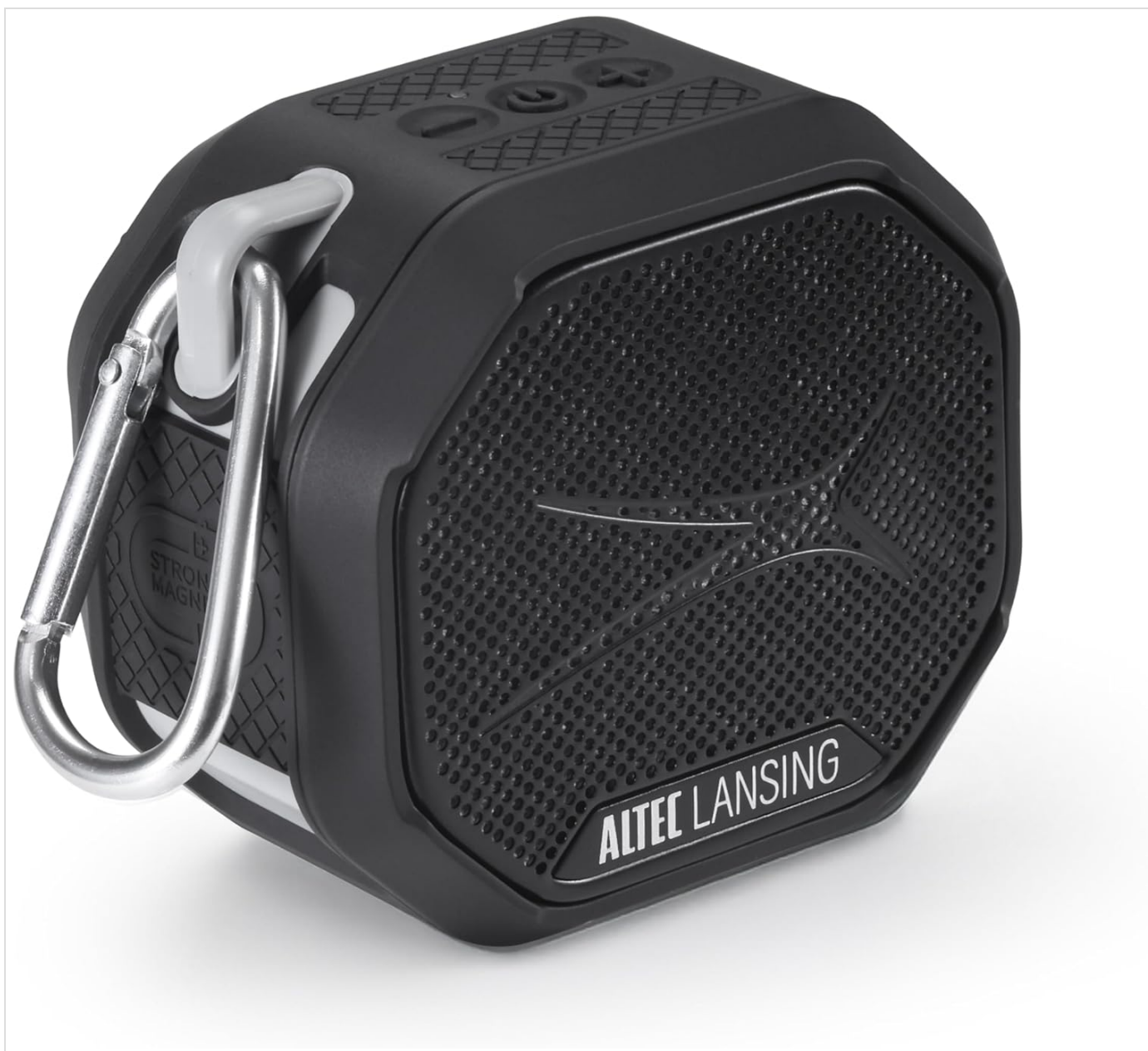
Image: The Altec Lansing HYDRATREK speaker in black, showcasing its compact design and integrated carabiner clip.