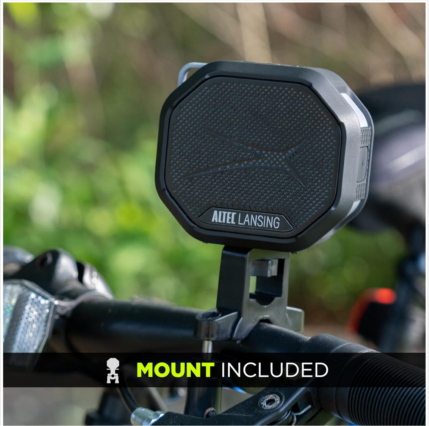
Image: The speaker attached to a bicycle handlebar using the included mount, ready for outdoor use.

Image: The speaker demonstrating its strong magnetic attachment to a metal surface.