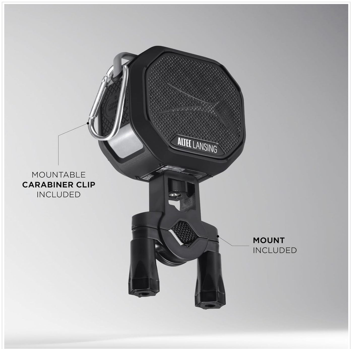
Image: The HYDRATREK speaker shown with its mountable carabiner clip and the included mount accessory.