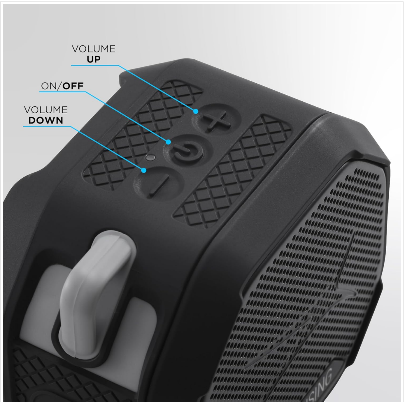
Image: Close-up of the speaker's top panel, indicating the Volume Down, Power (On/Off), and Volume Up buttons.