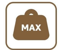
Heavy Duty Metal Design