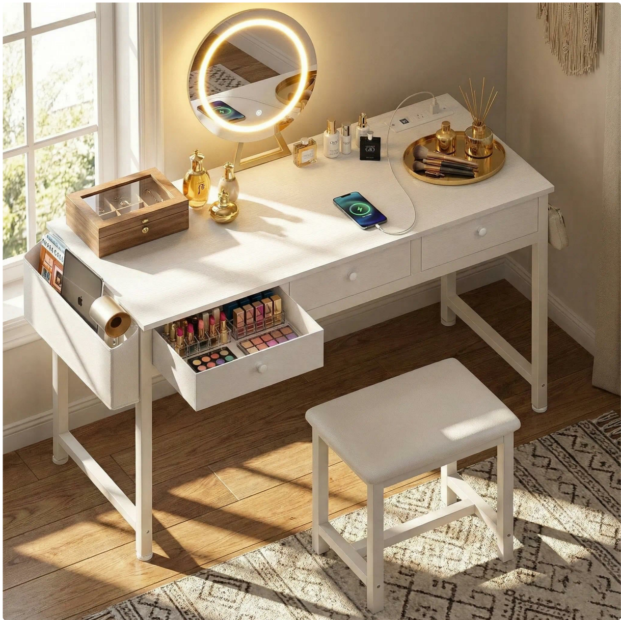
Image 1: KAI-ROAD White Makeup Vanity Desk with Round Mirror and Lights.