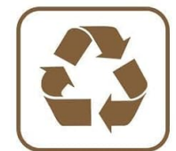
Environment All Protection