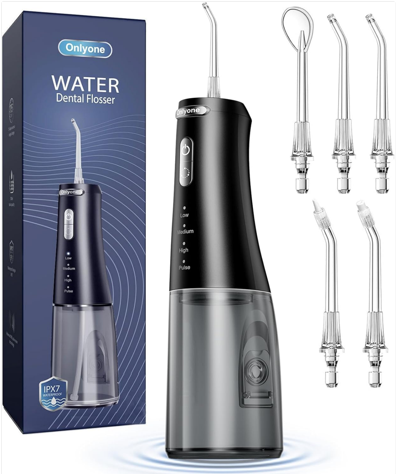
Image: The Onlyone Water Dental Flosser main unit, its packaging, and the five included jet tips.