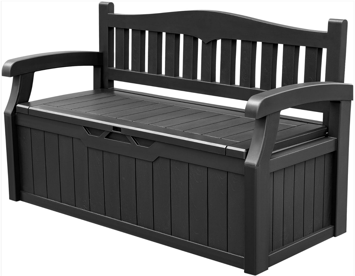
Figure 1: Fully assembled Devoko 80 Gallon Storage Bench.