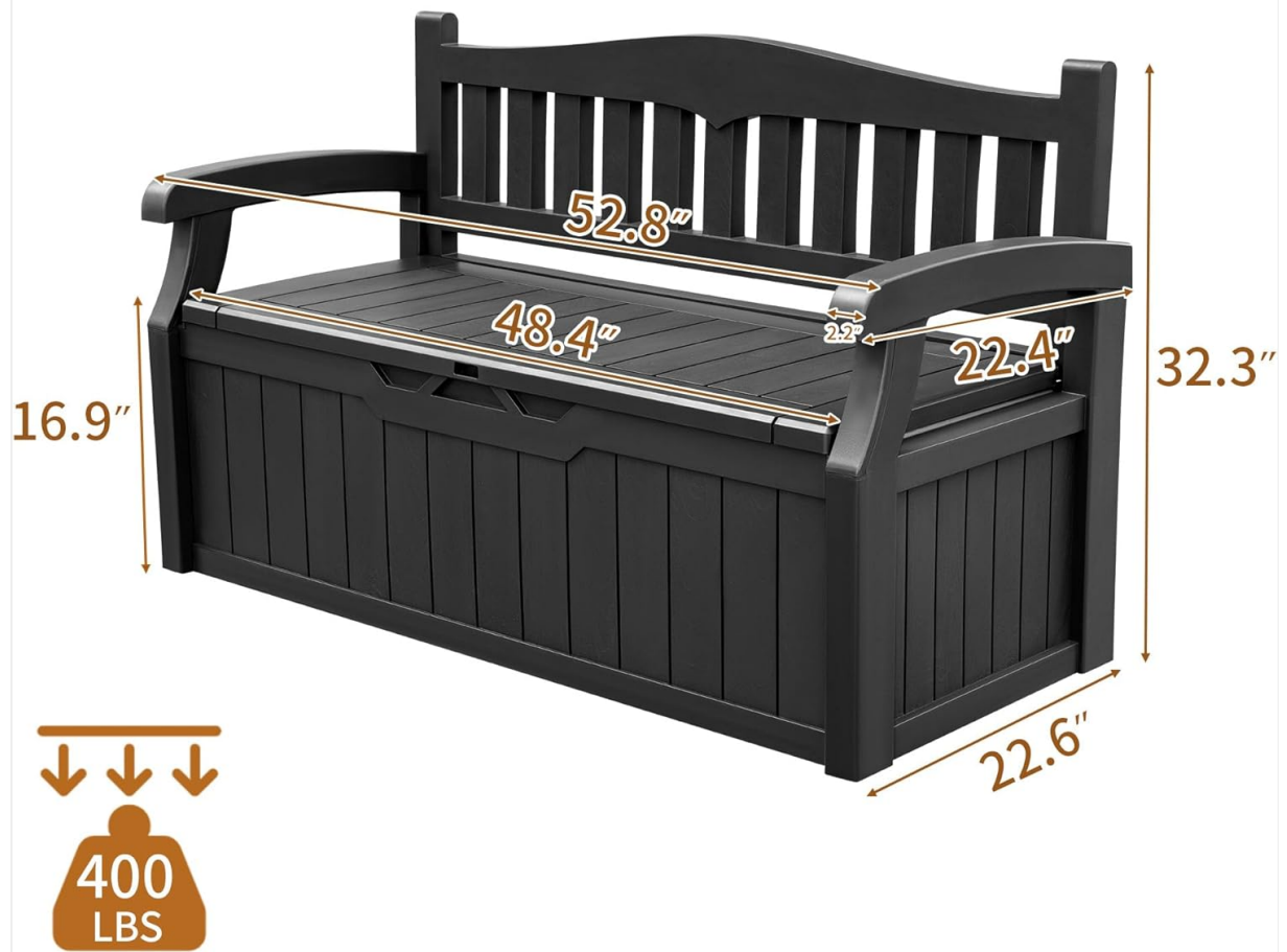
Figure 2: Product dimensions for planning placement. Exterior: 52.8 in. L x 22.6 in. W x 32.3 in. H. Interior: 48.4 in. L x 22.4 in. W x 16.9 in. H.