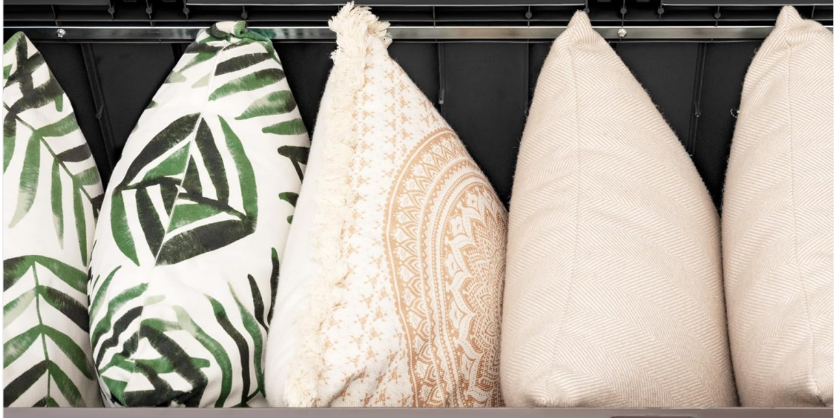
Figure 4: View of the spacious 80-gallon interior, ideal for storing various outdoor items.

Your browser does not support the video tag.