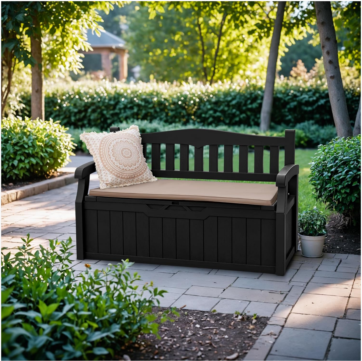
Figure 5: The storage bench comfortably accommodates seating, shown here with an added cushion.