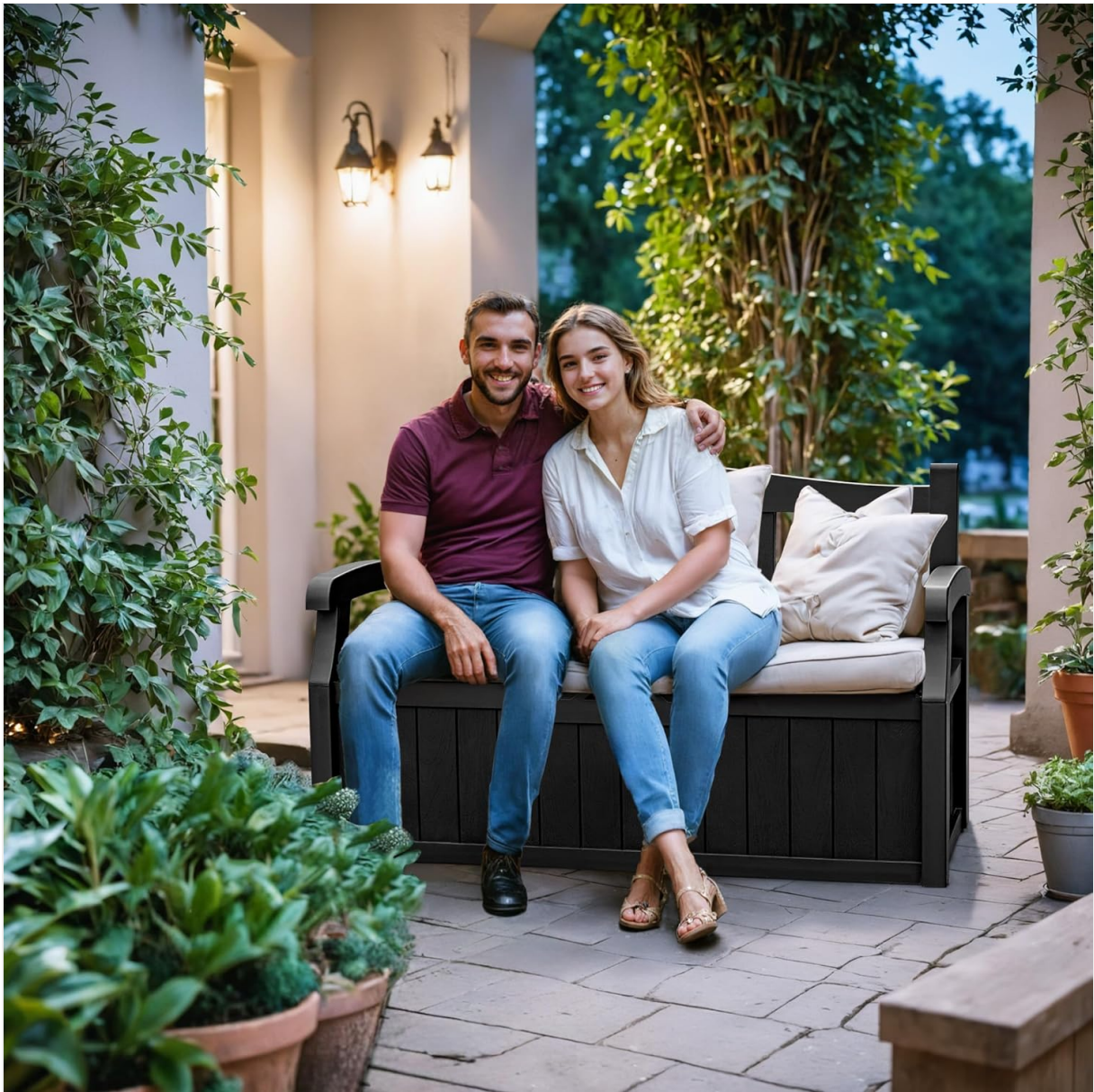
Figure 6: The bench provides comfortable and stylish outdoor seating for multiple people.