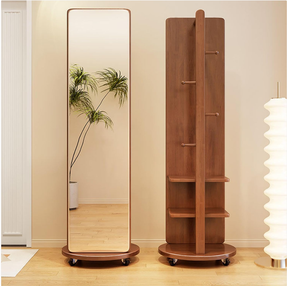
Image 2.2: Rear view illustrating the coat rack structure and three open shelves.