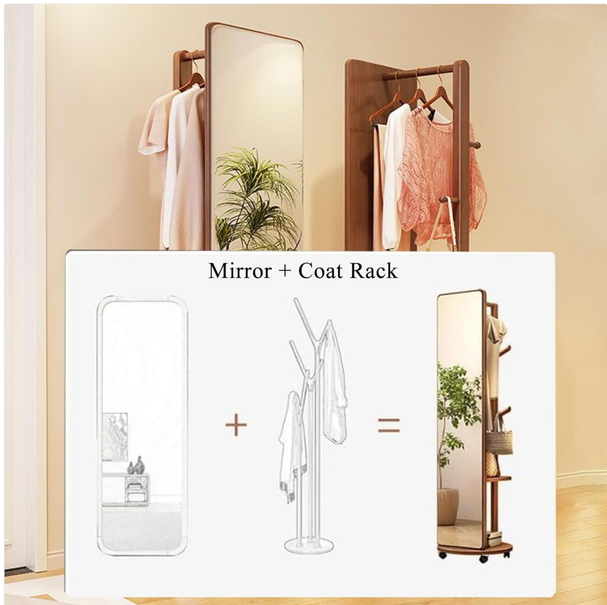
Image 1.1: Front view of the assembled full length mirror with integrated coat rack and shelves.