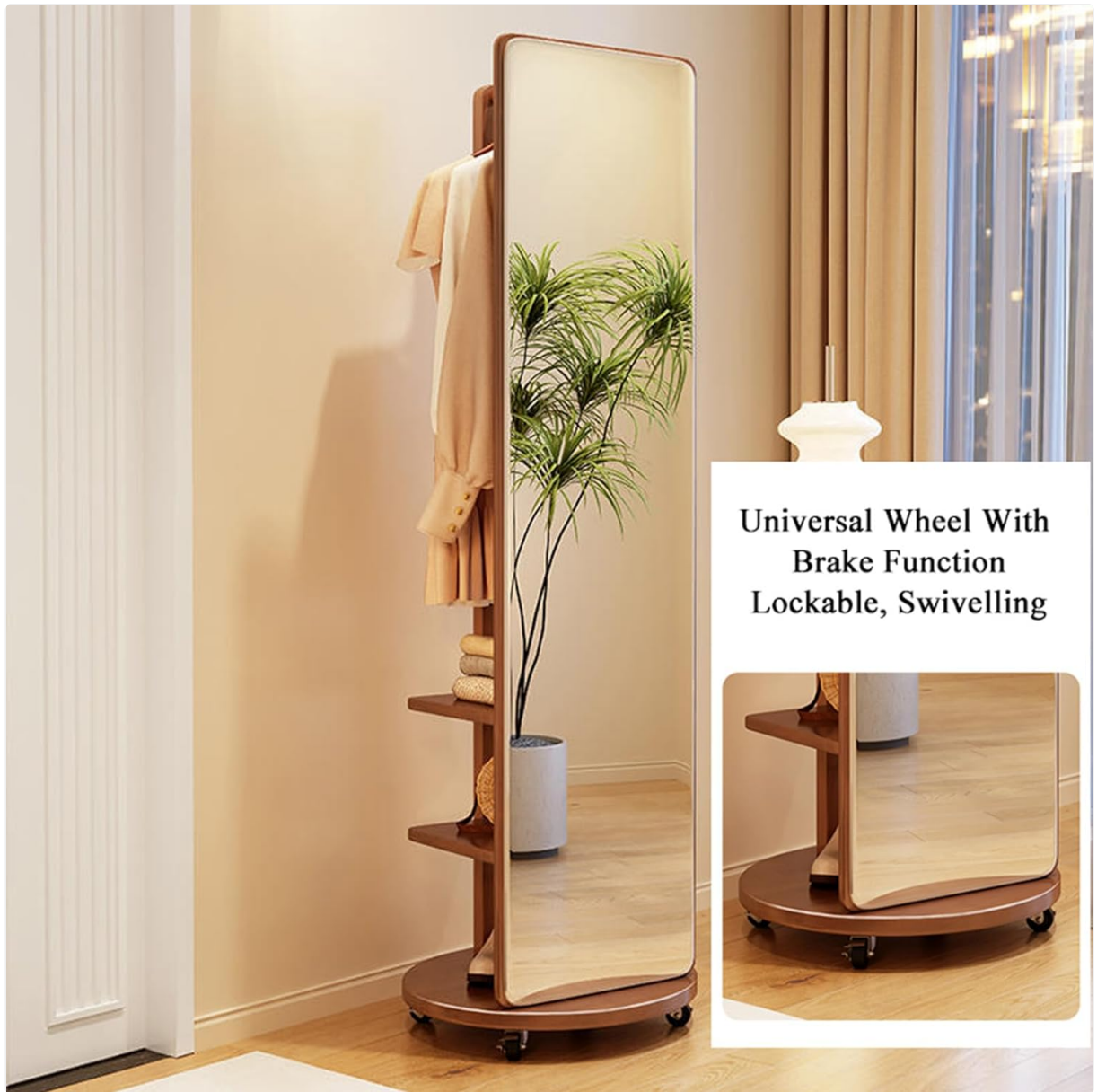
Universal Wheel With Brake Function Lockable, Swivelling