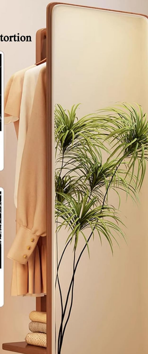
Image 3.2: Illustration of the high-definition, explosion-proof mirror, showing how it prevents splinters upon impact compared to non-explosion-proof mirrors.

Non-Explosion-Proof Mirror When Broken, Glass Shards Will Splash Out Easy To Hurt People