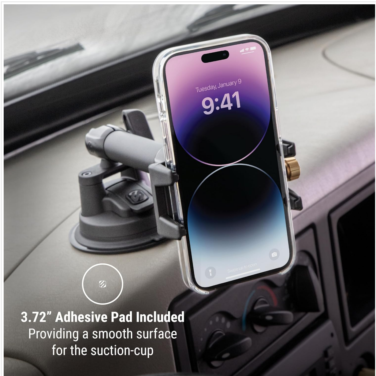
Image: The 3.72-inch adhesive pad included for creating a smooth mounting surface on textured dashboards.

Your browser does not support the video tag.