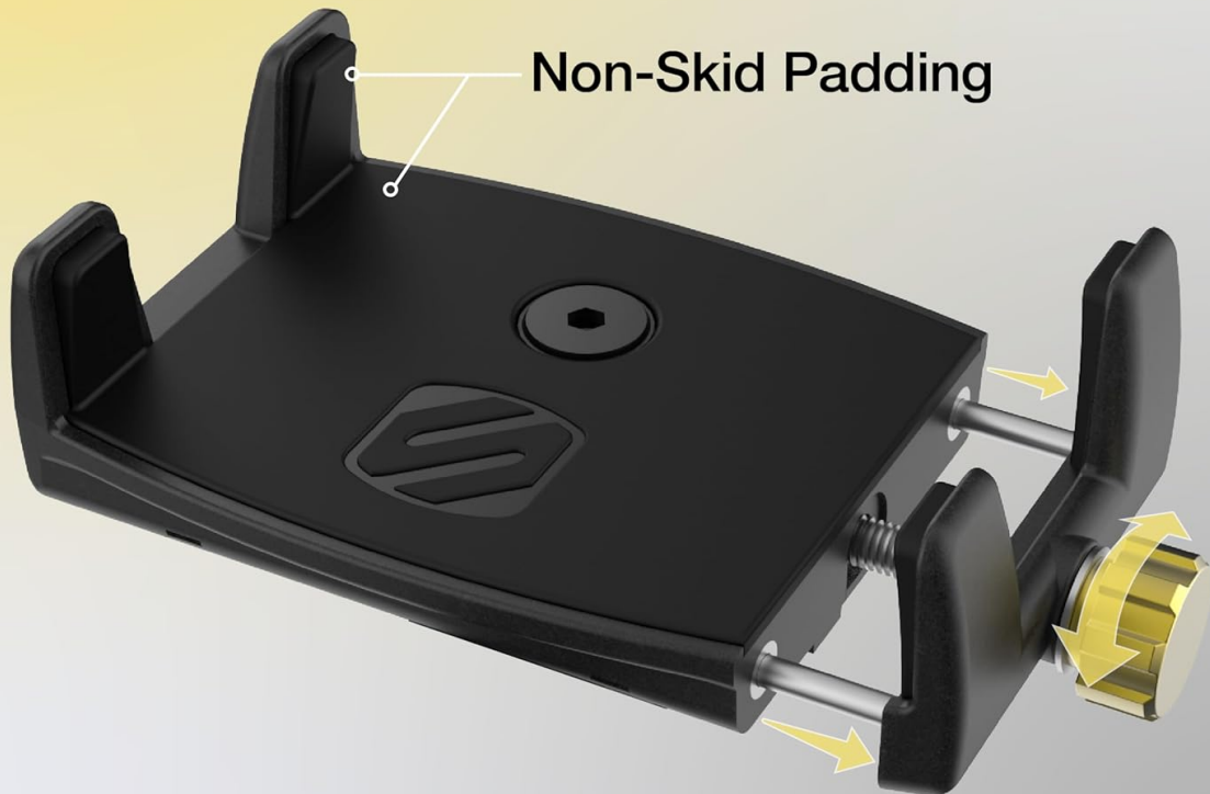
Image: Close-up of the adjustable cradle arms, showing how they expand to fit phones from 2.2 to 4.0 inches wide.