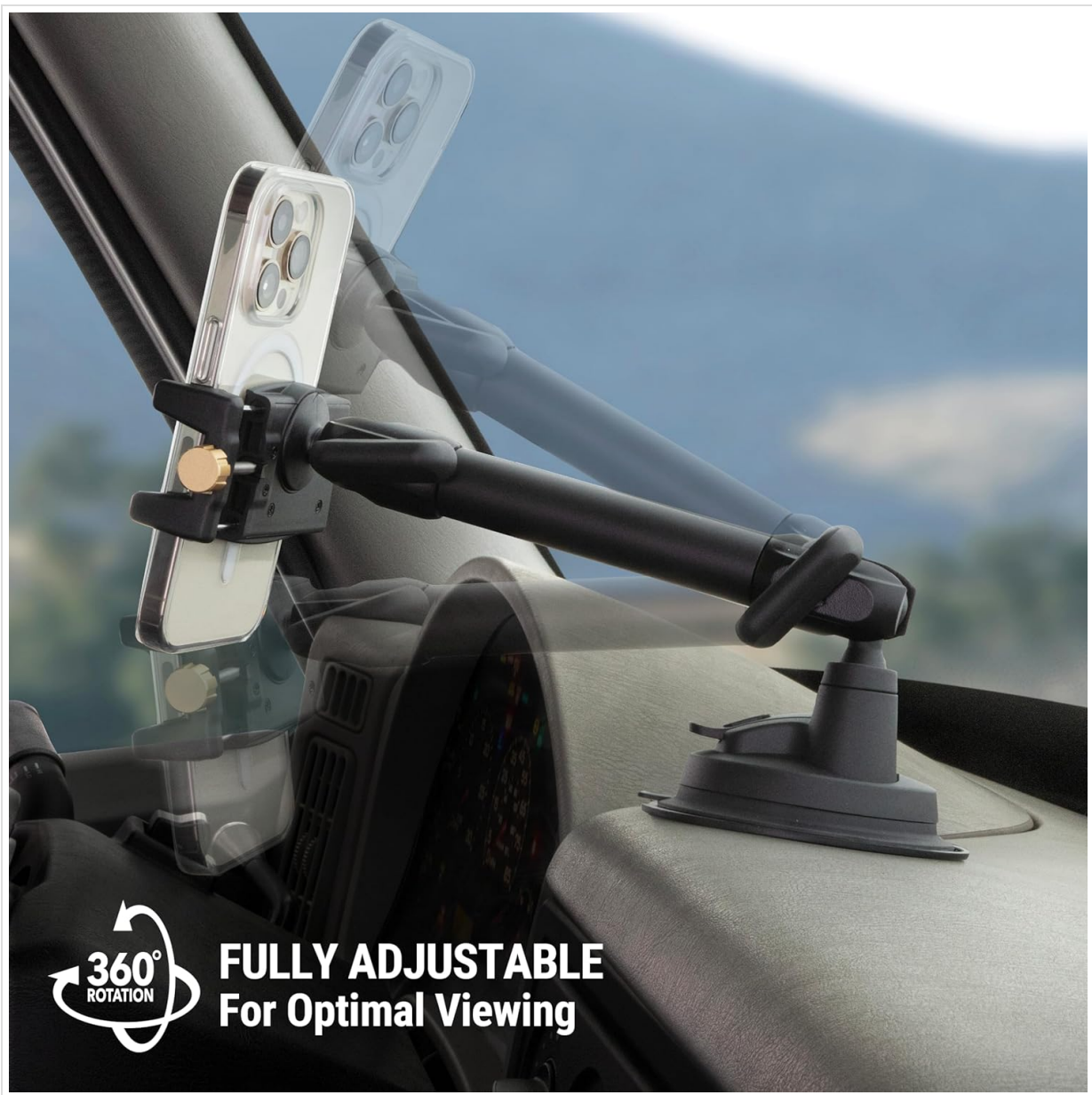
Image: Illustration of the mount's 360-degree rotation capability for optimal viewing angles.

Your browser does not support the video tag.