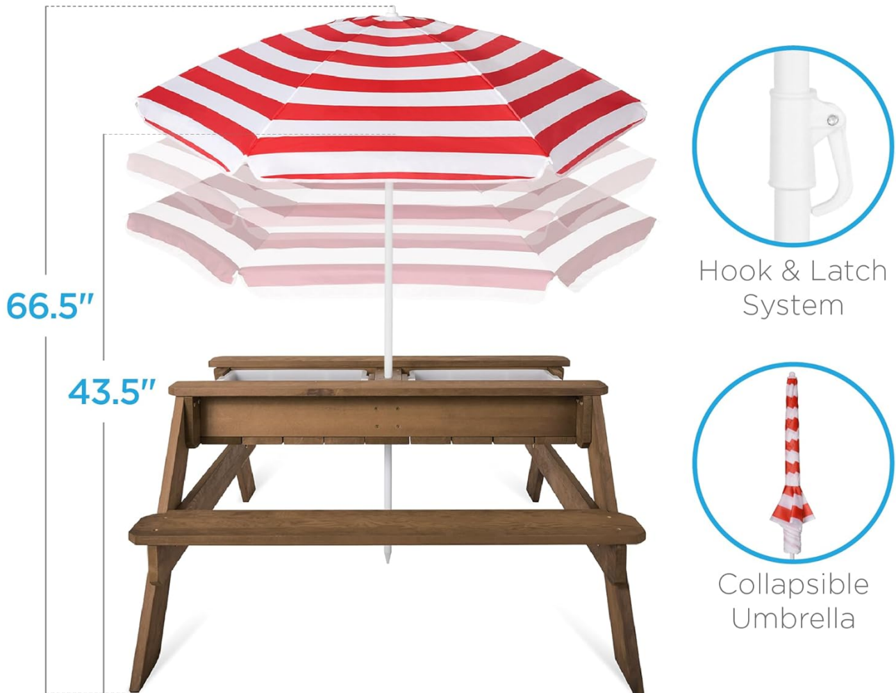
Image: Diagram illustrating the adjustable umbrella feature with the hook and latch system.

Freely raise and lower the umbrella for maximum coverage throughout the day