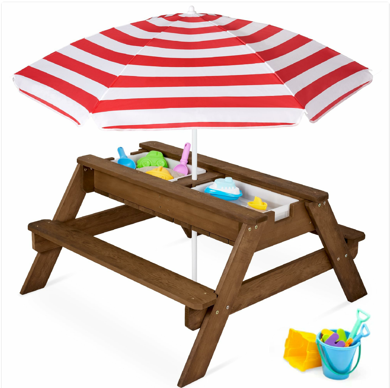
Image: The Best Choice Products Kids 3-in-1 Picnic Table in Walnut/Red with its umbrella extended.