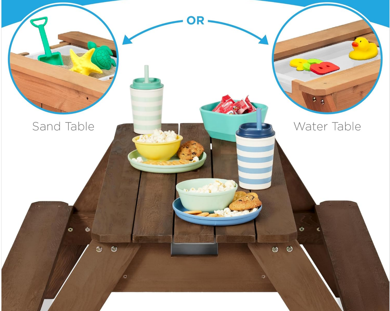
Image: The table with the central wooden panels removed, revealing two activity bins for sand or water play.

Remove the table top to switch between a picnic set, a sand table, or a water table!