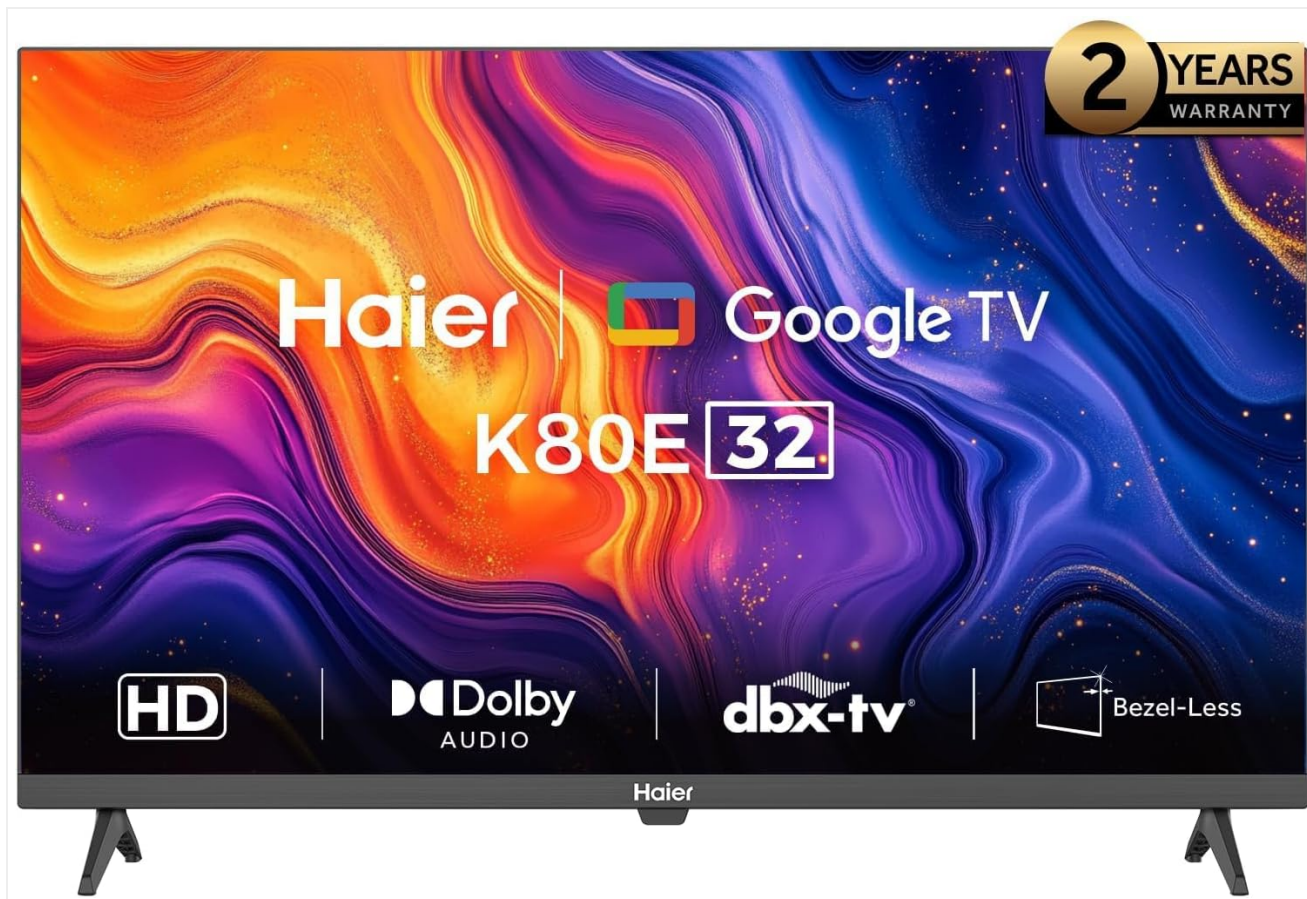
Front view of the Haier H32K80E 32-inch HD Smart Google TV.