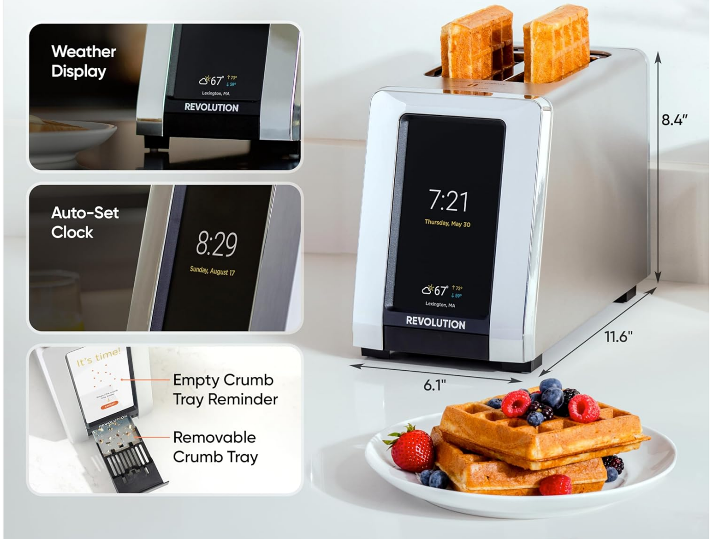
Image 6.1: The removable crumb tray, shown being accessed for cleaning.