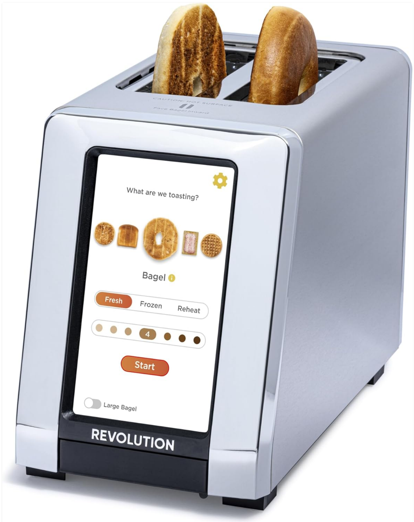
Image 1.1: The Revolution R180 Connect Smart Toaster, featuring a touchscreen display and two toasting slots.