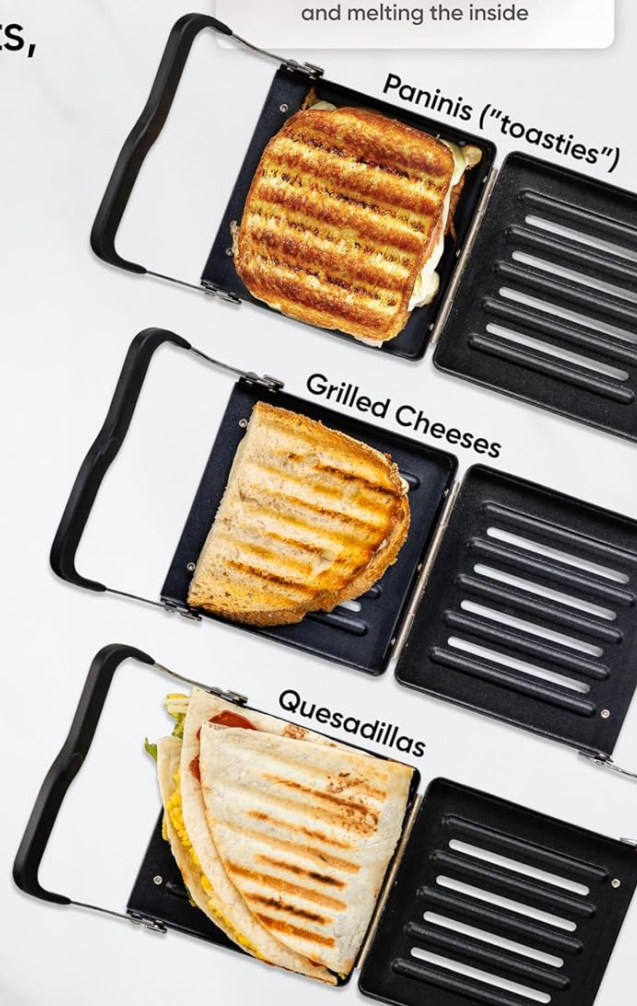
Image 5.3: The Revolution Toastie Press, an optional accessory for making toasted sandwiches.