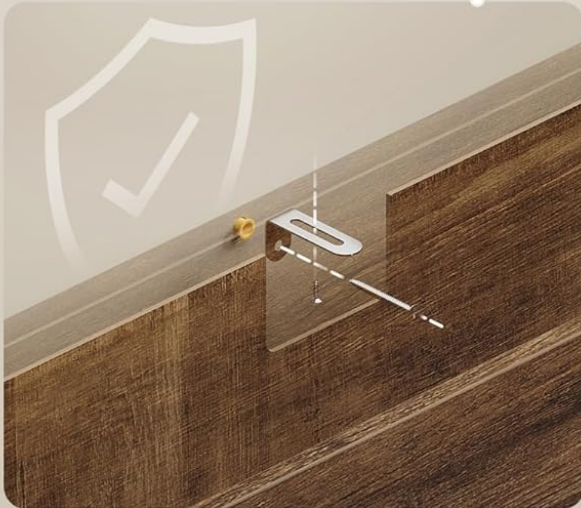
Anti-tip kit secures it to the wall for safety