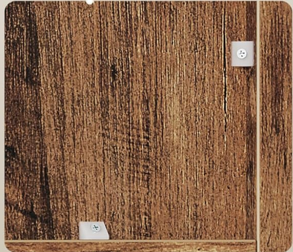
Back panels with reinforcements enhance stability

Image: The interior of the cabinet with an adjustable shelf, illustrating the five available height options to accommodate different item sizes.