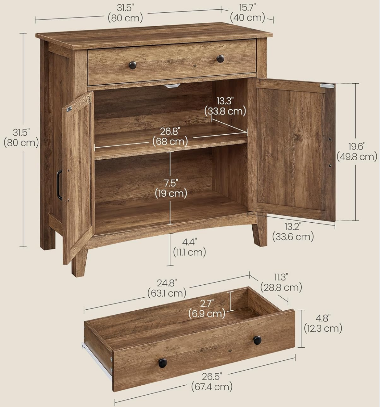
Image: Detailed dimensions of the cabinet, showing the overall size and internal measurements, including the strategically placed cable management hole at the back.

↓ ↓ ↓ Total Max. Static Load Capacity: 285 lb (129.5 kg)