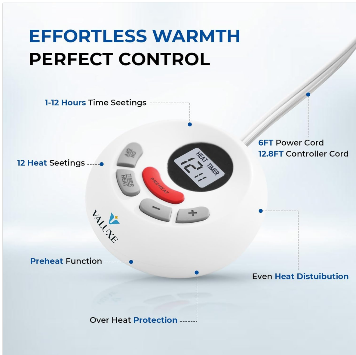
Figure 5: The controller for the VALUXE Heated Mattress Pad, illustrating its various functions.