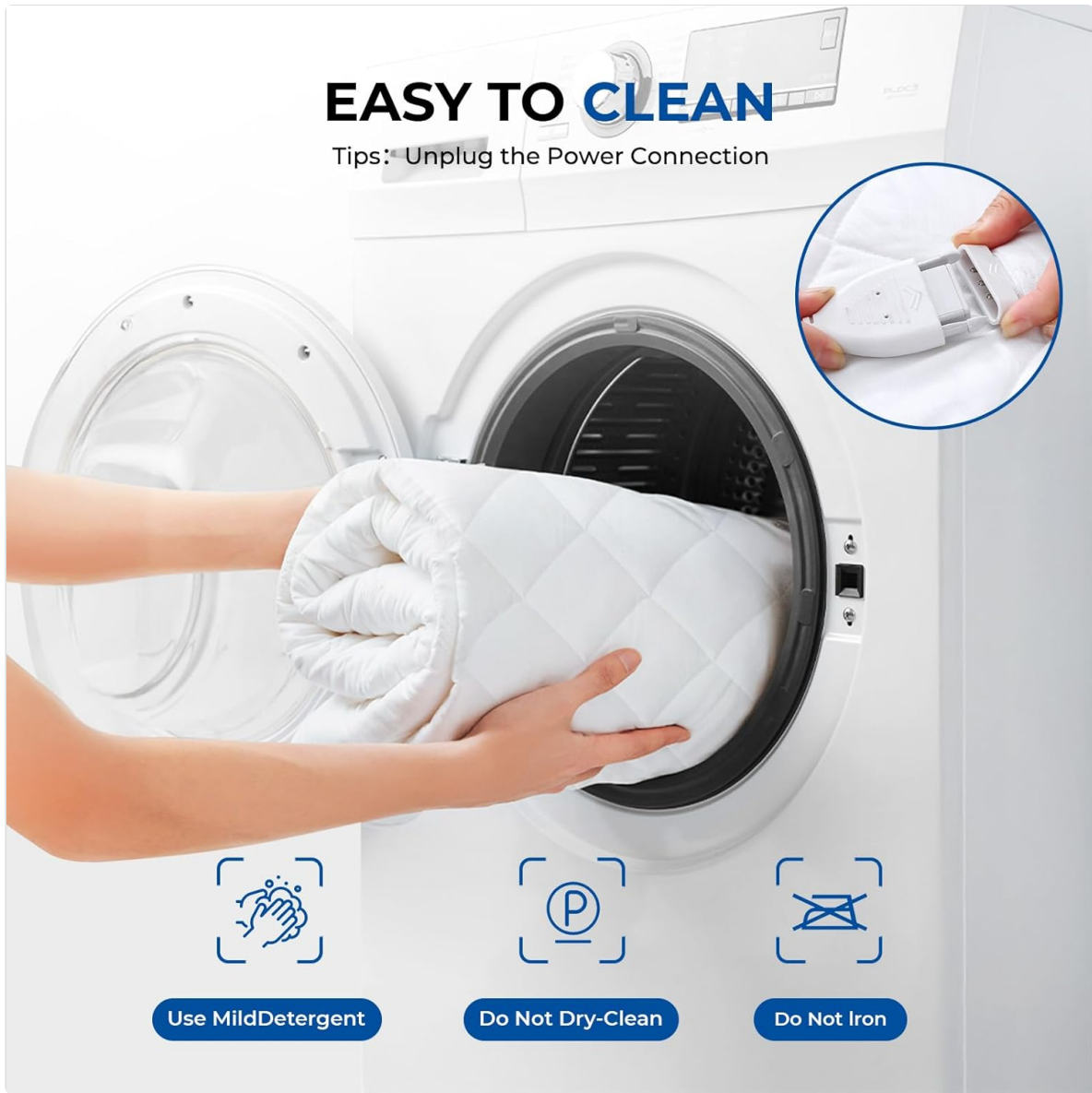
Figure 7: Instructions for machine washing the heated mattress pad.