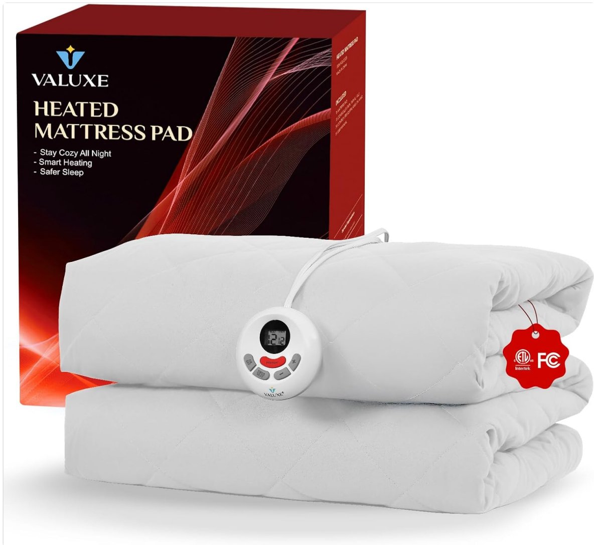
Figure 2: The VALUXE Heated Mattress Pad and its controller as packaged.