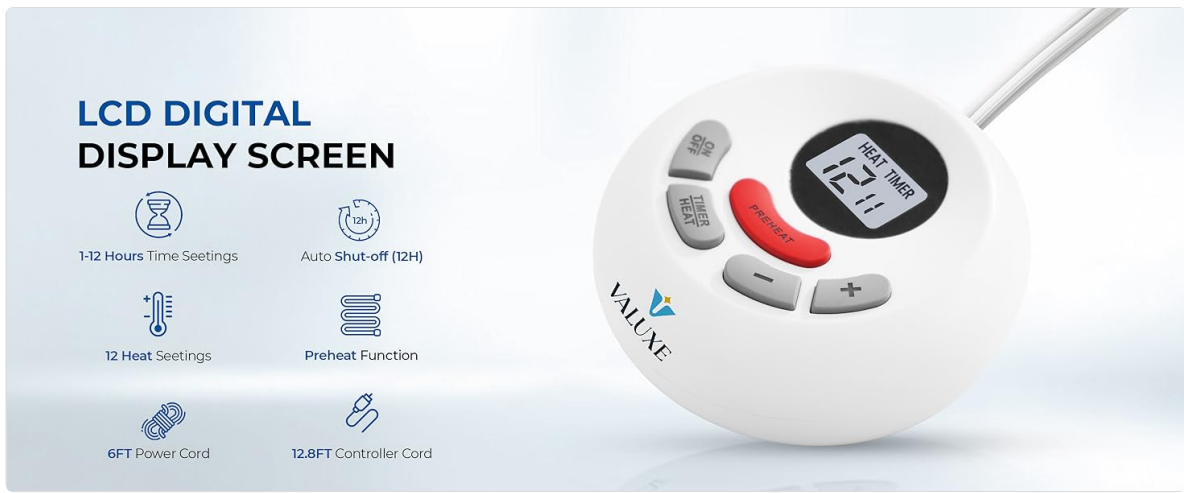
Figure 6: Detailed view of the controller's LCD display and functions.