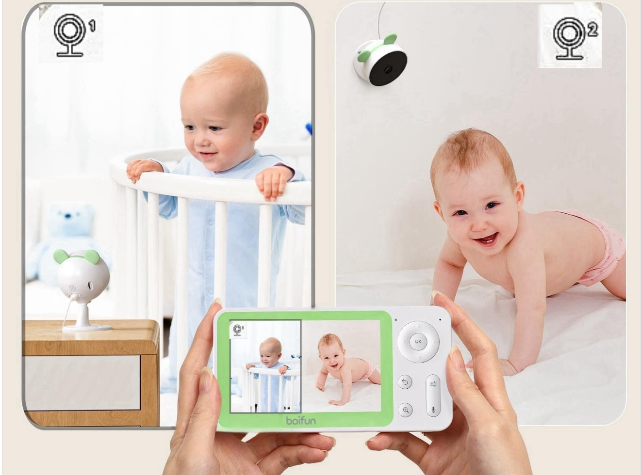
Image: The split-screen feature showing two camera feeds on the parent unit.

Provide double help for taking care of your baby