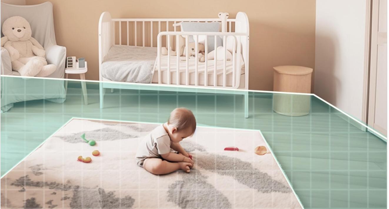
Image: Smart care features include movement and sound detection alerts.

When the baby exceeds the set area, you will receive a timely alarm