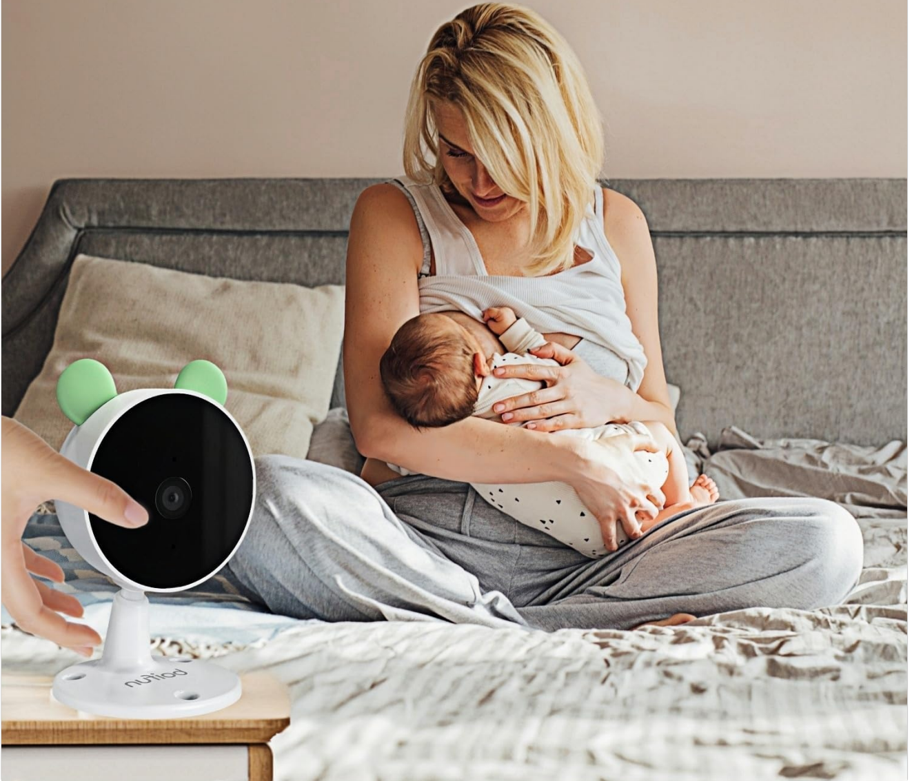
Image: The BOIFUN monitor uses invisible infrared light to protect your baby's eye health.

Even if other family members are connected to the camera, it ensures 100% privacy for you.