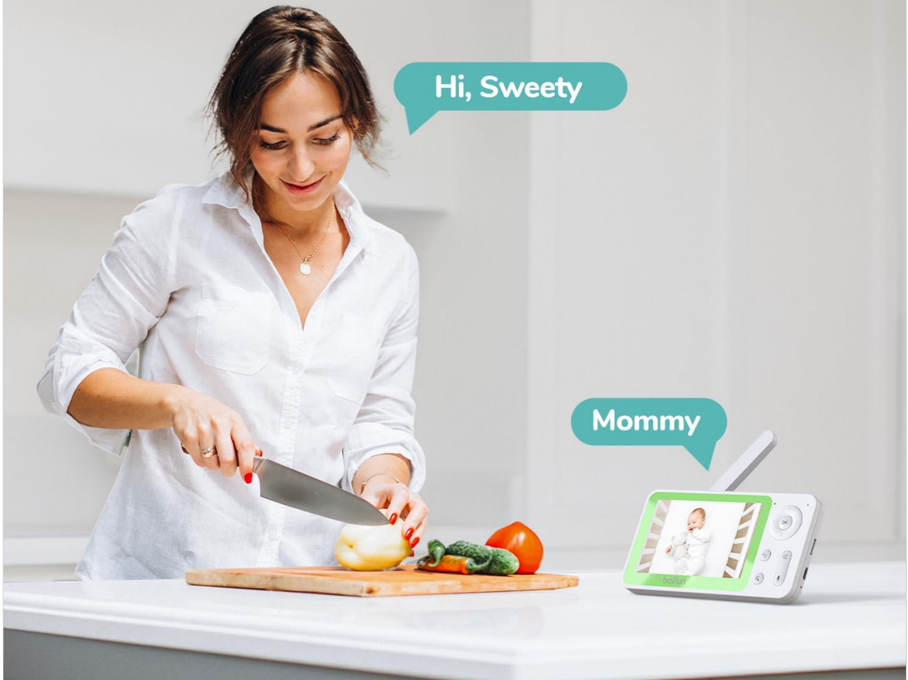
Image: Two-way audio allows seamless interaction with your baby.

Communication for seamless interaction with your baby