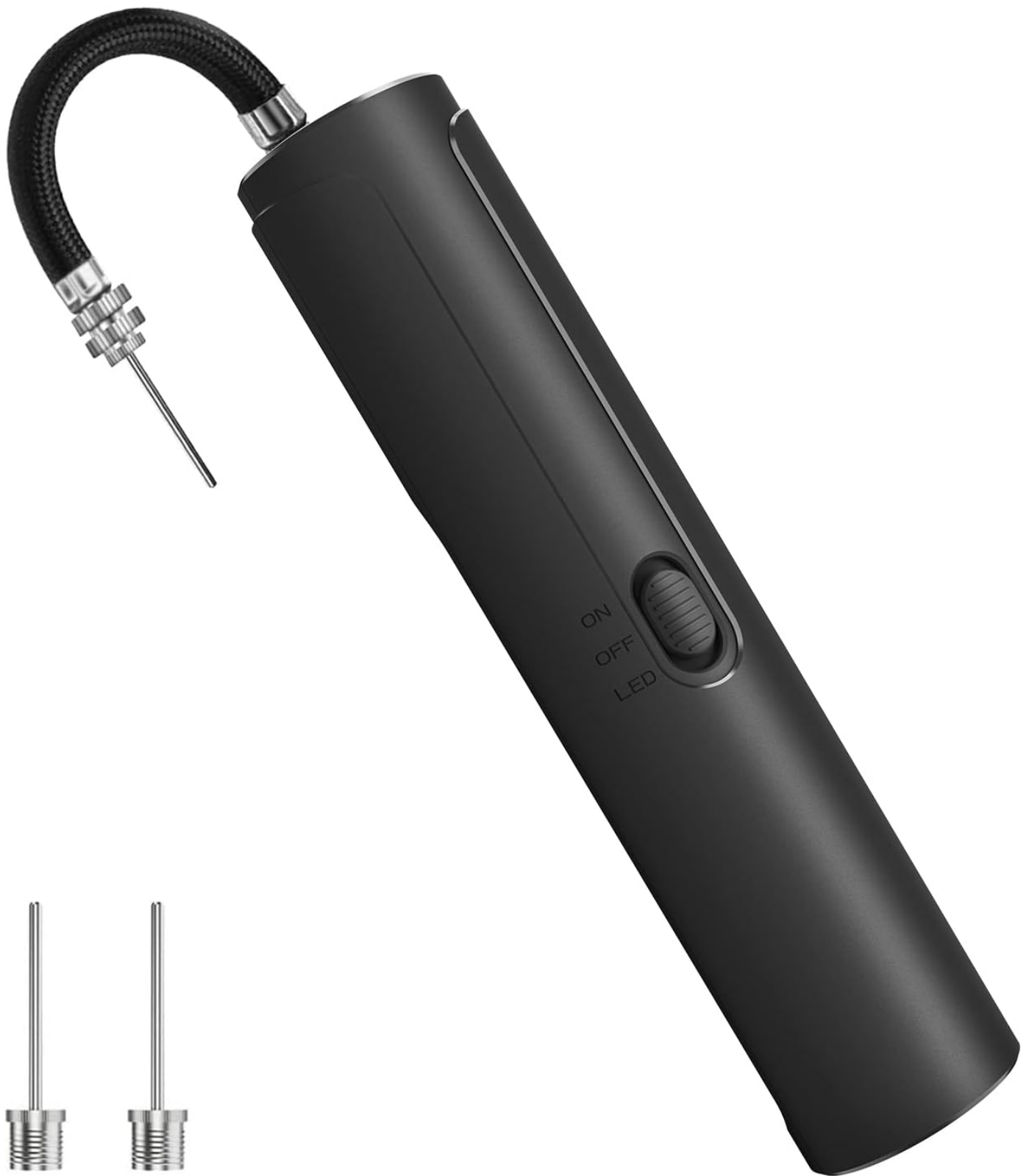
Image: The main unit of the Pumteck Electric Ball Pump, showing the hose attachment point and the included needles.