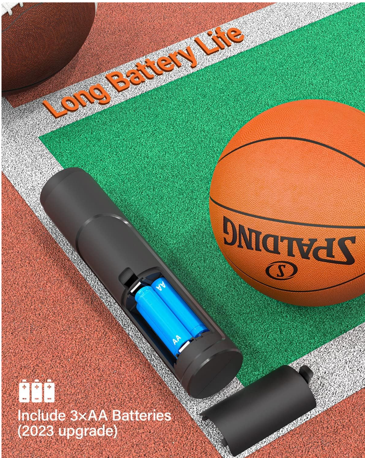
Image: The pump with its battery cover removed, illustrating where to insert the three AA batteries.