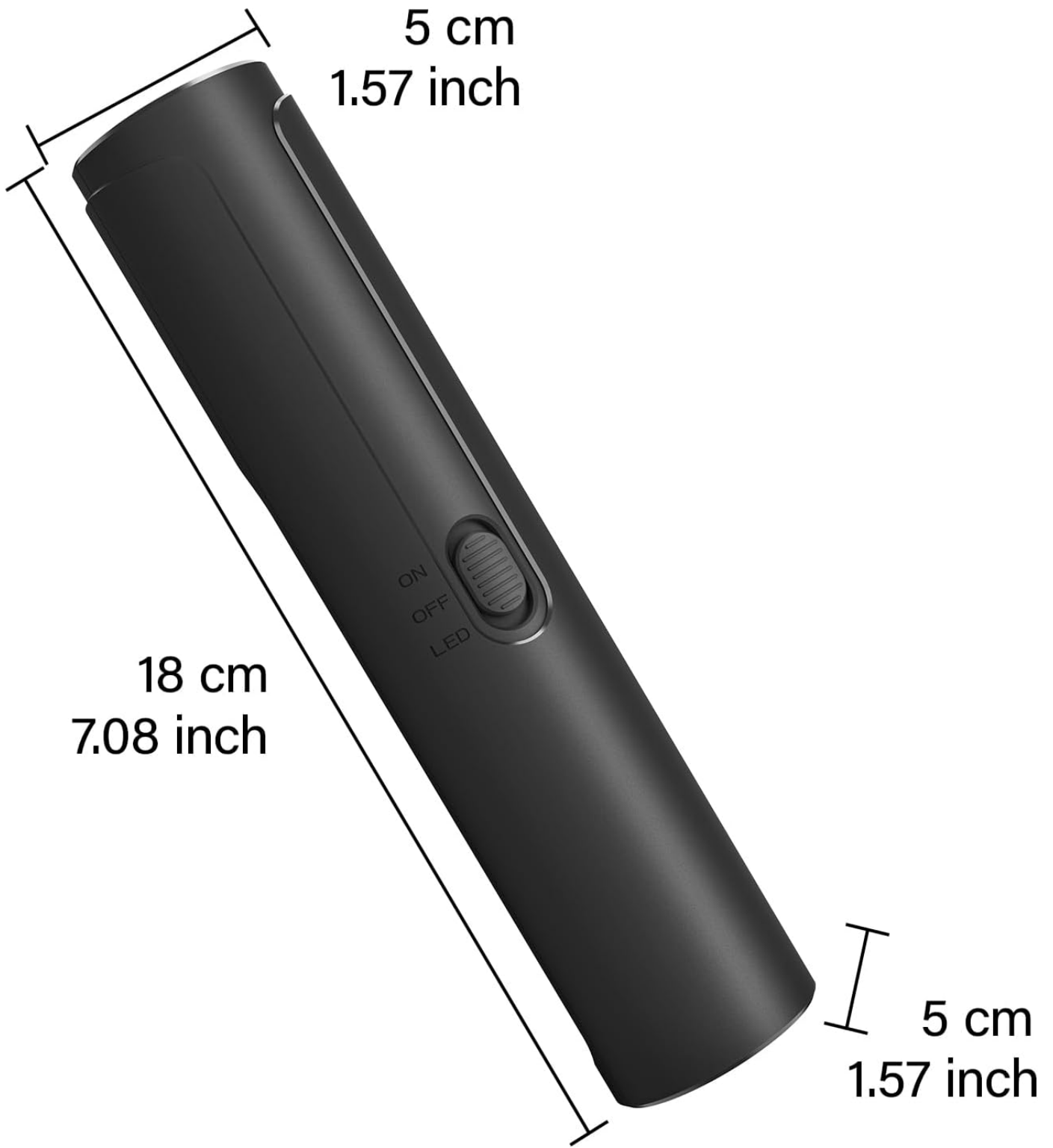
Image: A diagram illustrating the physical dimensions of the electric ball pump in both centimeters and inches.