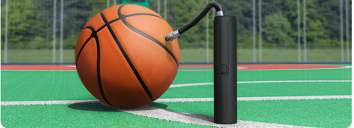
Image: Comparison showing the ease of use of the electric pump versus a manual pump, emphasizing time and energy savings.