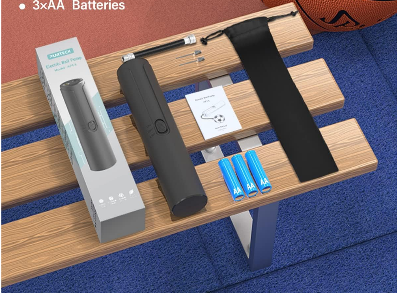
Image: A visual representation of all included components: the electric pump, air hose, two needles, storage bag, product manual, and three AA batteries.