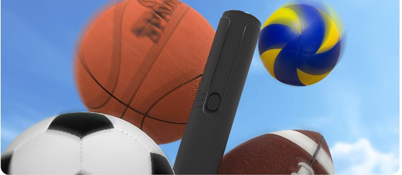
Image: A close-up view of the pump's LED light in action, highlighting its utility for dark conditions.

(Not for Yoga Balls, Exercise Balls, Beach Balls and Balloons)