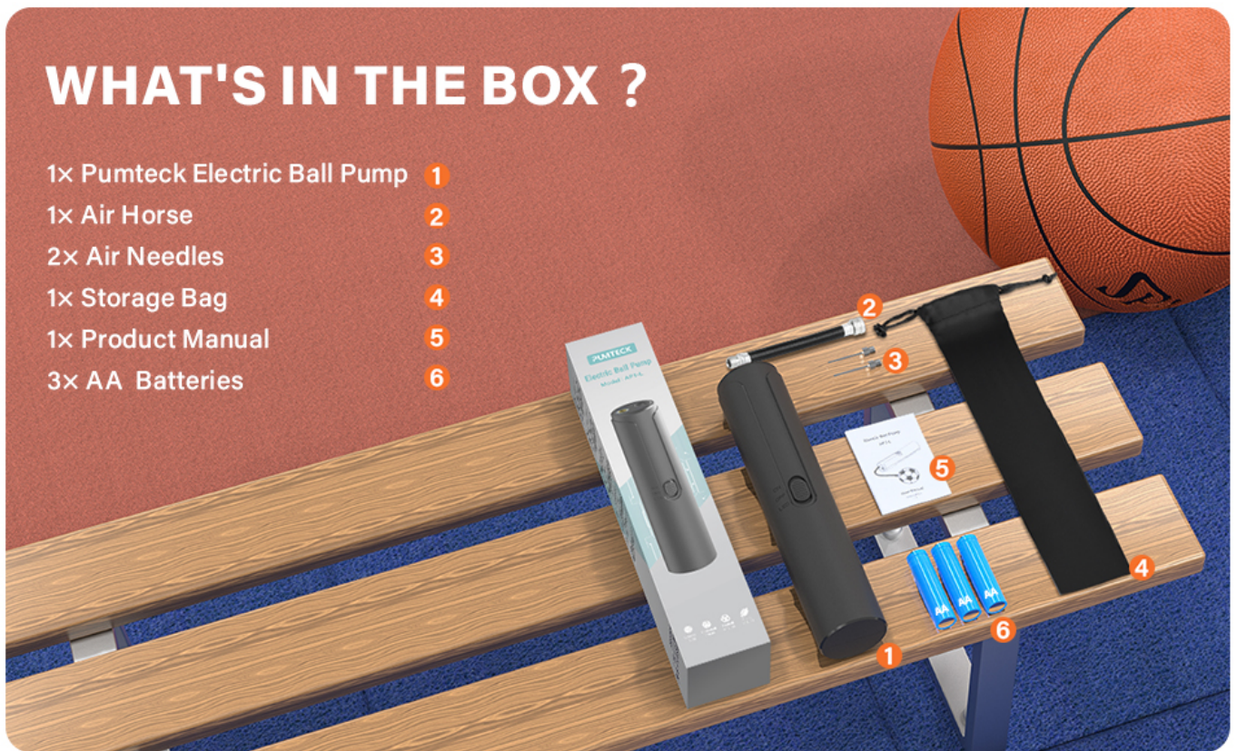
Image: A detailed diagram illustrating each item included in the product package with corresponding numbers.