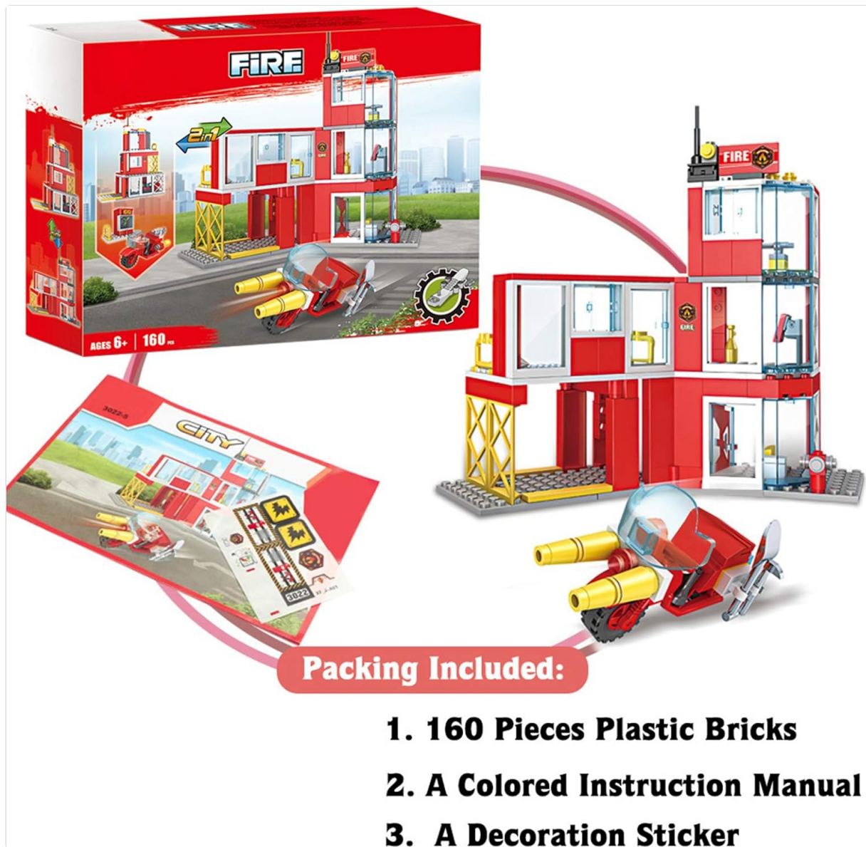
Figure 1: Package contents of the COGO City Fire Station Building Blocks Set.