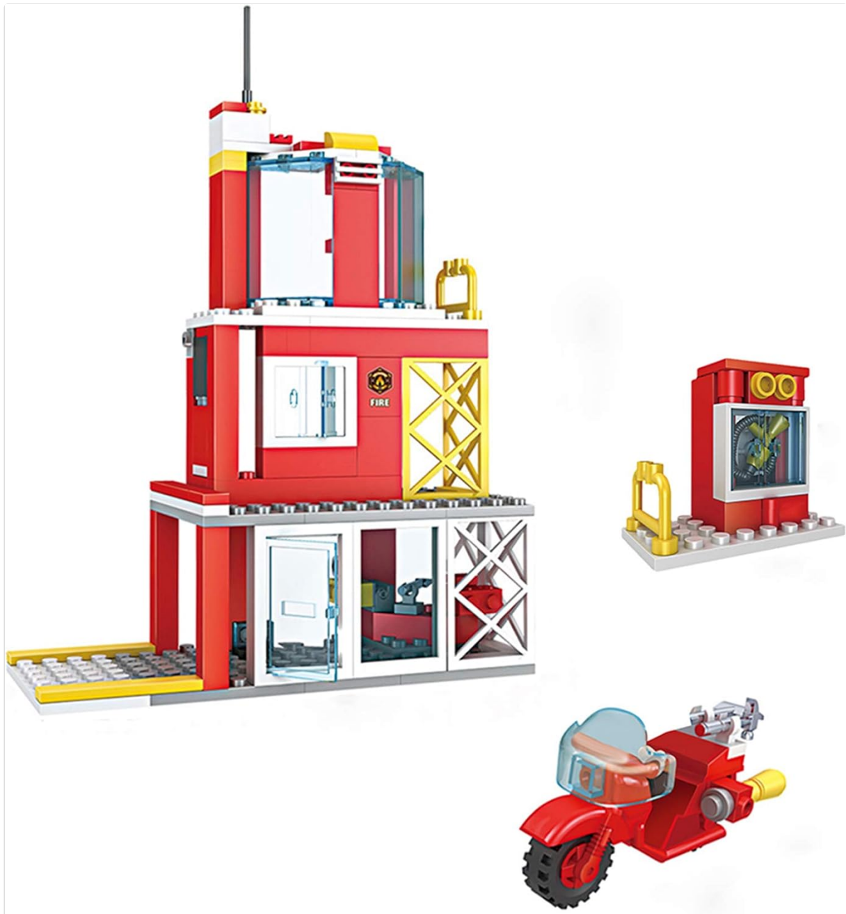
Figure 2: Assembled 3-floor fire station with fire hydrant and motorcycle.