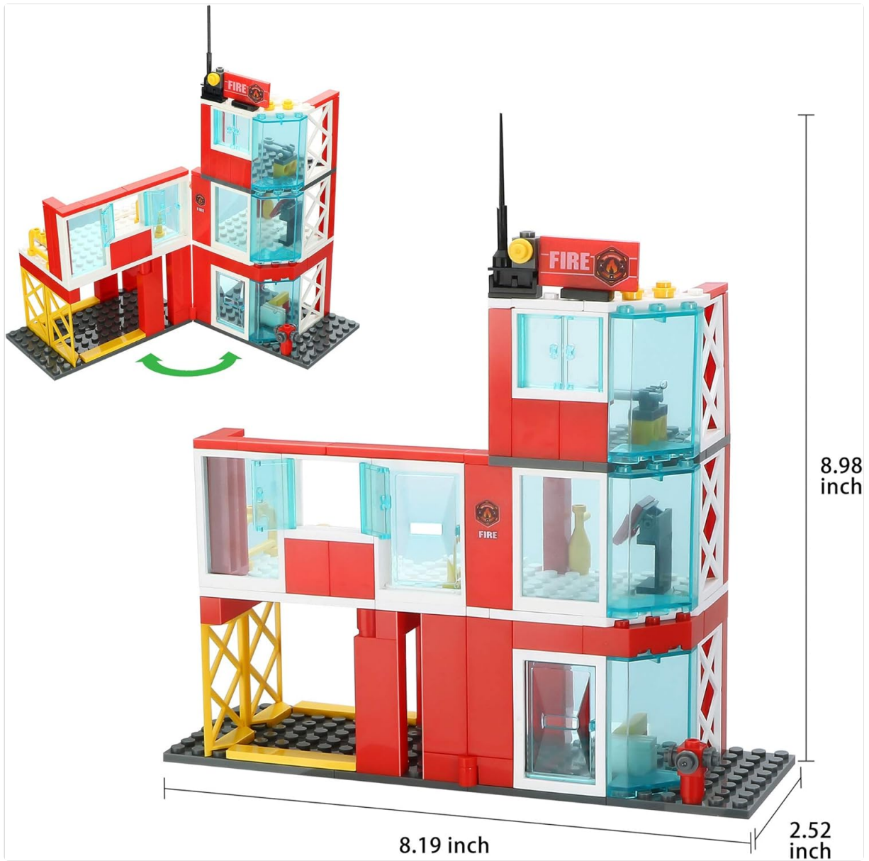
Figure 7: Dimensions of the foldable fire station.