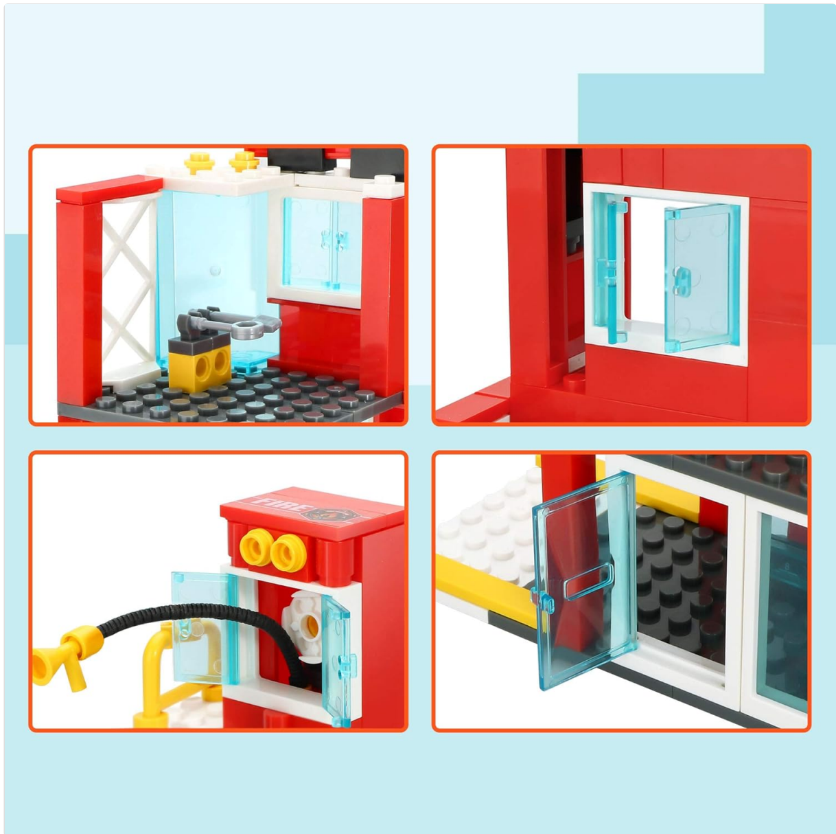
Figure 4: Close-up views of building block details.