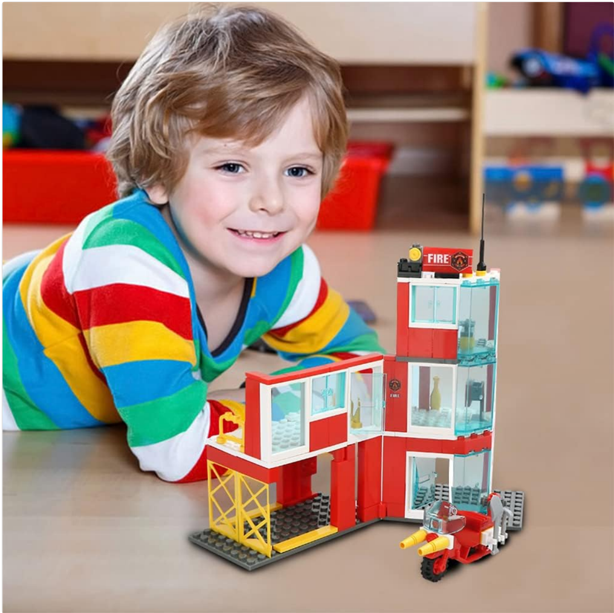
Figure 5: Example of play with the assembled fire station.