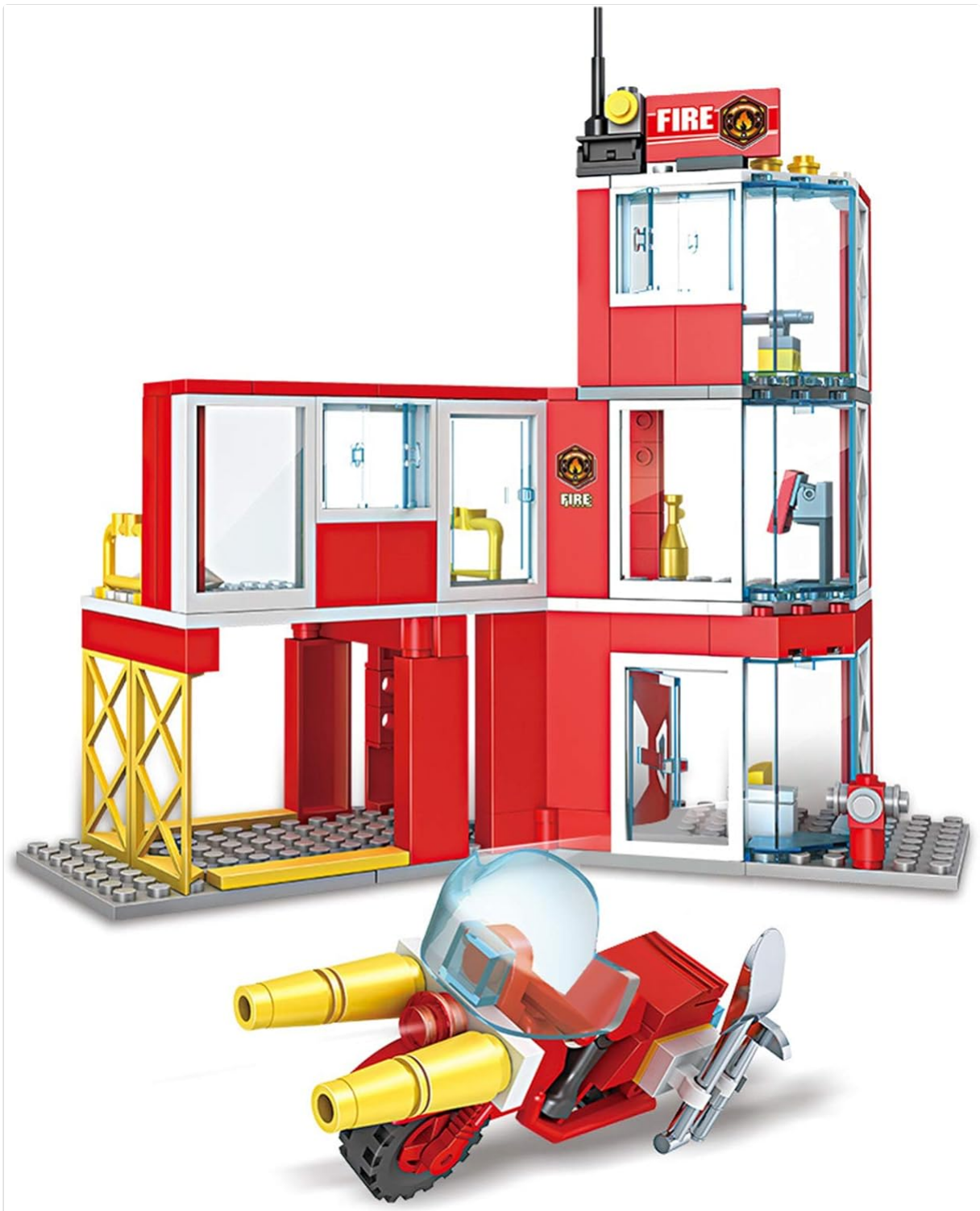
Figure 3: Assembled foldable fire station with motorcycle.