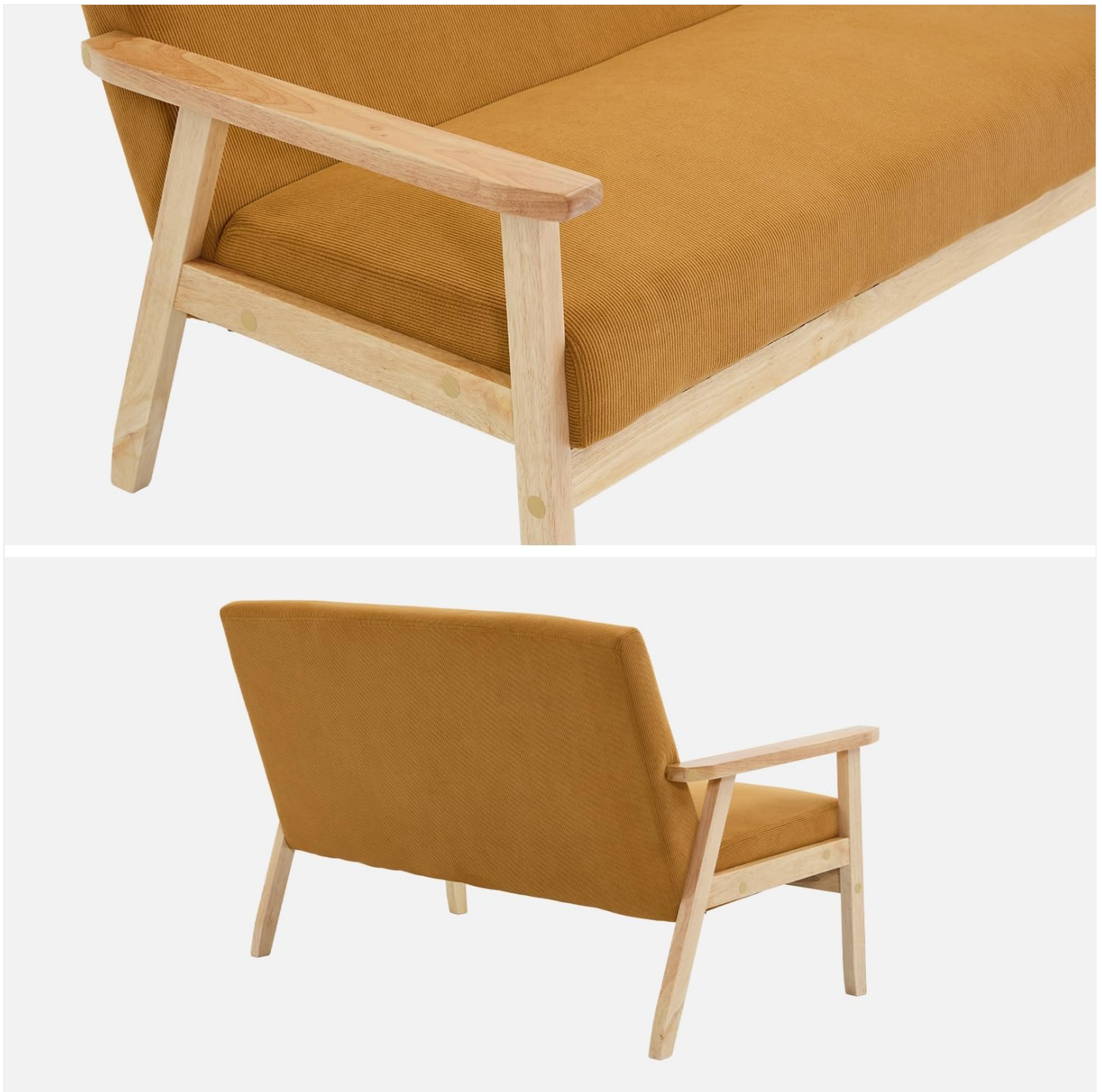
Image 2: Side view of the sofa, illustrating its compact design and wooden legs.