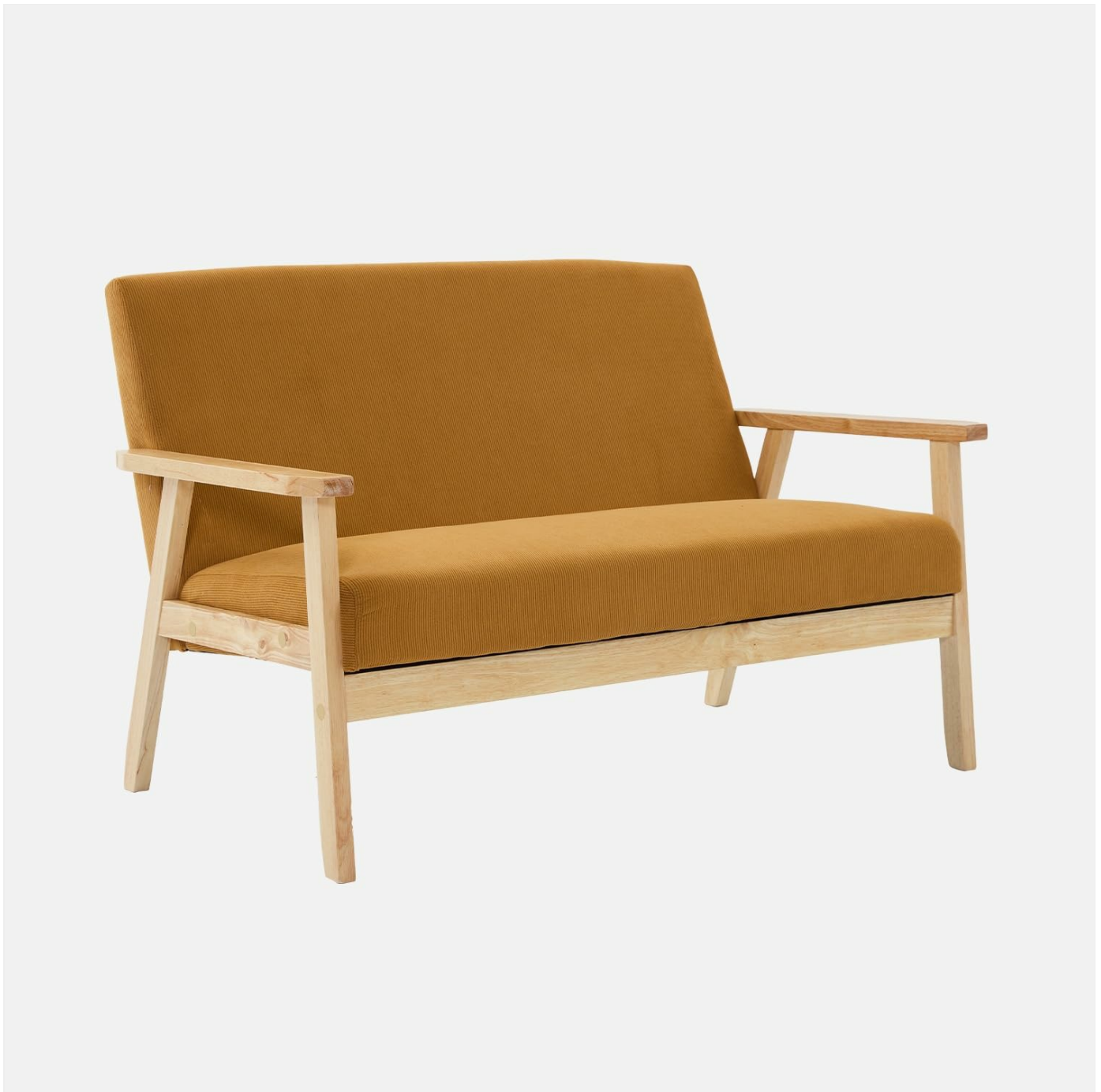
Image 1: Front view of the sweeek Isak 2-seater sofa bench in mustard corduroy velvet.