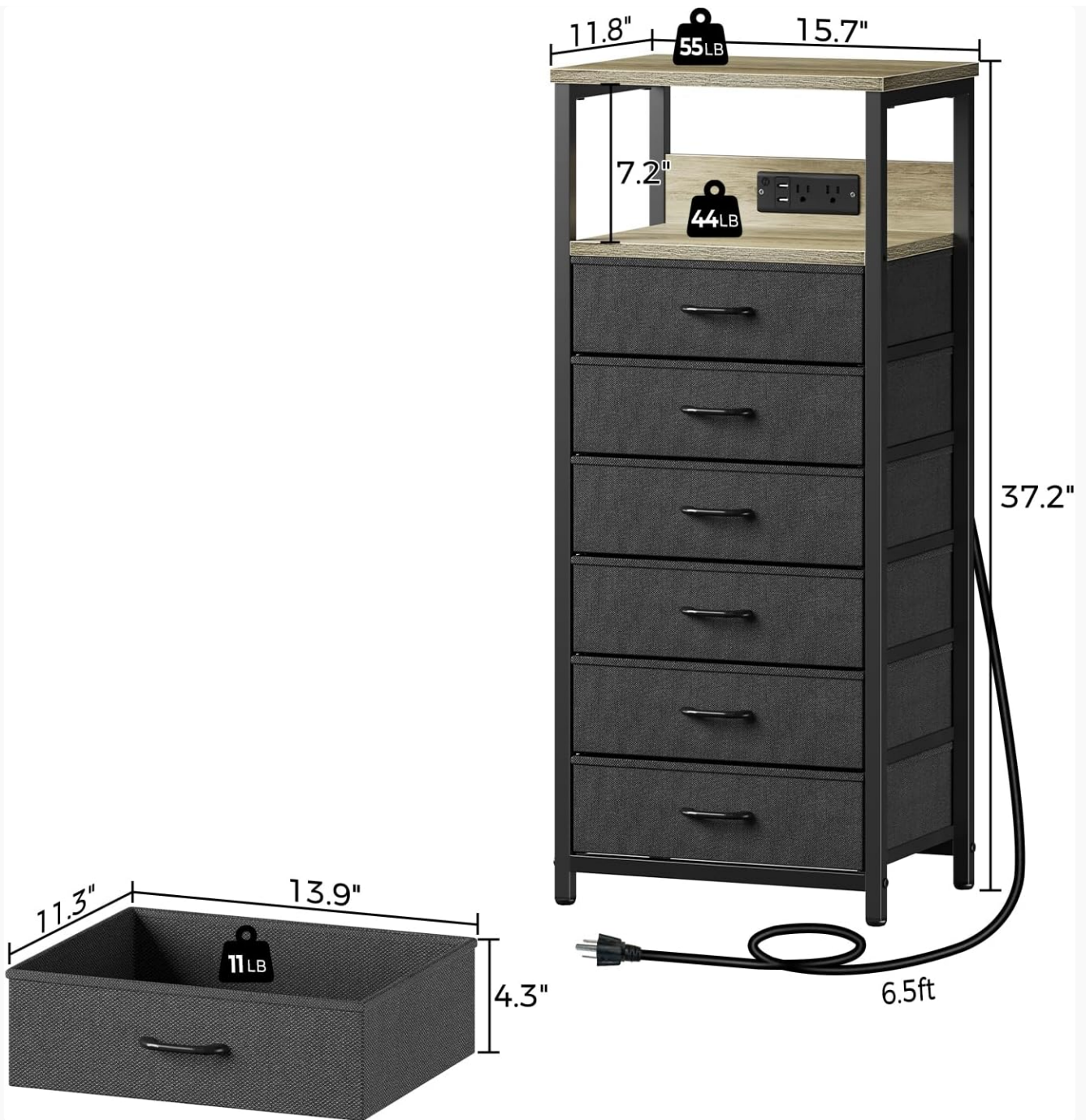
Image: Diagram illustrating the dimensions of the night stand and the weight capacities for the tabletop and individual drawers.