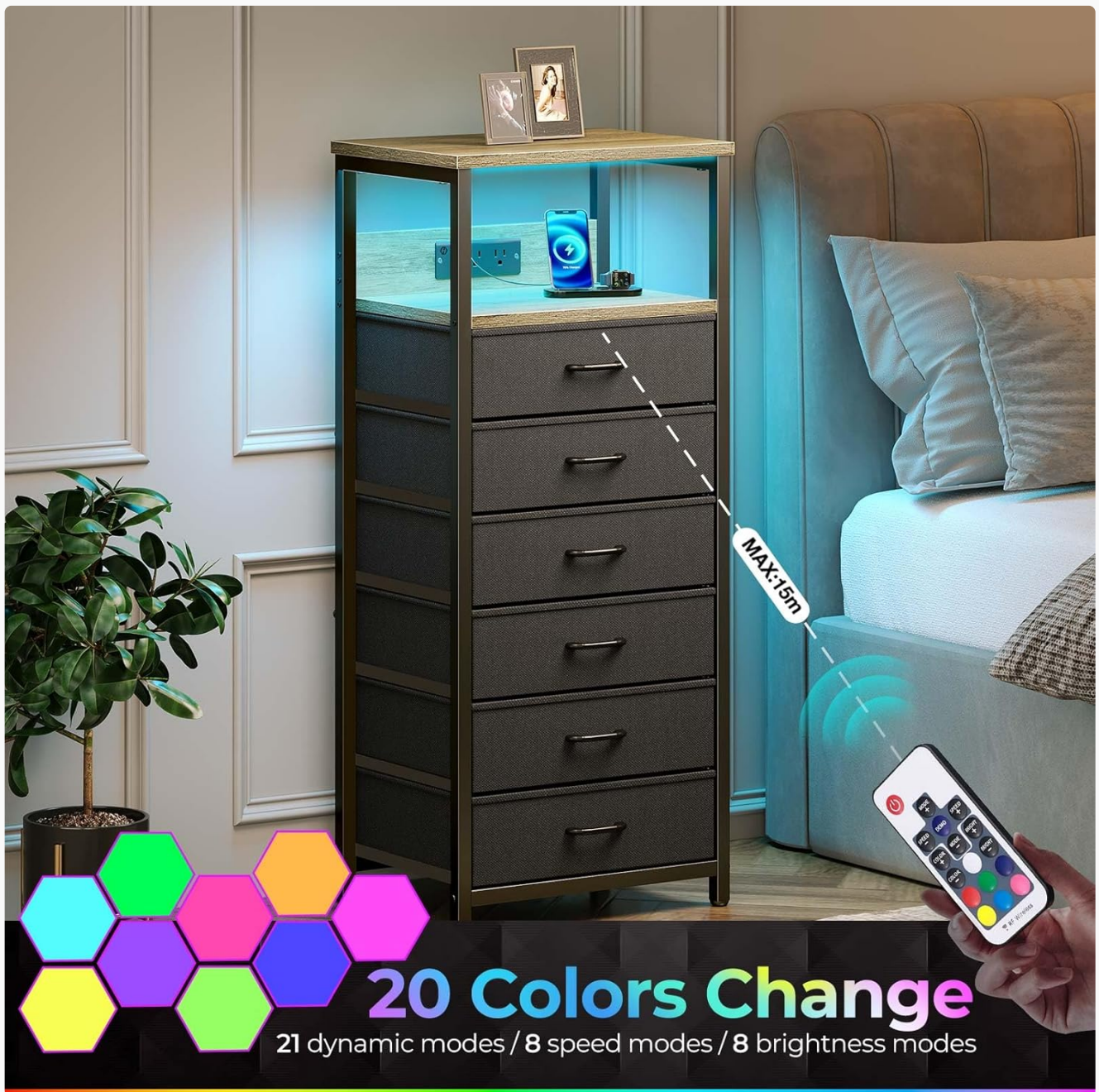
Image: The night stand illuminated by its LED lights, with the remote control visible for adjusting colors and modes.