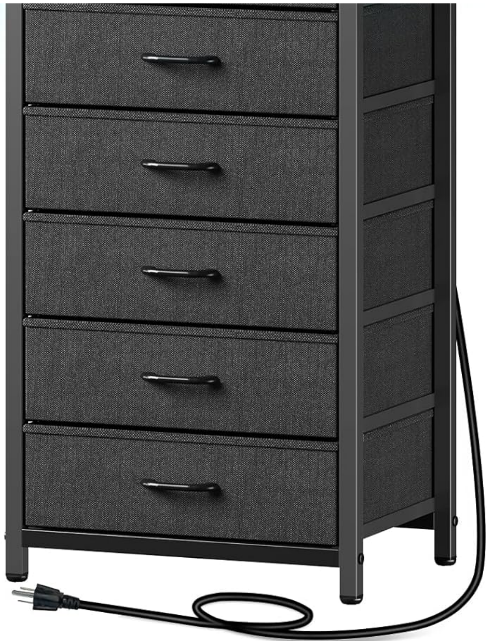
Image: The Seventable Night Stand featuring its integrated LED lighting and a device charging on the top shelf.