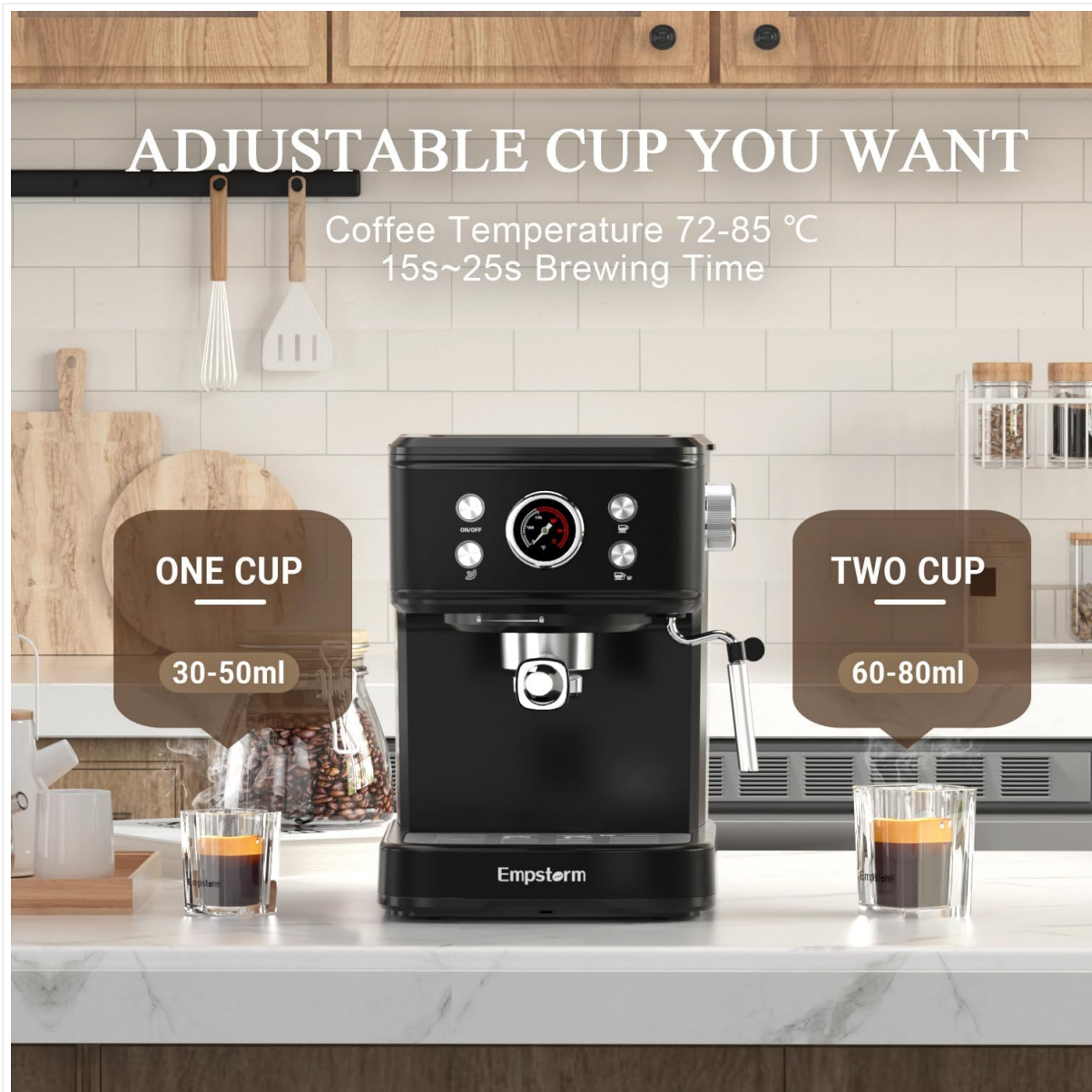
Figure 5: Adjustable cup sizes for brewing.