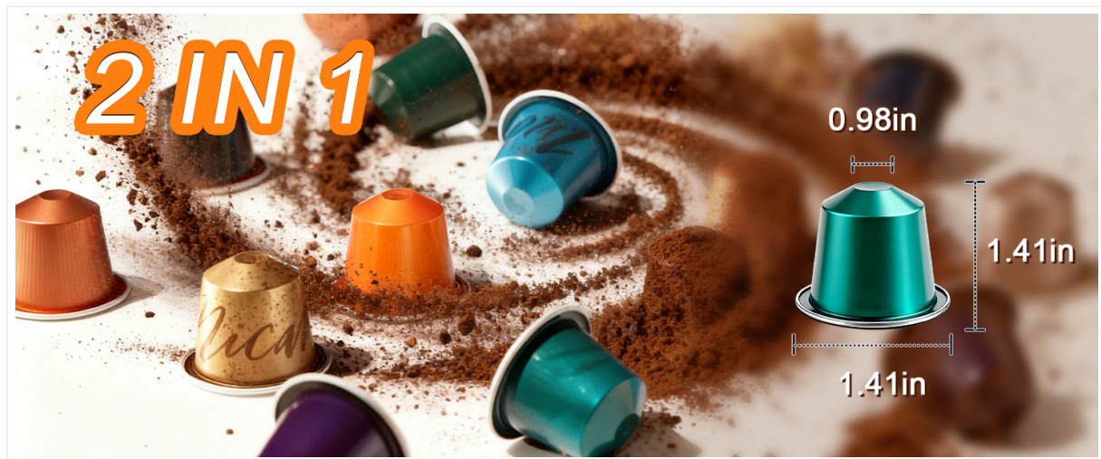
Figure 7: The machine supports both ground coffee and Nespresso Original capsules.

Your browser does not support the video tag.