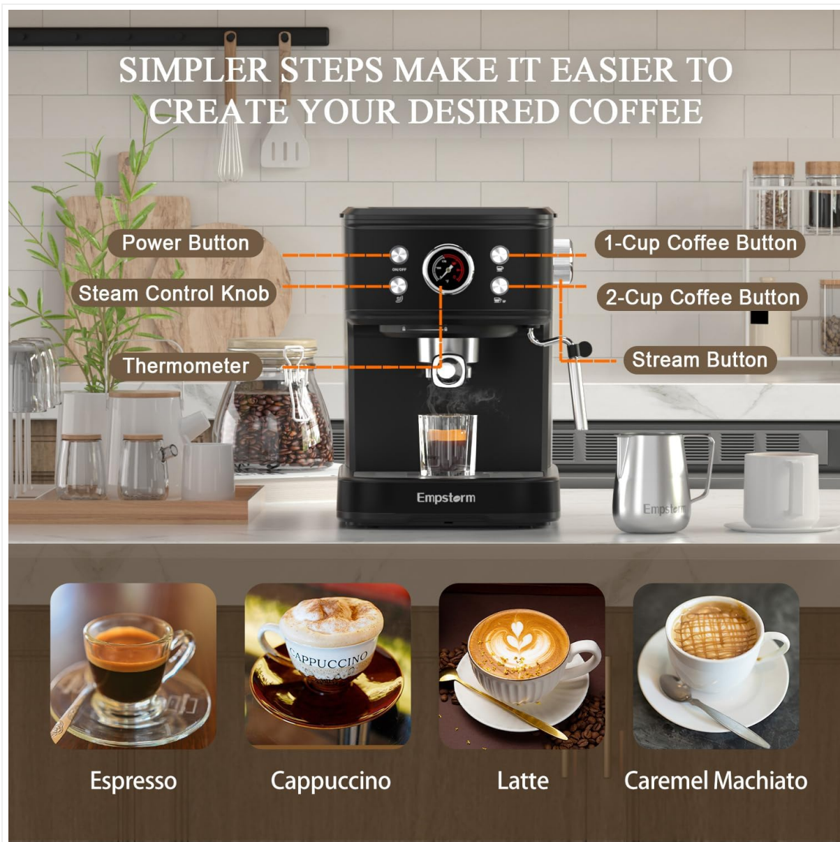
Figure 2: Control panel and labeled parts of the Empstorm Espresso Machine.