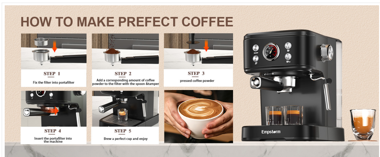
Figure 4: Steps for brewing espresso with ground coffee.