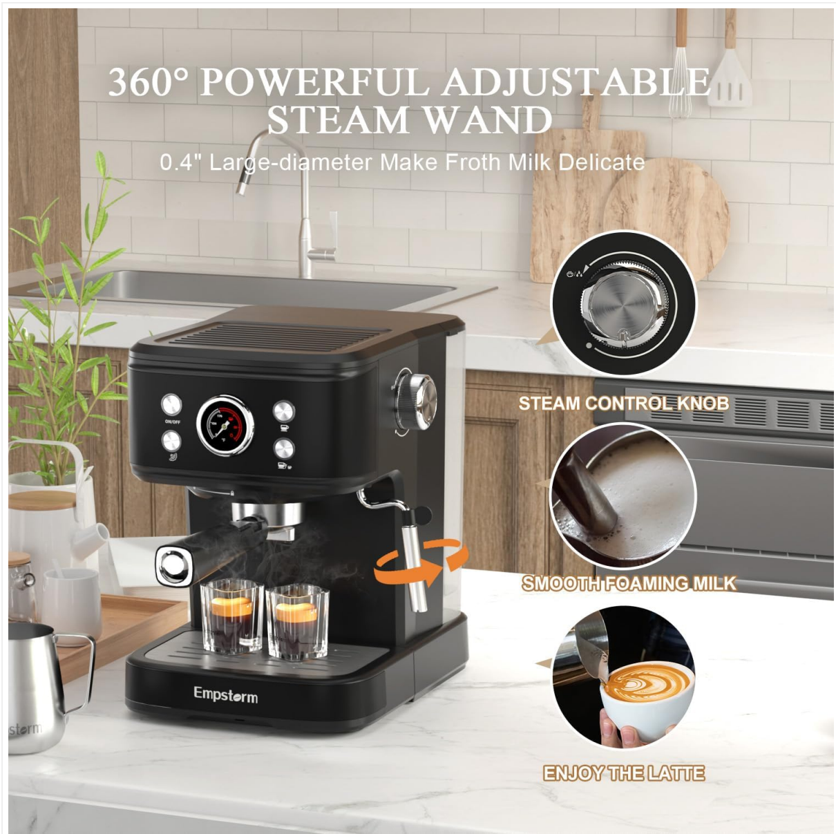
Figure 8: The 360° rotatable steam wand.