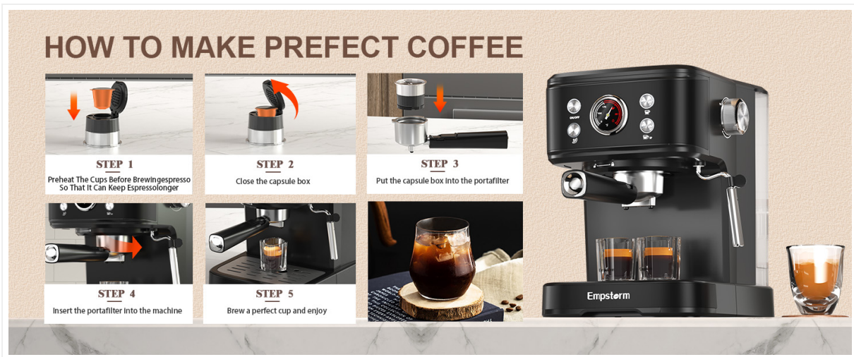
Figure 6: Steps for brewing espresso with coffee capsules.