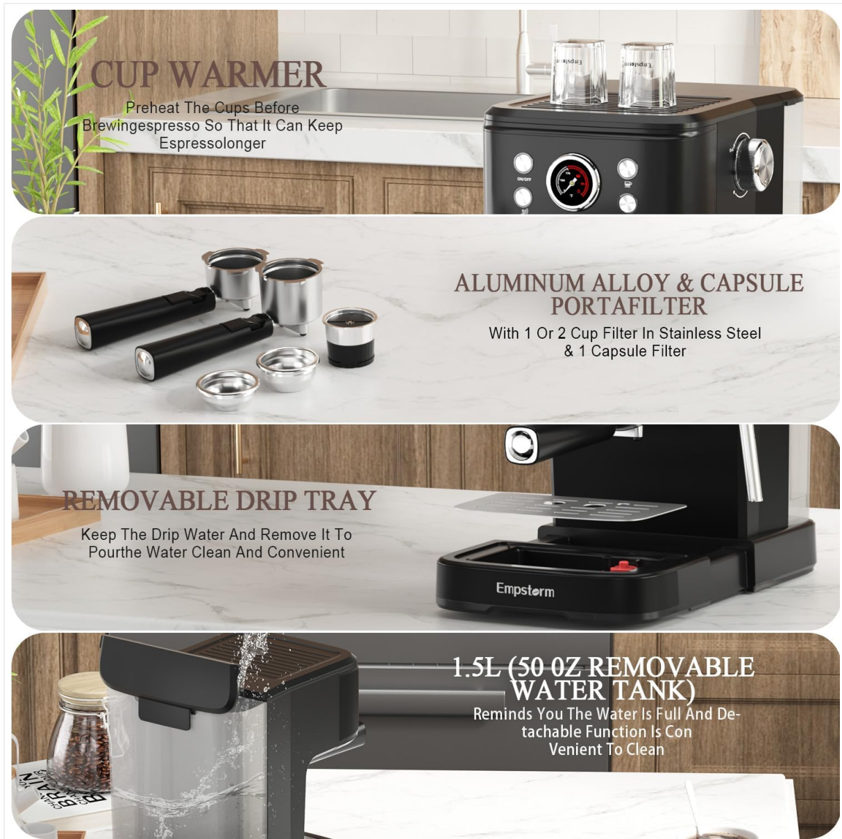
Figure 3: Removable water tank and drip tray.

The machine features a 1.5L (50 oz) removable water tank. Remove the water tank from the back of the machine, fill it with fresh, cold water up to the MAX line, and securely place it back into position.