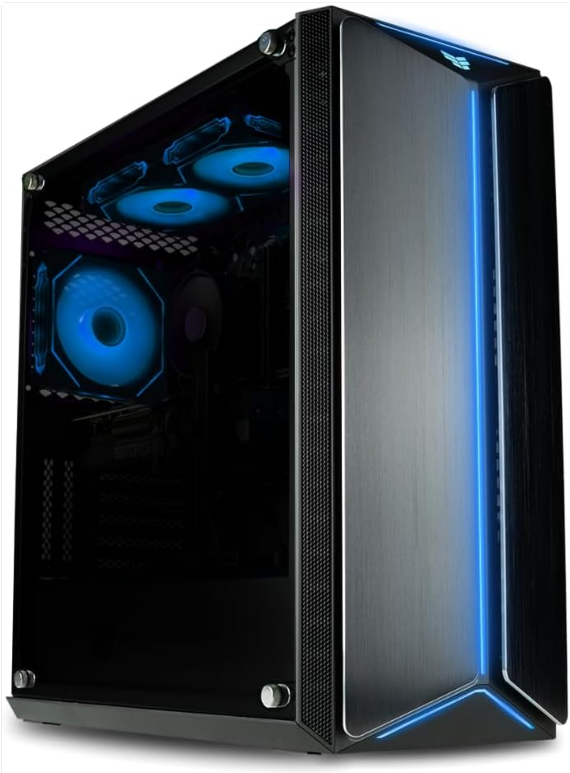
Figure 2.1: The Mantis V2 Gaming Desktop PC, showcasing its sleek design and vibrant blue RGB lighting. This image provides a general overview of the product's appearance.