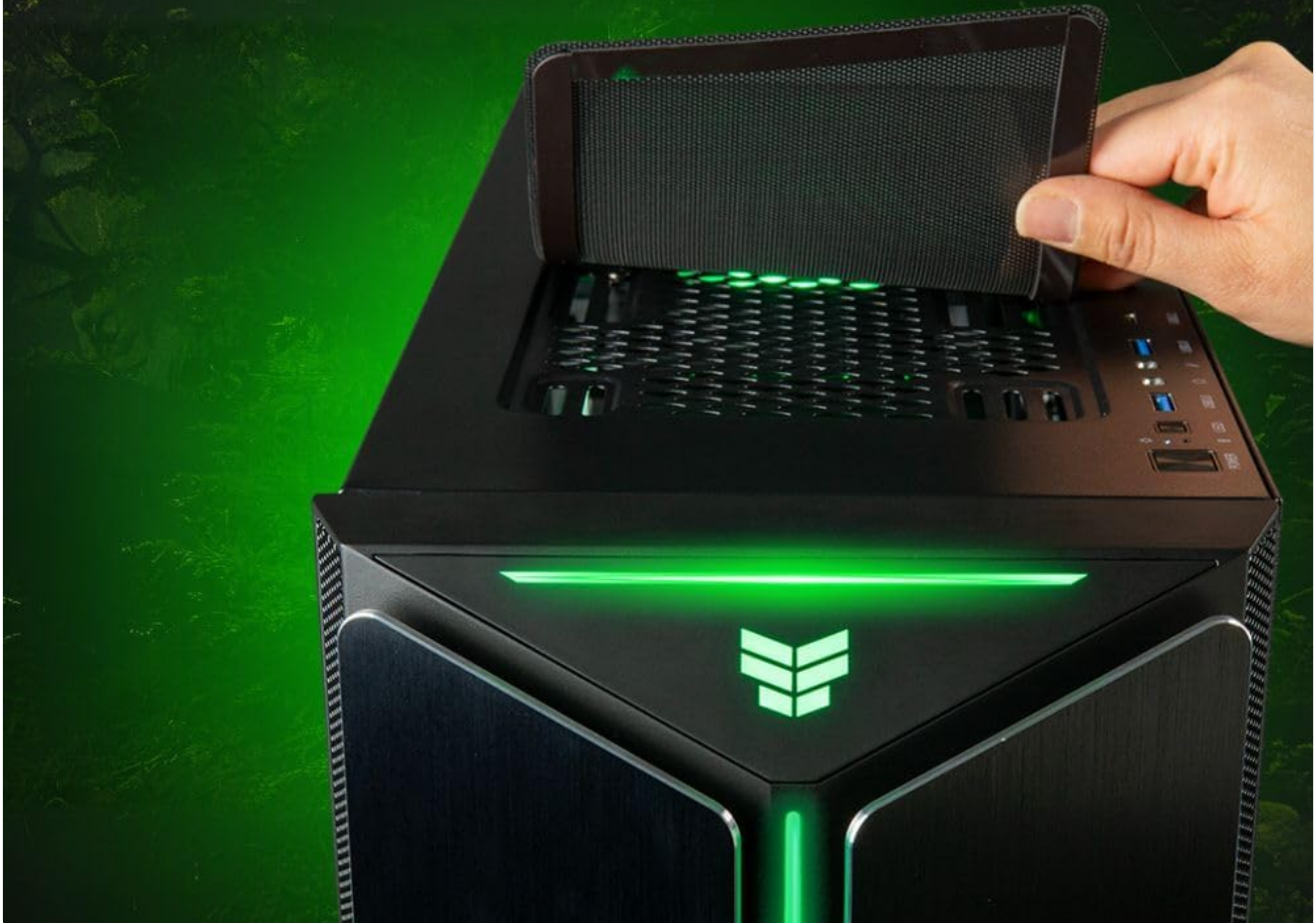
Figure 4.1: The Mantis V2 features a magnetic air filter on its top panel. This filter effectively protects internal components from dust and debris and can be easily removed for cleaning, ensuring consistent airflow and system health.

The top panel has a magnetic dust filter on the case which effectively protects components from debris and because its magnetic it is easy to take off and clean.