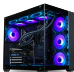
Lifetime Technical and Diagnostic Support