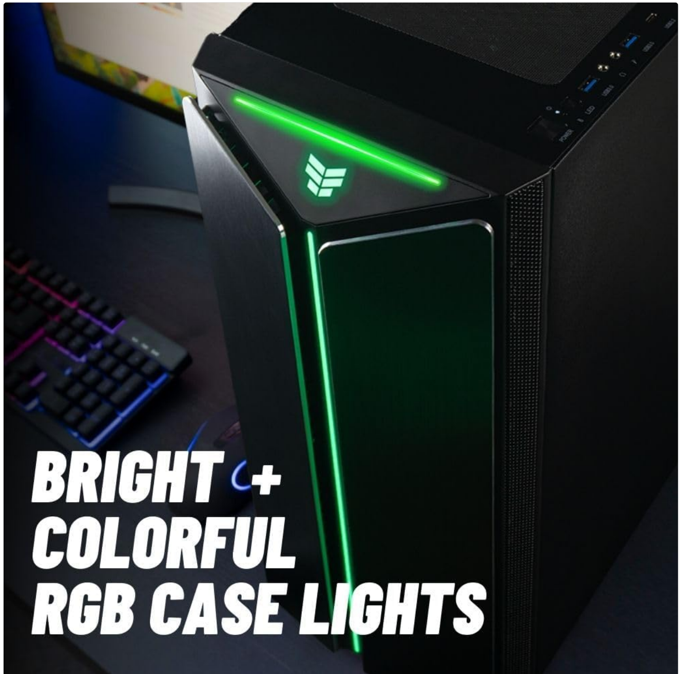
Figure 3.1: The Mantis V2 features bright and colorful RGB case lights, which can be customized to suit user preferences. This image shows the front panel illuminated with green RGB.

The Mantis V2 features vibrant ARGB lighting on the case and fans. Use the dedicated LED button on the top panel to cycle through various lighting modes and colors. Refer to the system's pre-installed RGB control software (if applicable) for advanced customization options.