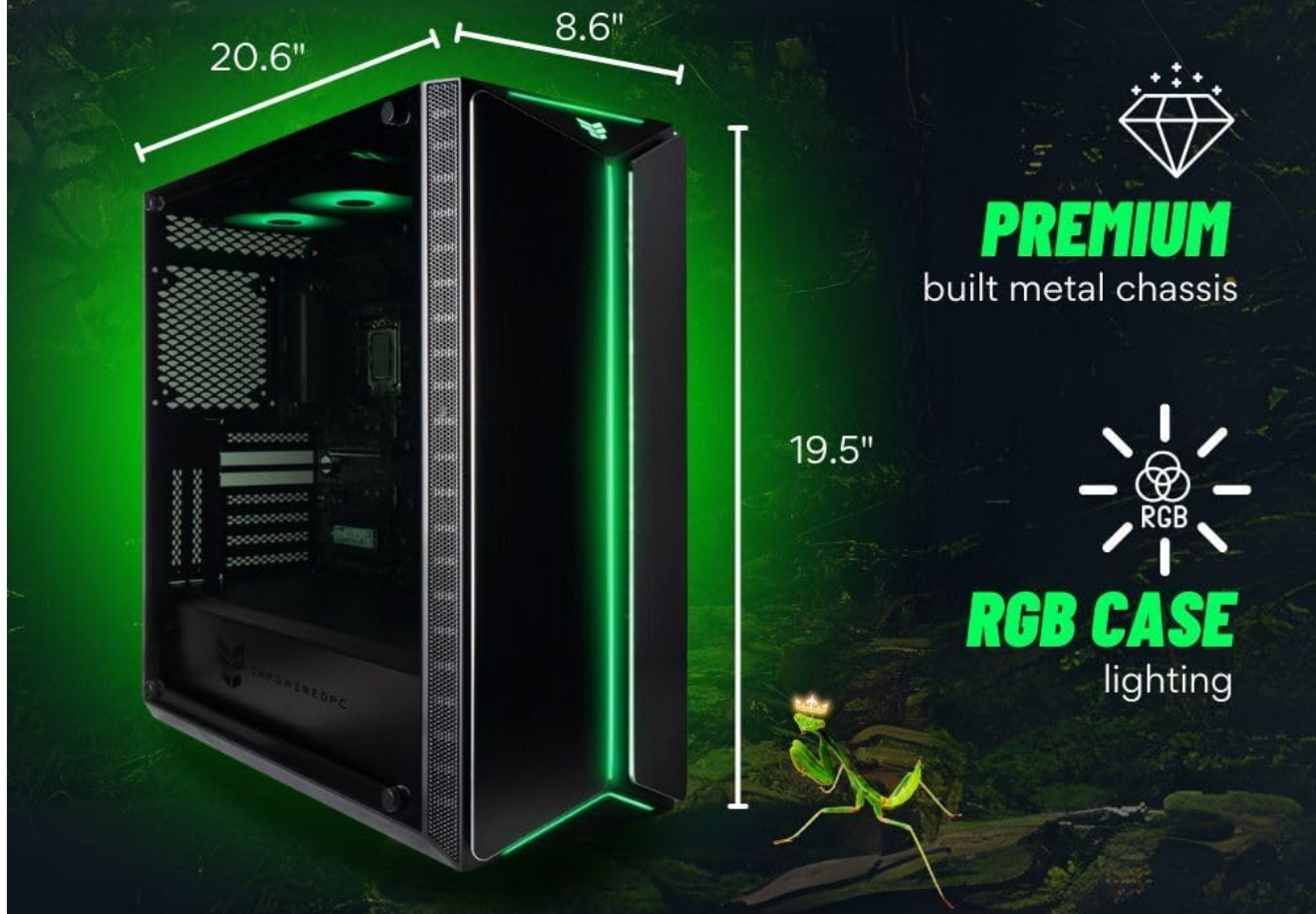
Figure 3.4: The Mantis V2 is an expandable mid-tower PC, with dimensions of approximately 20.6" (L) x 8.6" (W) x 19.5" (H). It features a premium built metal chassis and customizable RGB case lighting, providing a robust and visually appealing platform for upgrades.

Built in a Mid-tower case, this system offers expandability and seamless upgrade compatibility, ensuring future-proof performance.