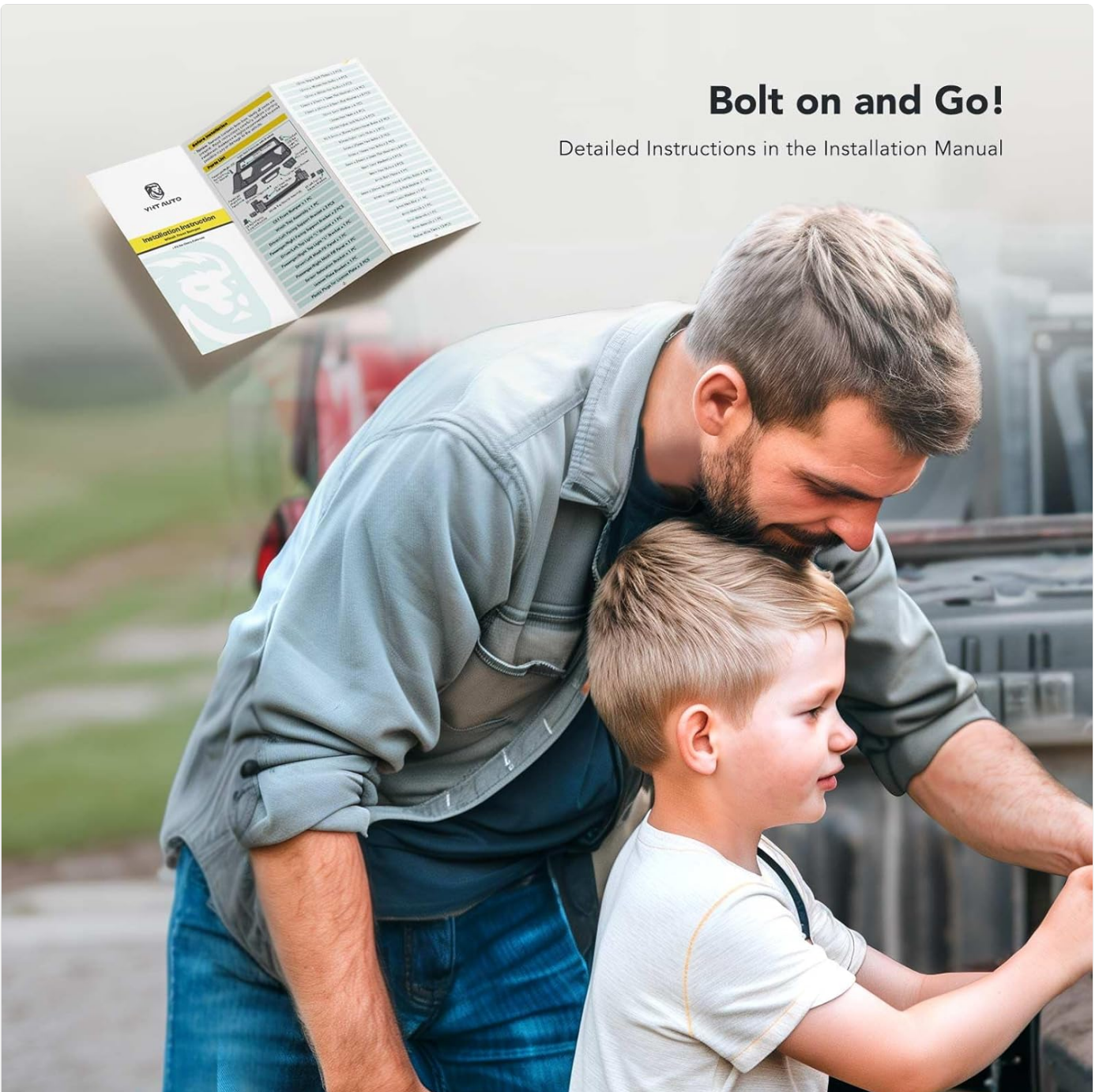
Image 4.1: This image depicts a father and son working together to install the bull bar, highlighting the product's user-friendly design and straightforward installation process.

Detailed Instructions in the Installation Manual