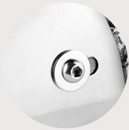
Image 3.2: A detailed view demonstrating the precision of CNC machining, ensuring accurate dimensions and a scientific radian design for a stylish look.