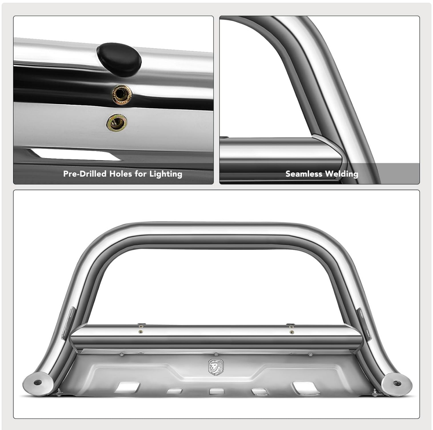
Image 3.4: A close-up view showcasing the pre-drilled holes for auxiliary lighting and the seamless welding, which ensures structural integrity and a smooth appearance.