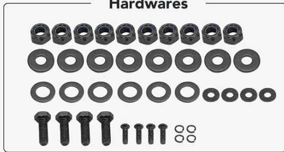
Image 2.2: Detailed diagram illustrating the bull bar's dimensions (approximately 42.36 inches wide and 21.91 inches high) and the various mounting bases and hardware included in the package.