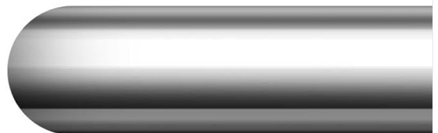
Image 3.1: This image highlights the S/S 304 Stainless Steel construction and the mirror-polished finish of the bull bar, emphasizing its durability and aesthetic appeal.