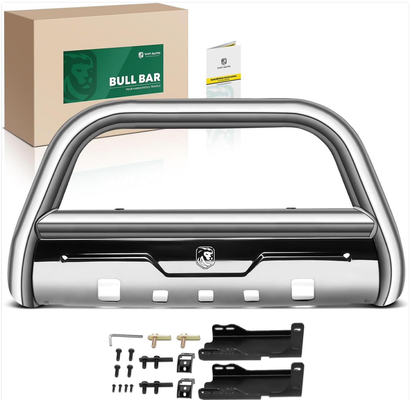
Image 2.1: Overview of the YHTAUTO 3.5" Bull Bar and its packaged components, including the bull bar, skid plate, and hardware kit.