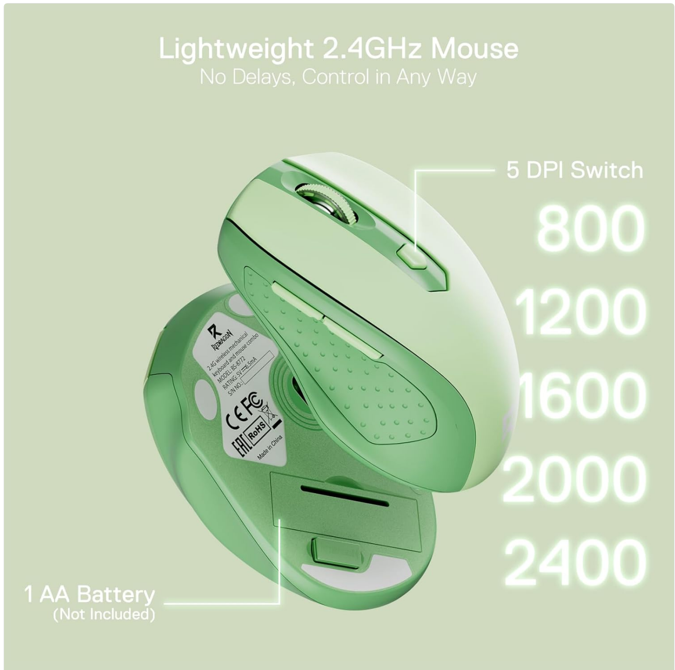
Image 4.2: The underside of the Redragon wireless mouse, illustrating the 5 adjustable DPI levels (800, 1200, 1600, 2000, 2400) and the location of the AA battery compartment.

adjust cursor sensitivity to match your preference or the demands of your task.