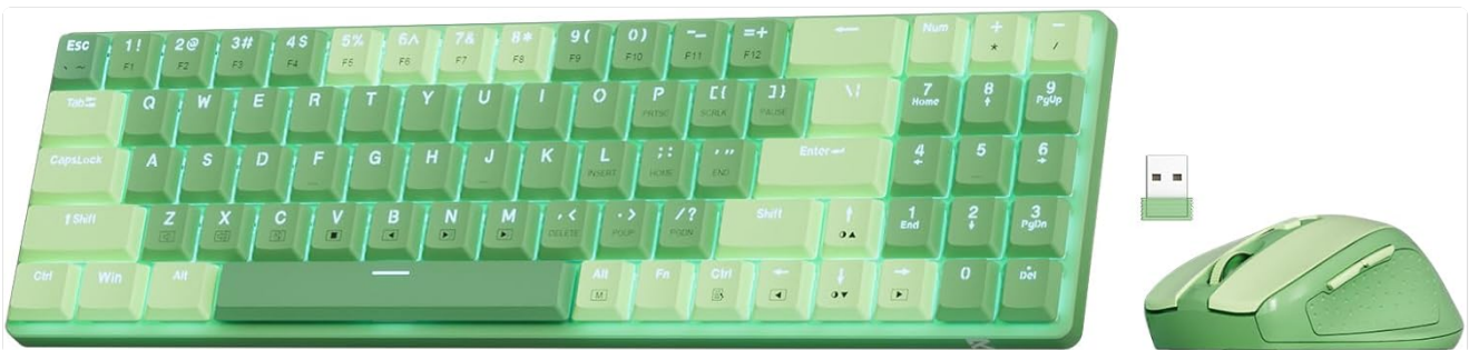
Image 1.1: The Redragon BS8772 Wireless Keyboard and Mouse Combo in Herb Green.

This manual provides detailed instructions for the Redragon BS8772 Wireless Keyboard and Mouse Combo. This combo features a 75% layout mechanical keyboard with low-profile keys and a 2.4Ghz wireless connection, paired with an ergonomic mouse offering 5 adjustable DPI levels. It is designed for enhanced productivity and comfort, offering a clutter-free workspace and quiet operation. The keyboard includes a built-in rechargeable battery, and the mouse operates on a single AA battery.