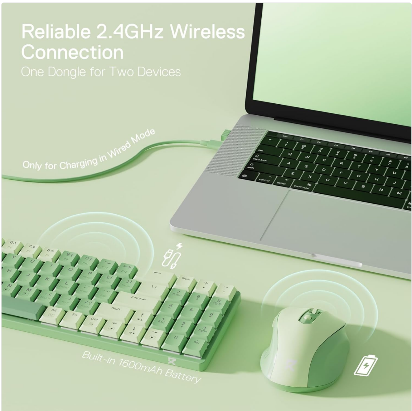
Image 3.1: Illustration of the 2.4GHz wireless connection setup, showing the USB receiver and the keyboard charging via USB cable.