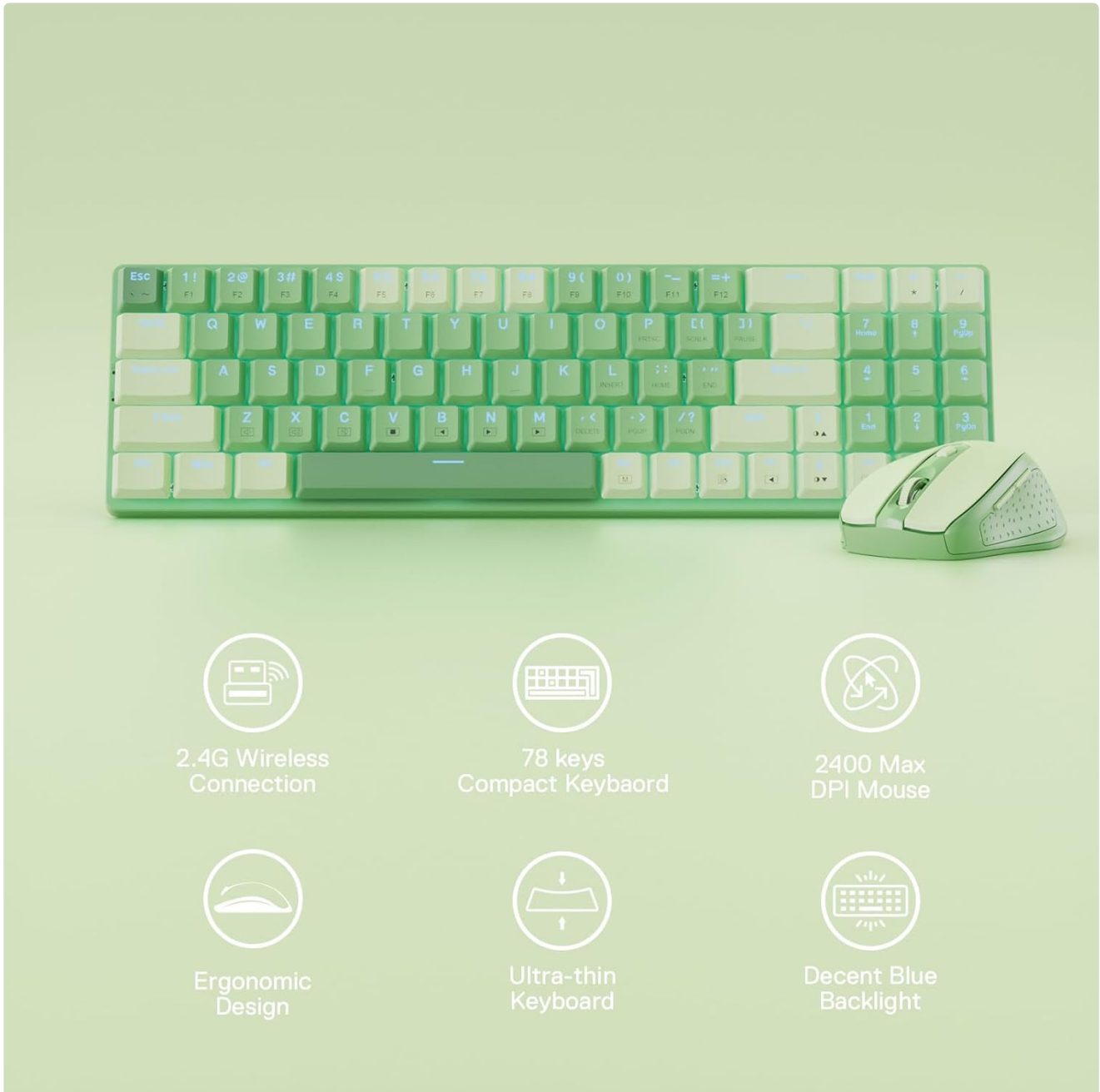
Image 7.1: An overview of the key features of the Redragon BS8772 Wireless Keyboard and Mouse Combo, including 2.4G wireless connection, 78 keys compact keyboard, 2400 Max DPI mouse, ergonomic design, ultra-thin keyboard, and decent blue backlight.