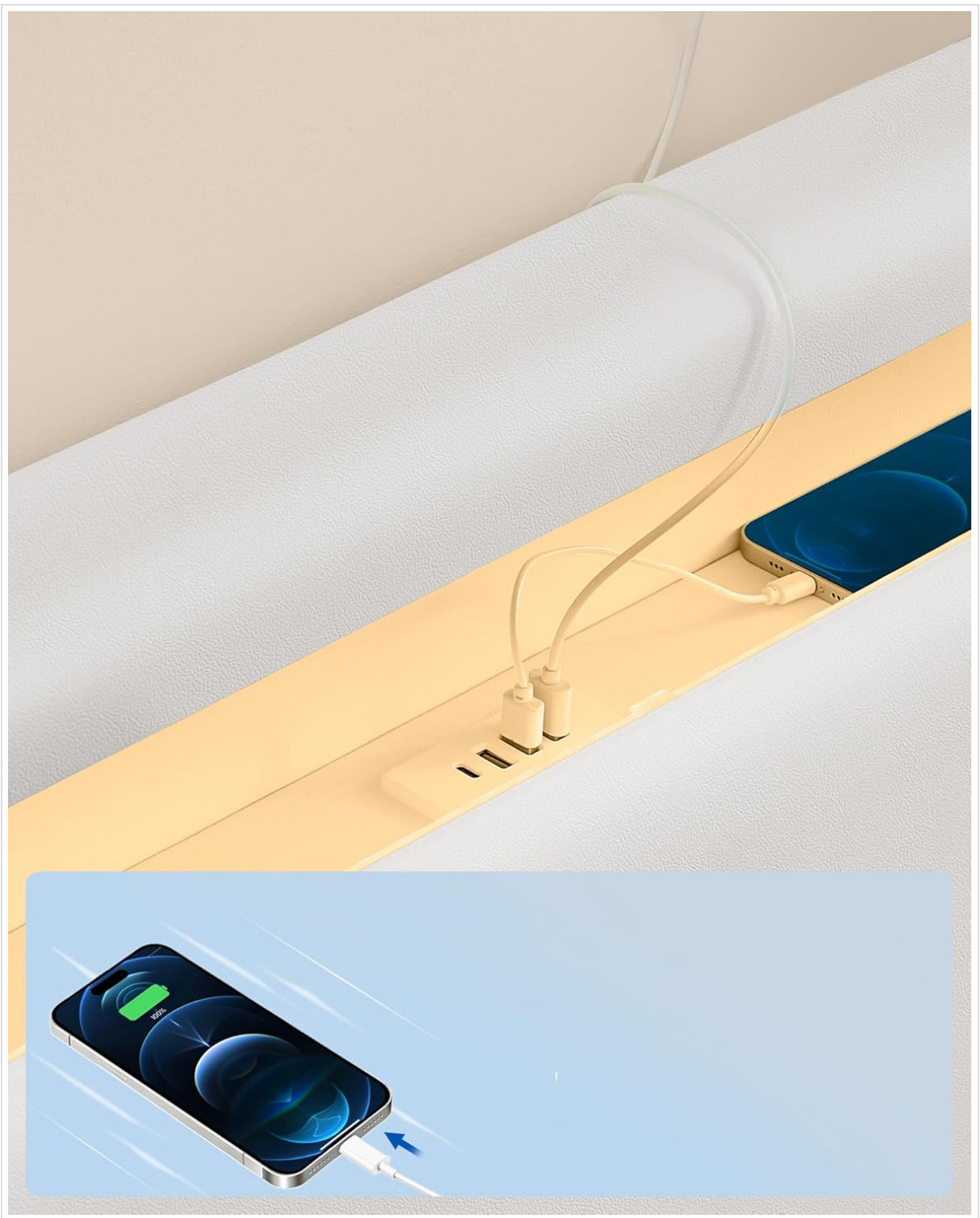
Figure 5: Integrated USB-A and USB-C charging ports on the headboard.