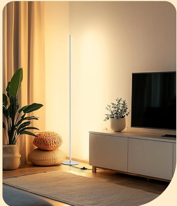
Figure 7: Versatile placement in different room types.