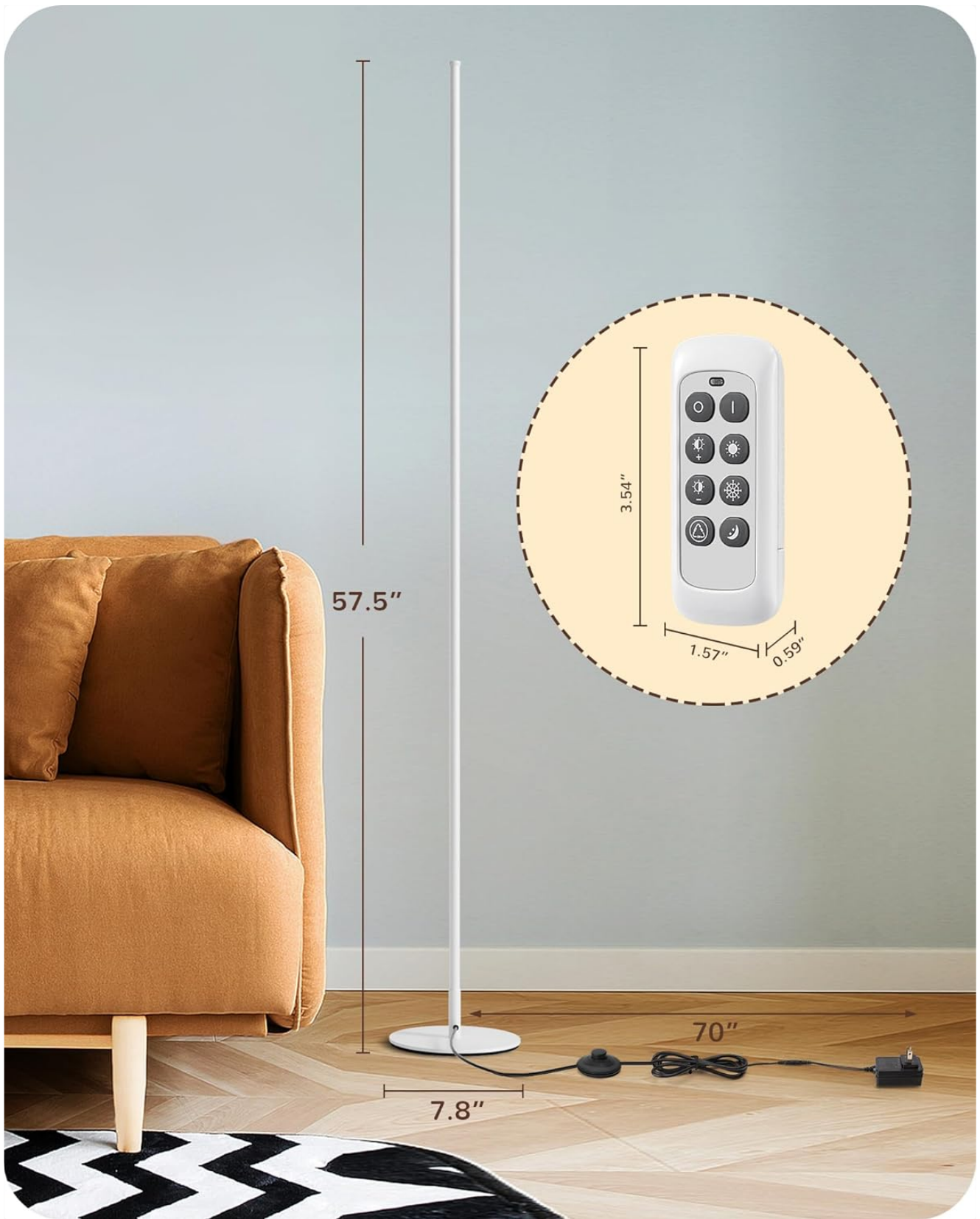
Figure 2: Lamp dimensions (57.5 inches tall, 7.8 inch base) and remote control layout.