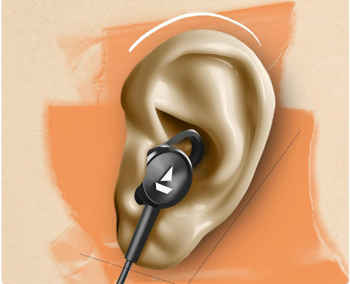
Image: An illustration showing the earphone securely placed within the ear, highlighting the customized fit crafted for ultimate comfort.