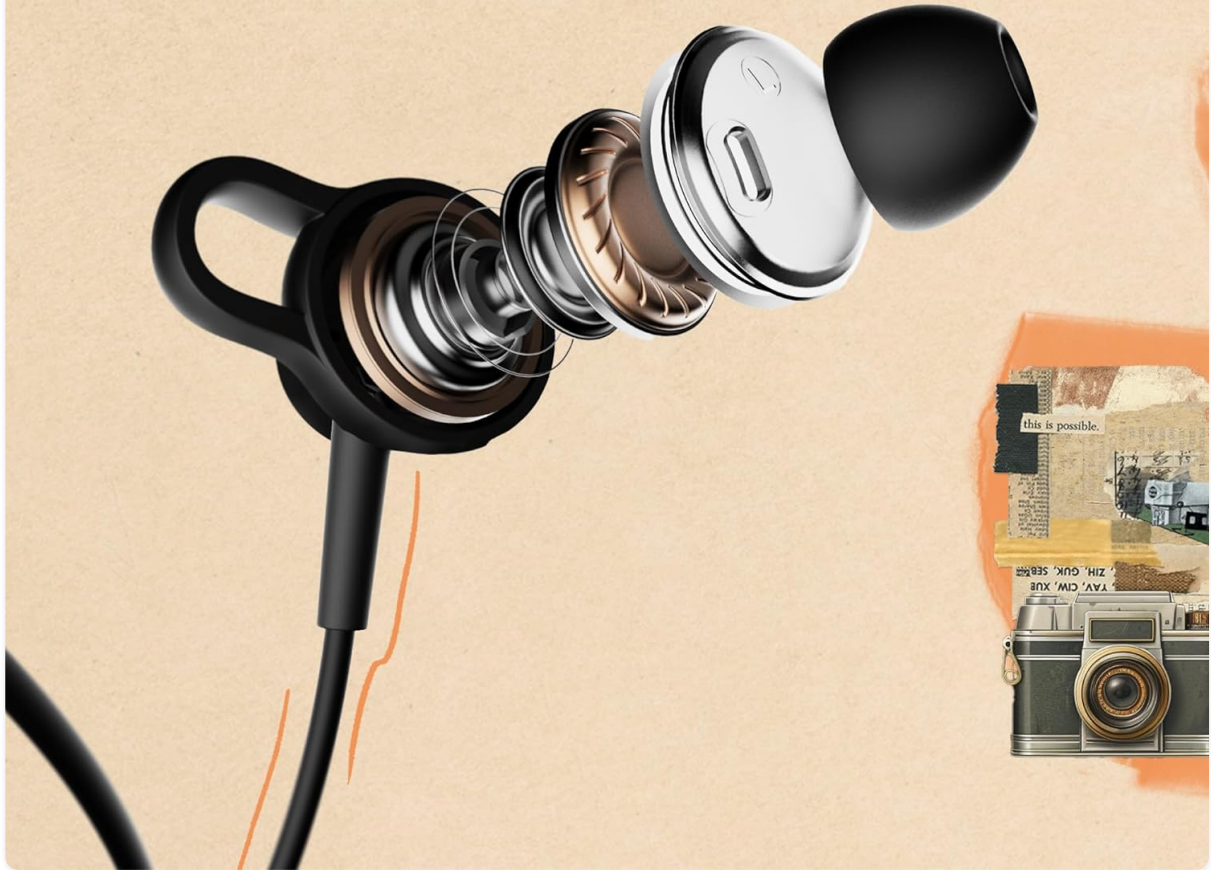
Image: An exploded view of the earphone's driver unit, showcasing the 13mm drivers responsible for premium sound quality.