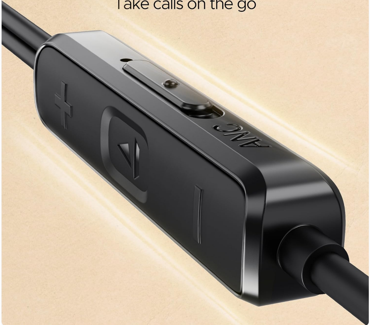
Image: A close-up of the in-line microphone component, emphasizing its function for taking calls on the go.