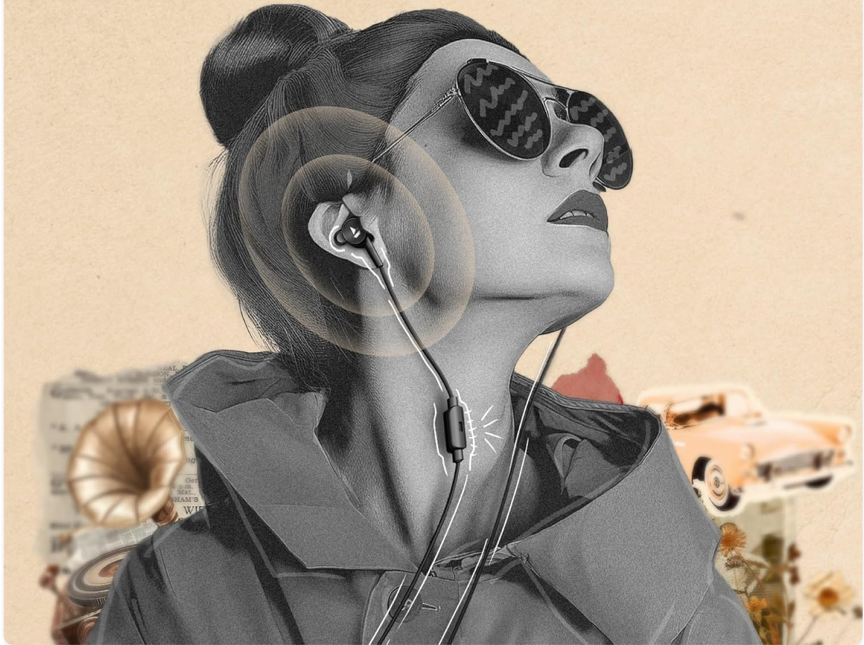
Image: A person wearing the earphones, with visual cues indicating sound waves being cancelled around the ear, highlighting the 25dB Active Noise Cancellation feature.