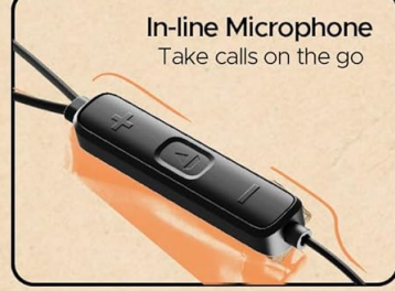
Image: An infographic highlighting key features such as Active Noise Cancellation, Ambient Mode, Type-C Interface, 13mm Drivers, Integrated Controls, Customized Fit, and In-line Microphone.