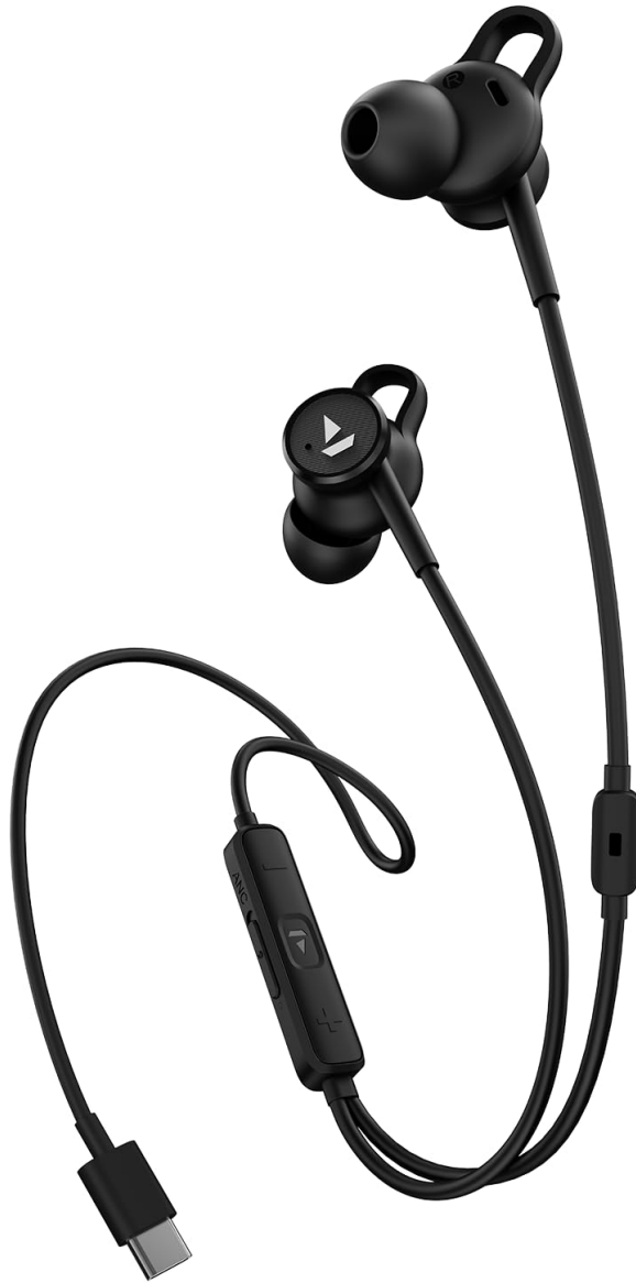
Image: boAt Bassheads 122 ANC Wired Earphones, showcasing the black earphones with Type-C connector and in-line controls.