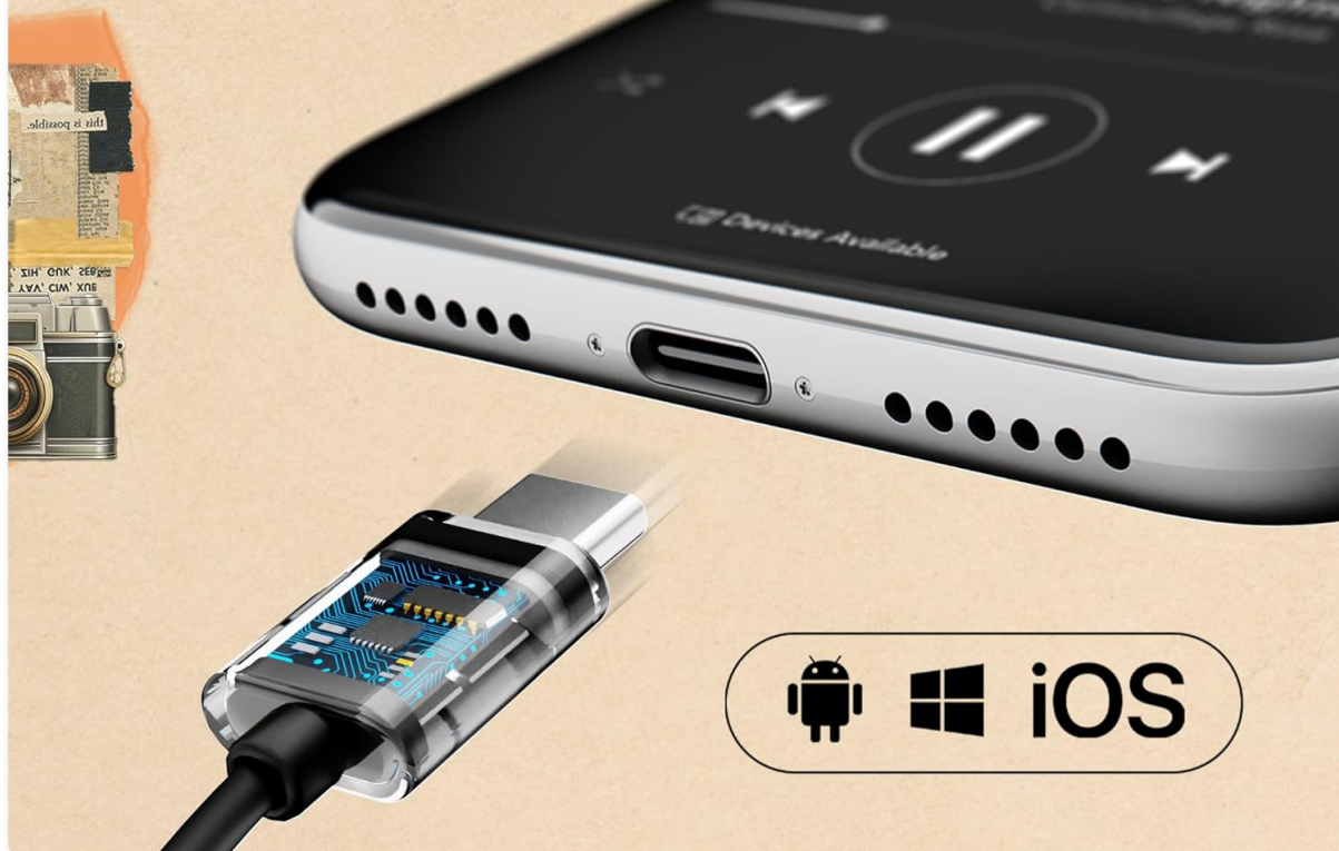
Image: A close-up of the Type-C interface, showing the earphone's connector plugging into a smartphone, illustrating universal compatibility with Android and iOS devices.