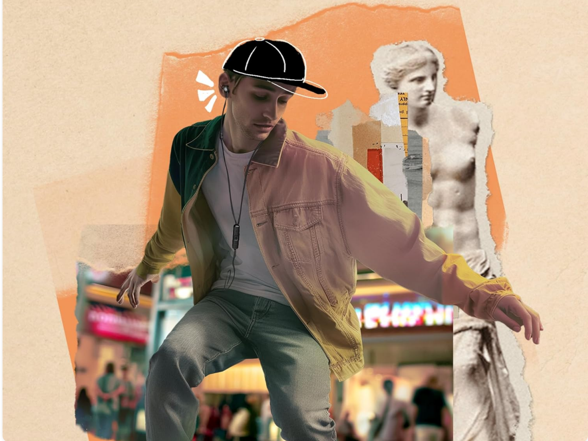
Image: A person in an urban setting wearing the earphones, with visual cues indicating awareness of surrounding sounds, demonstrating the Ambient Mode feature.