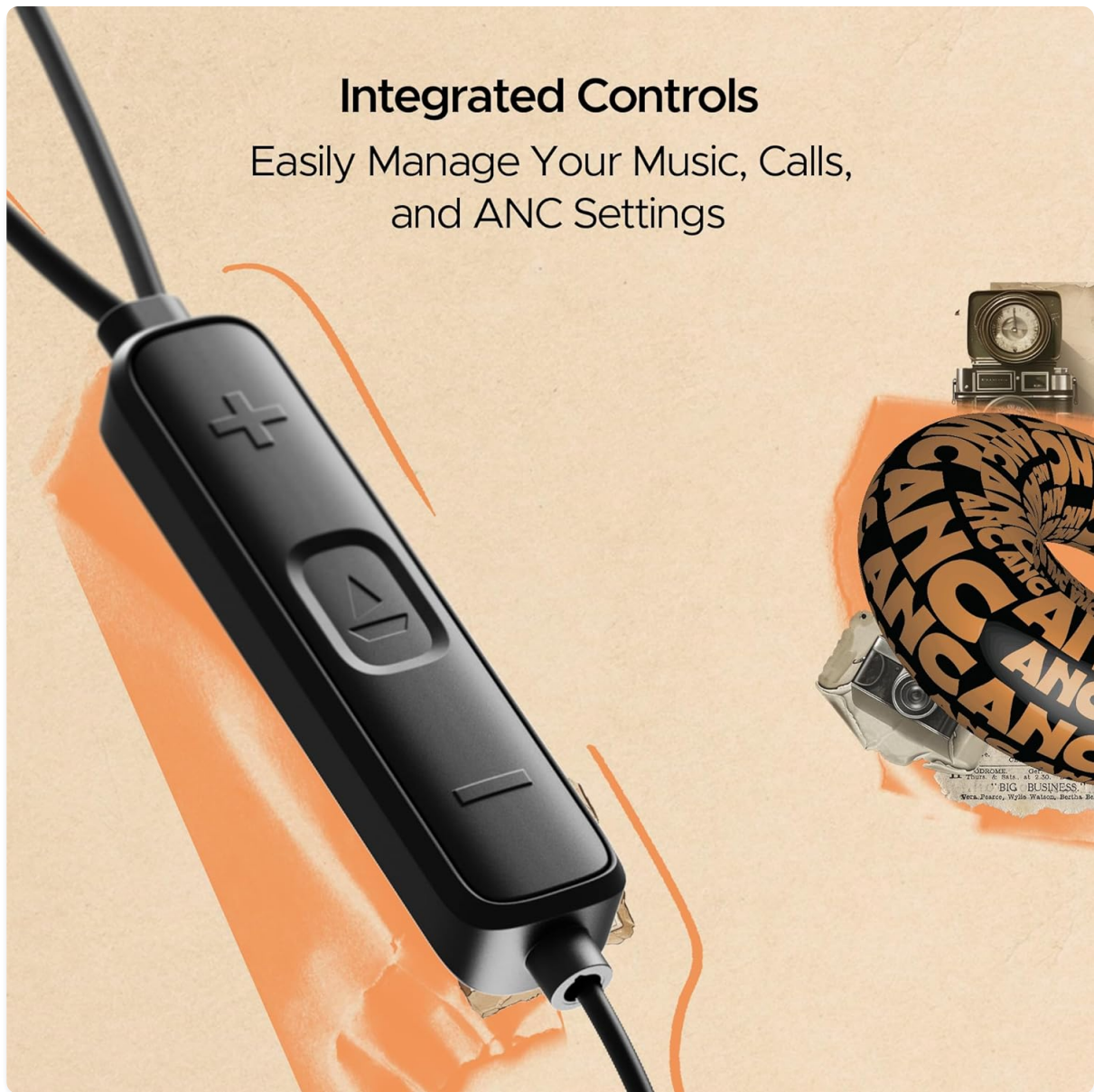
Image: A close-up of the in-line control module, showing the volume buttons, multi-functional button, and ANC switch, indicating easy management of music, calls, and ANC settings.