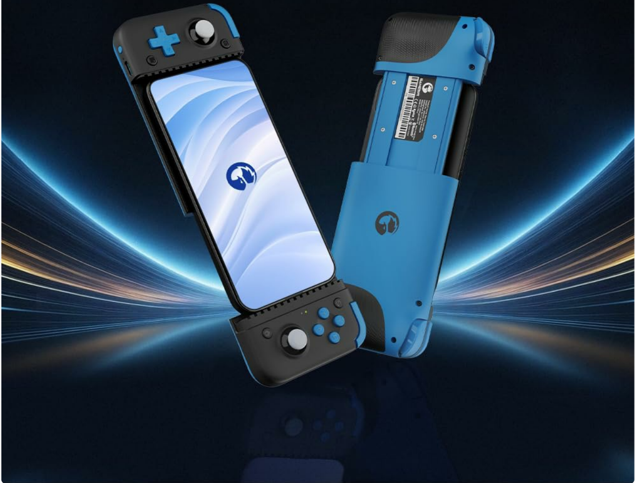
Image 1: GameSir X2s Bluetooth Mobile Gaming Controller with a smartphone.