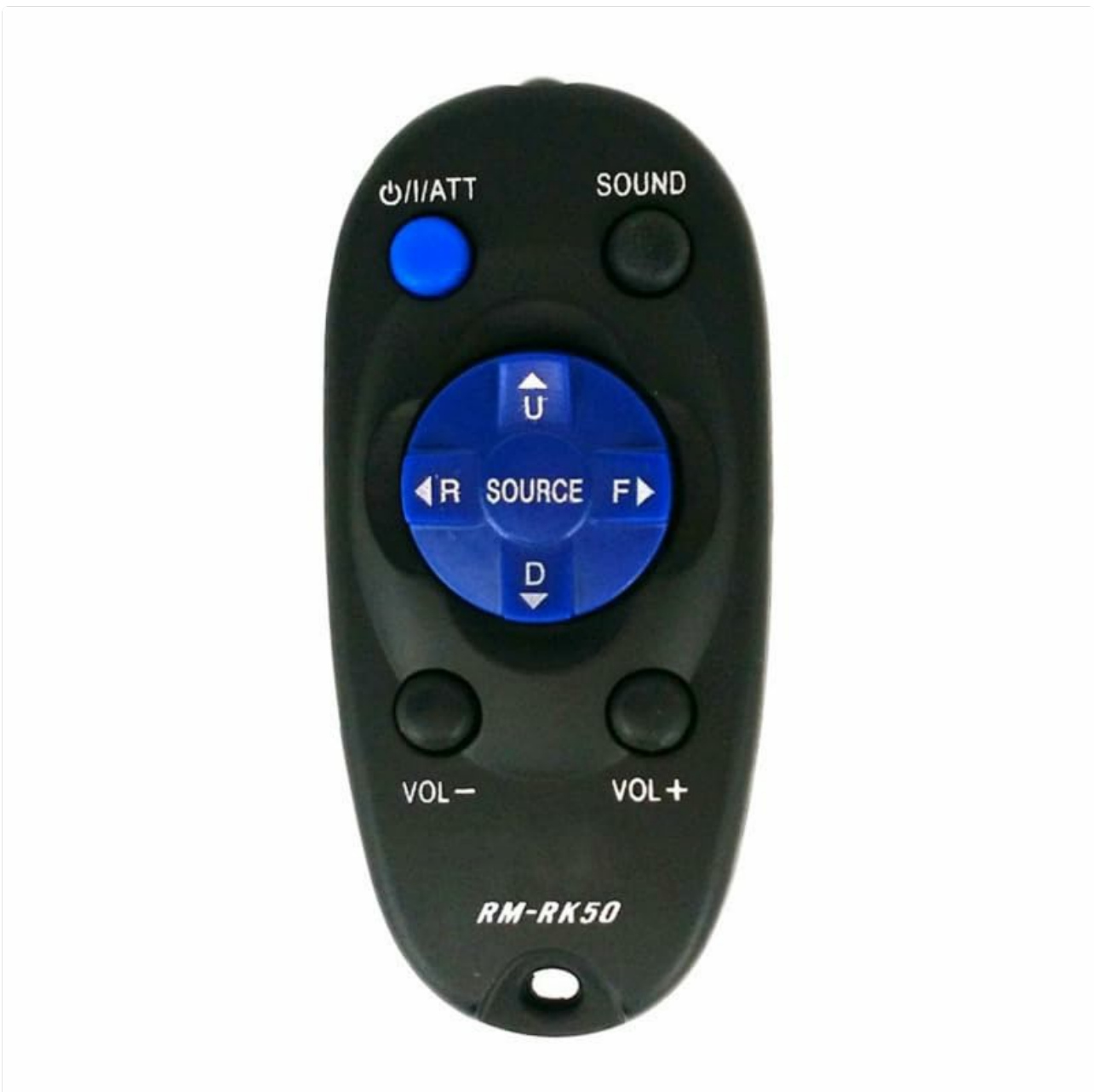
Image: Front view of the KRPTQJoo RM-RK50 remote control. It is black with blue circular buttons for navigation (Up, Down, Left, Right, Source) and a blue power button. Other buttons include Sound, Volume -, and Volume +.