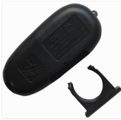
Image: Back of the remote control with the battery cover detached, revealing the battery compartment.