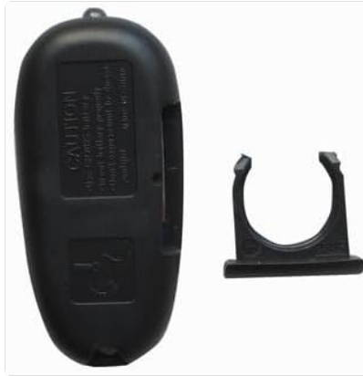
Image: Back of the remote control with the battery cover partially slid off, showing the mechanism for removal.